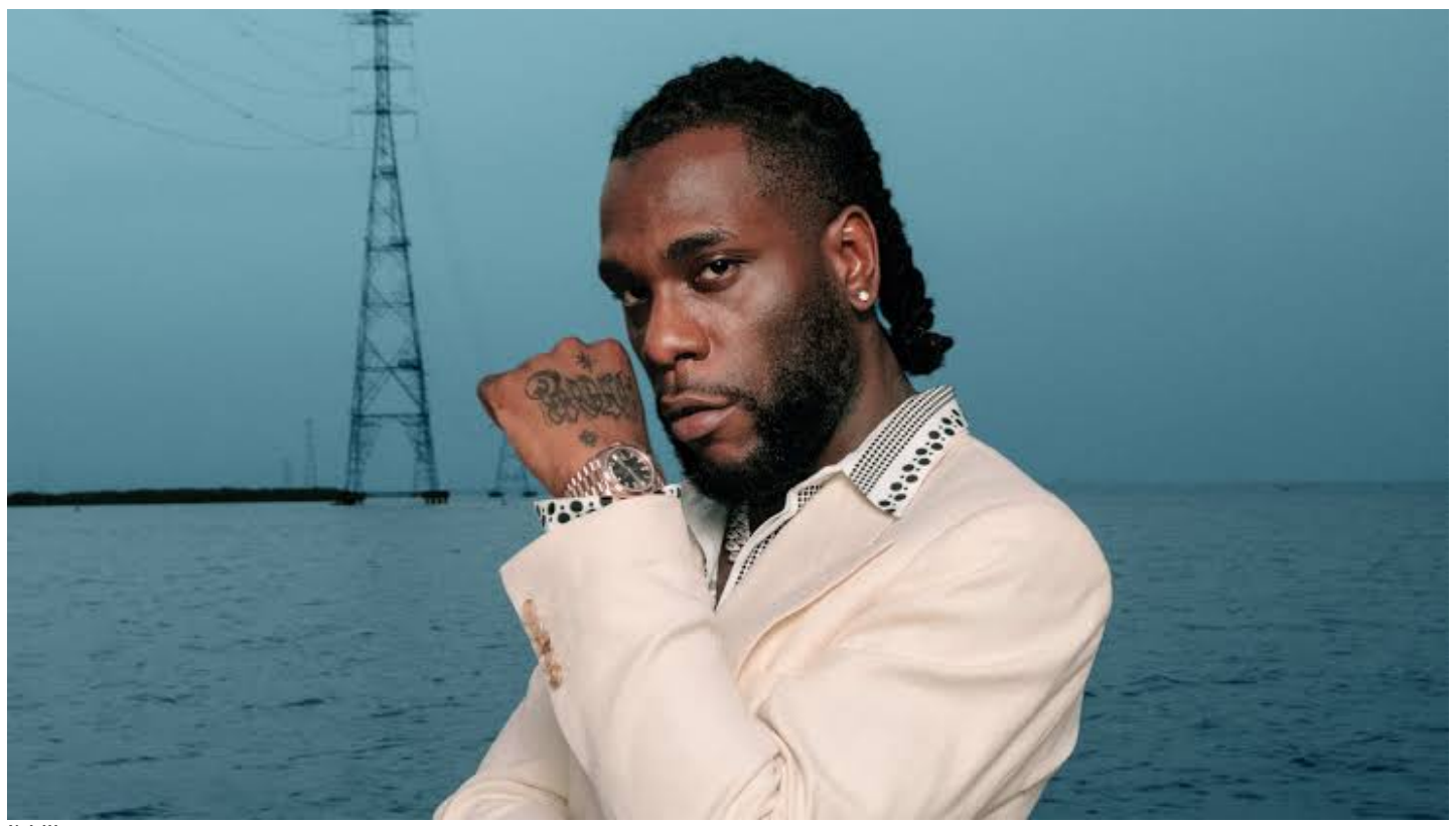
I'd like to

Pick whichever sounds nice to your ear before you continue reading this thread