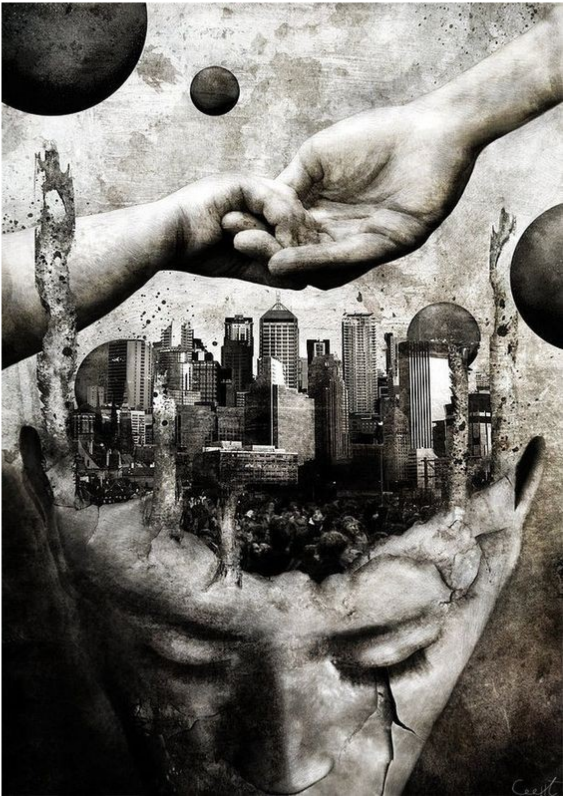
To be continued. Good night and blessings, to help you discern your way.