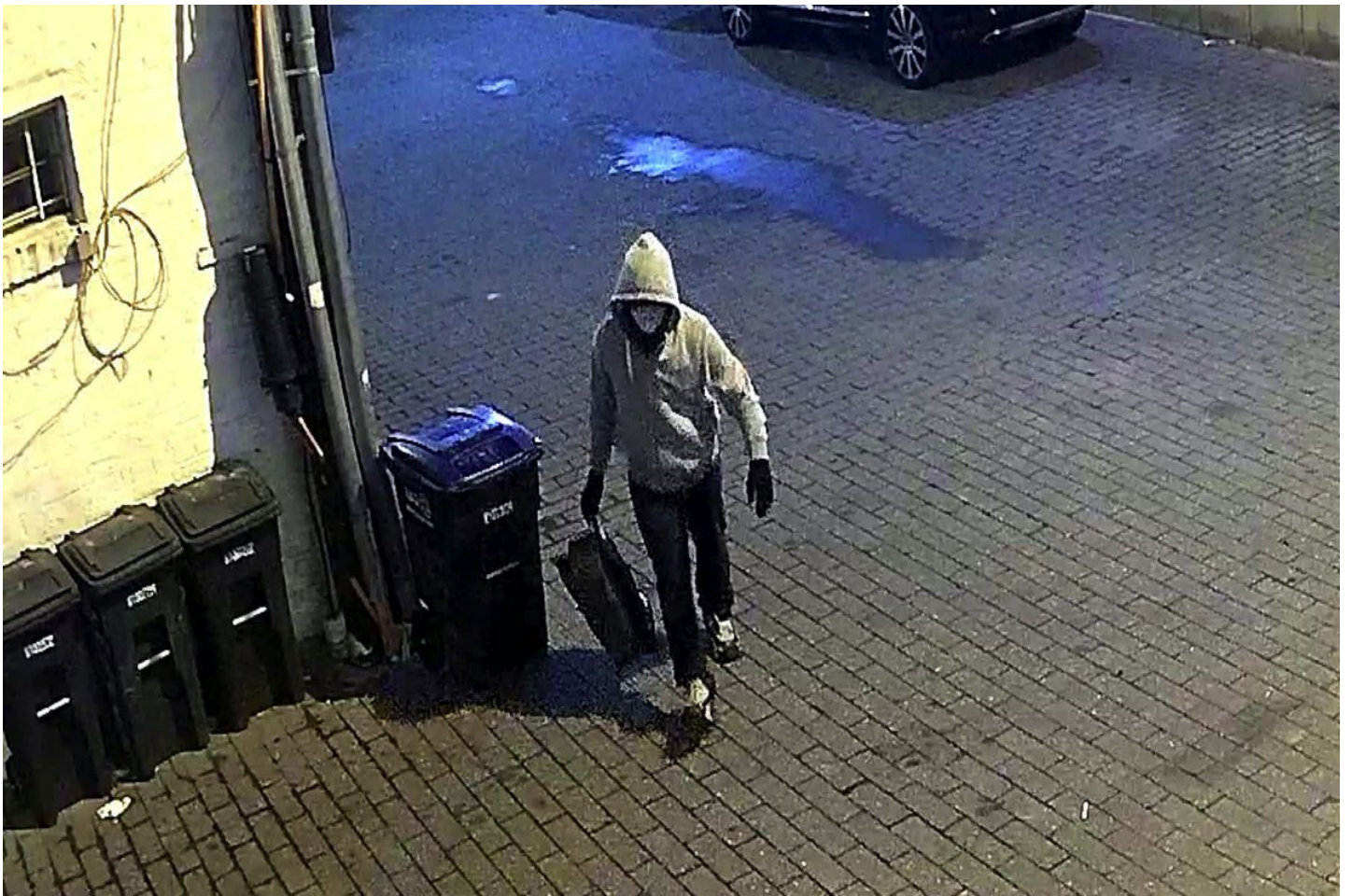
According to the FBI, this man is suspected of having placed two pipe bombs. The published image gives very little information but it may have been taken at the rear of the RNC building. (Incidentally, the 70-year-old's car was also parked on that street).