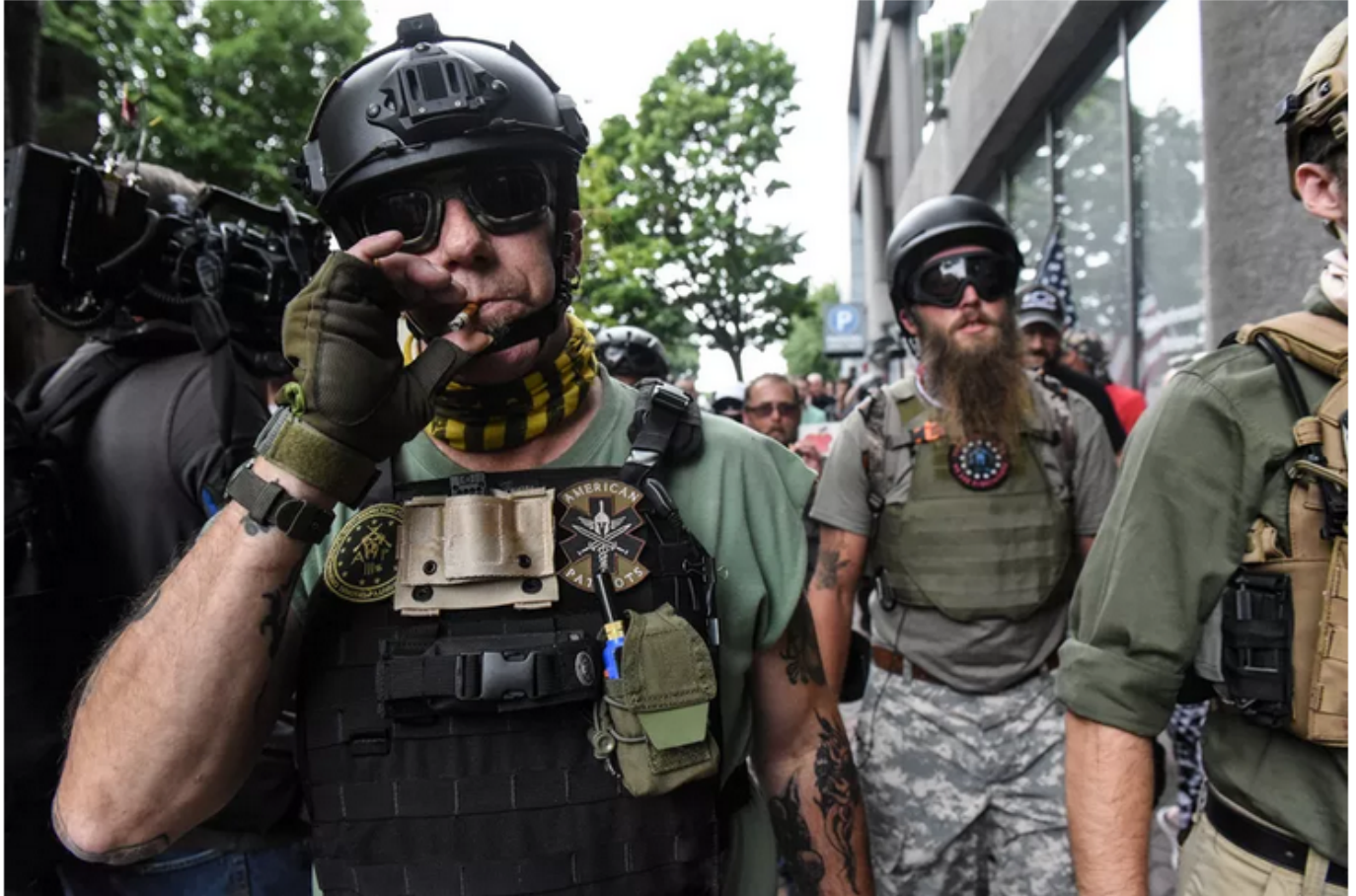
Protesters belonging to a group that calls itself the Three Percenters attend an alt-right rally on August 17, 2019, in Portland, Oregon.