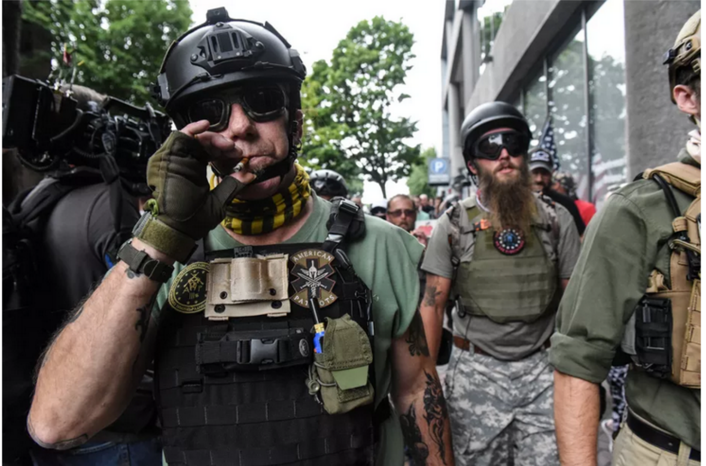
Protesters belonging to a group that calls itself the Three Percenters attend an alt-right rally on August 17, 2019, in Portland, Oregon.