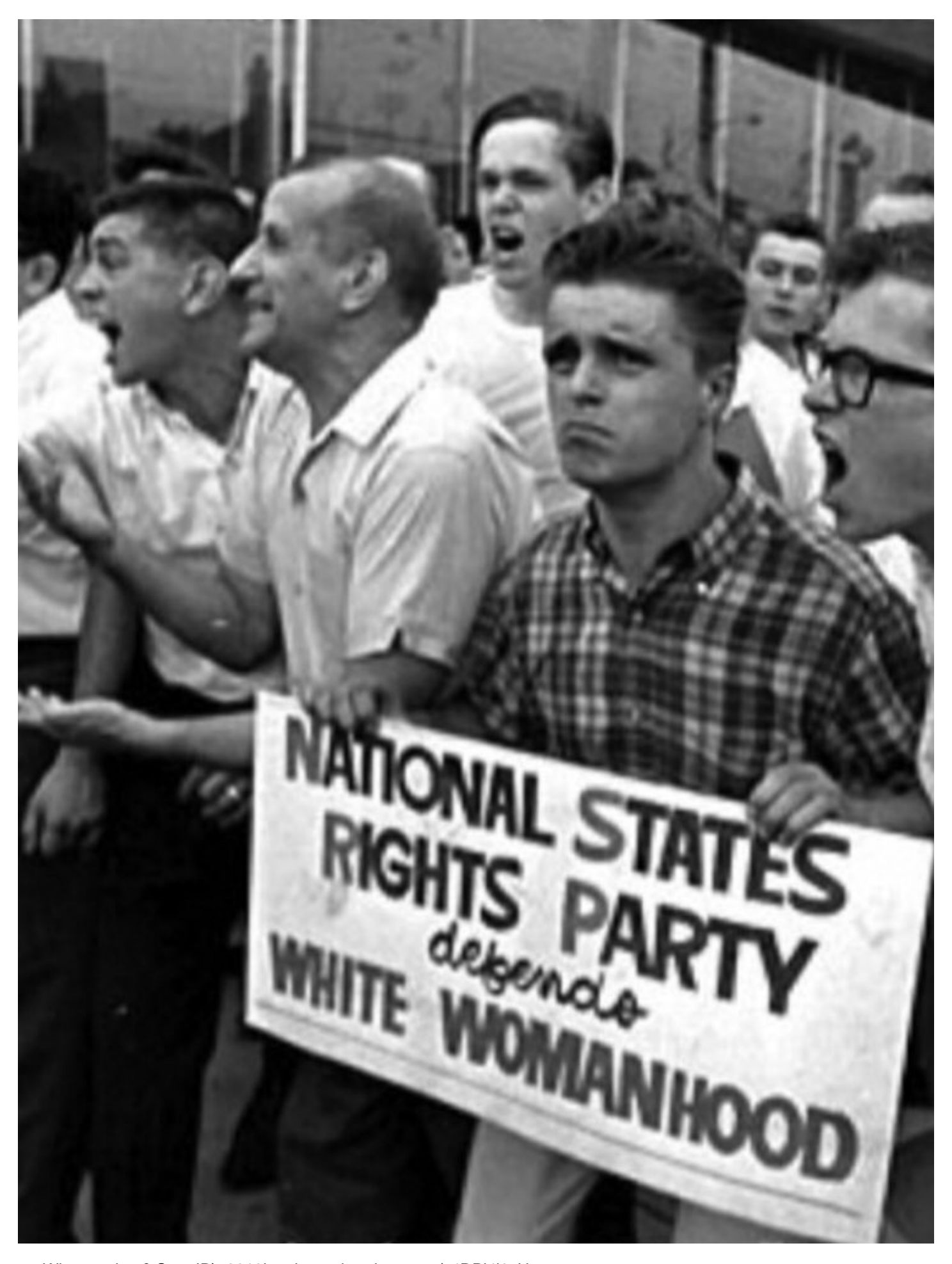
Who are they? Start ID\u2019ing them \underline{\text{pic.twitter.com/c4RPj4l0zU}}

— chris evans (@notcapnamerica) January 6, 2021