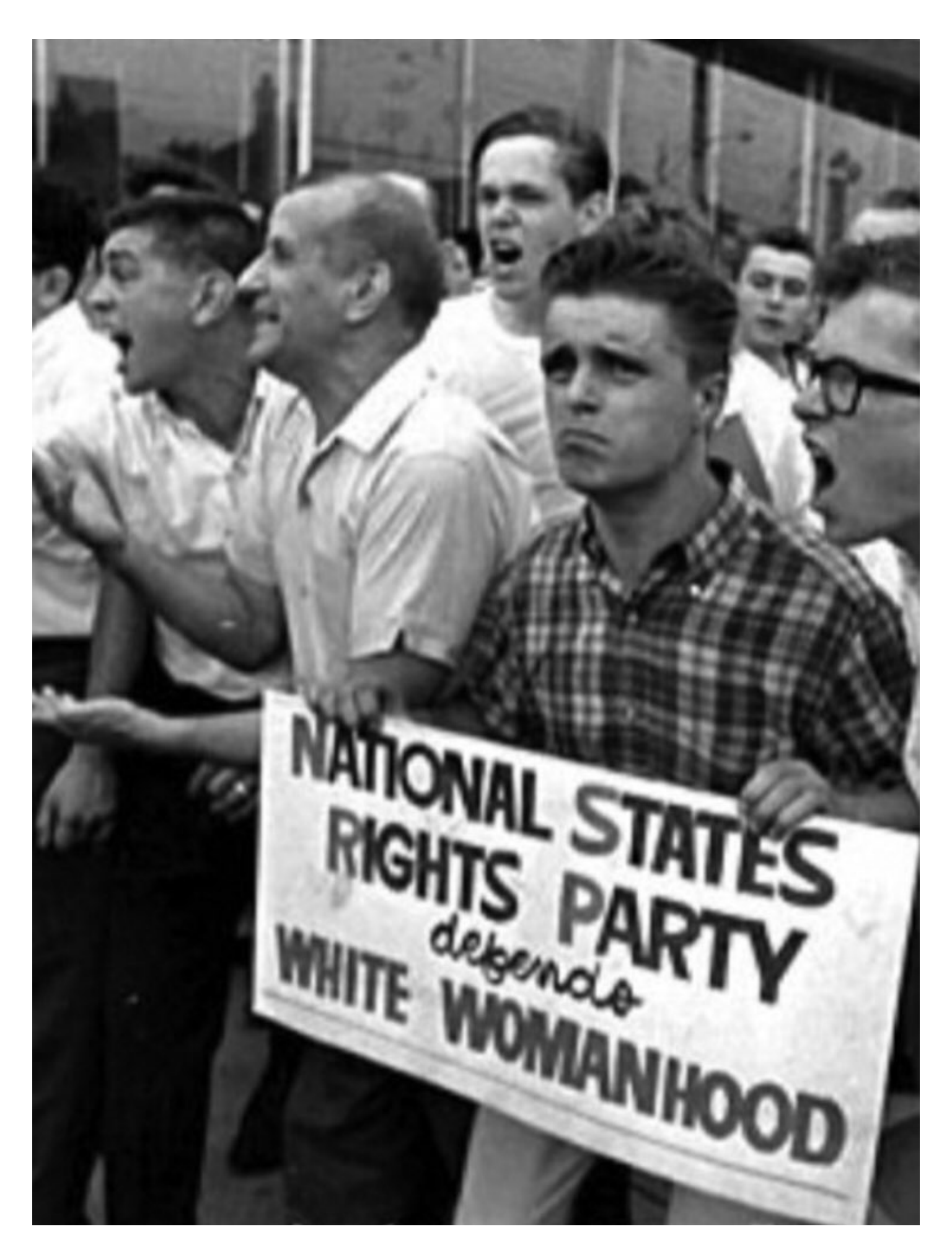
Even with all the evidence we have, daily White violence is invisibilised in the press, in mass media, in our cultural narratives.