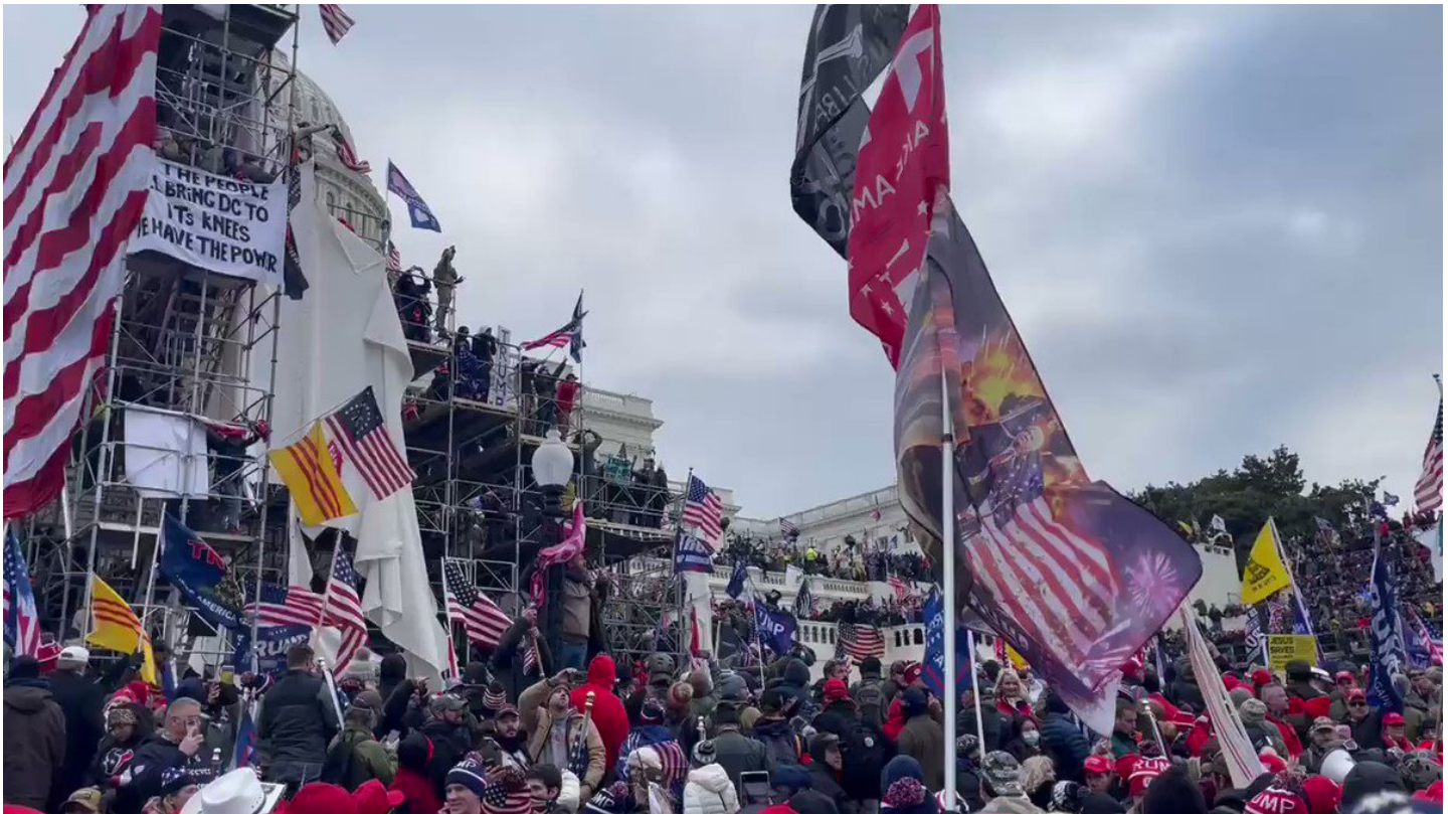
3:29pm: Waldo makes an appearance during a rendition of the National Anthem. Not seeing much in the way of traditional patriotic gestures of respect for that song in this crowd, though