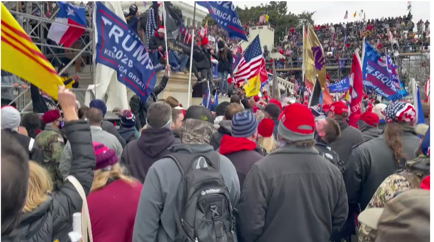
3:41pm: trying to walk far enough away to get a bar or two of signal strength so I can reach my editors. Had to keep walking a lot further than this, though