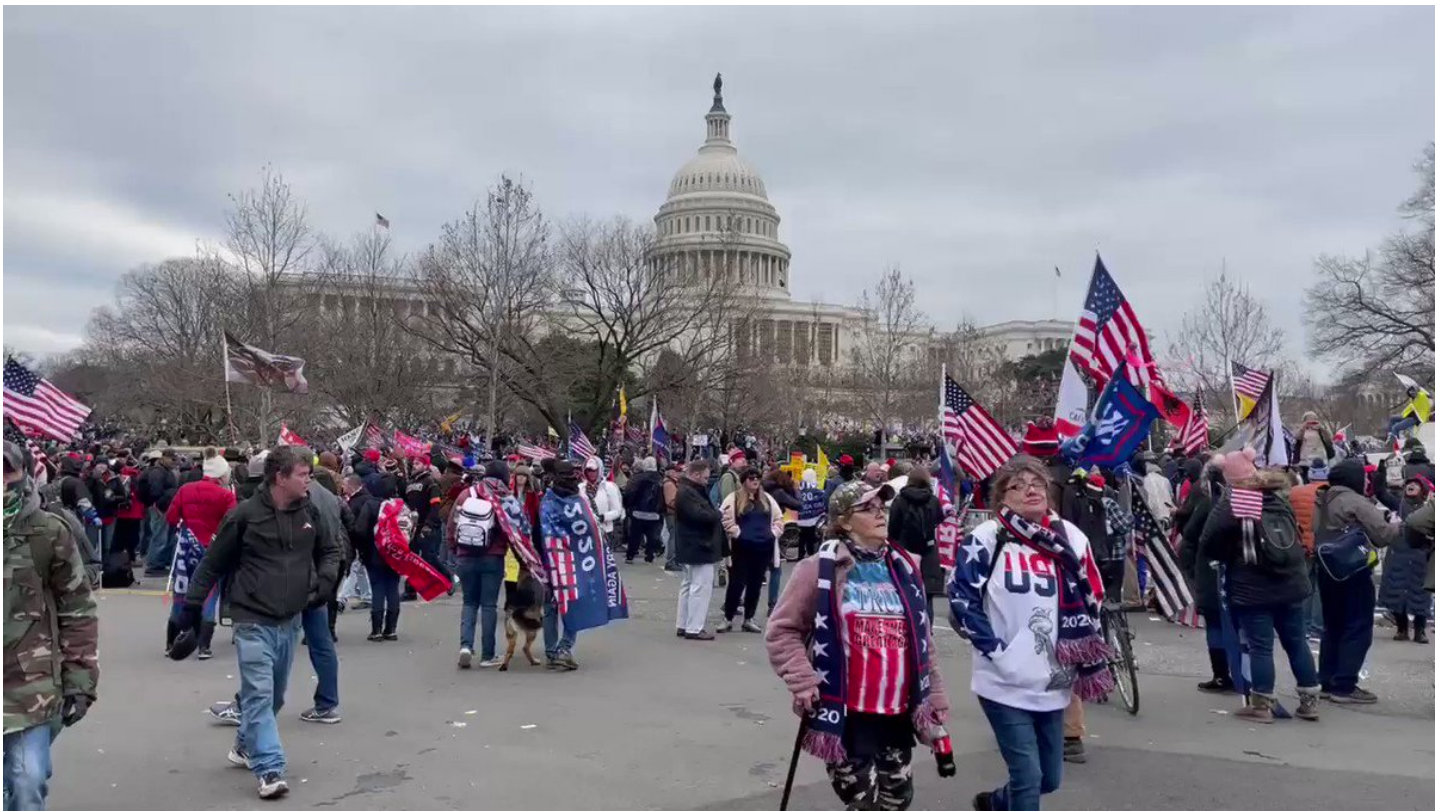
3:13pm: More street preachers. The guy wearing the Navy P-3 squadron hat caught my eye