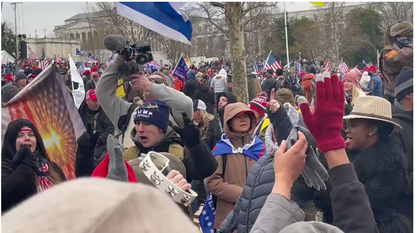
3:21pm: 'Amazing Grace' doesn't get past the first verse though