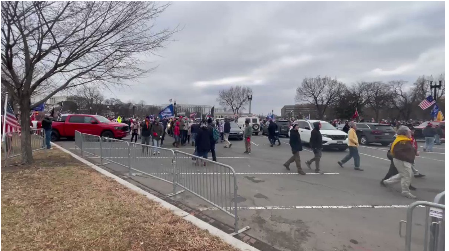
3:10pm: Trump supporter: "I just love everything about it"