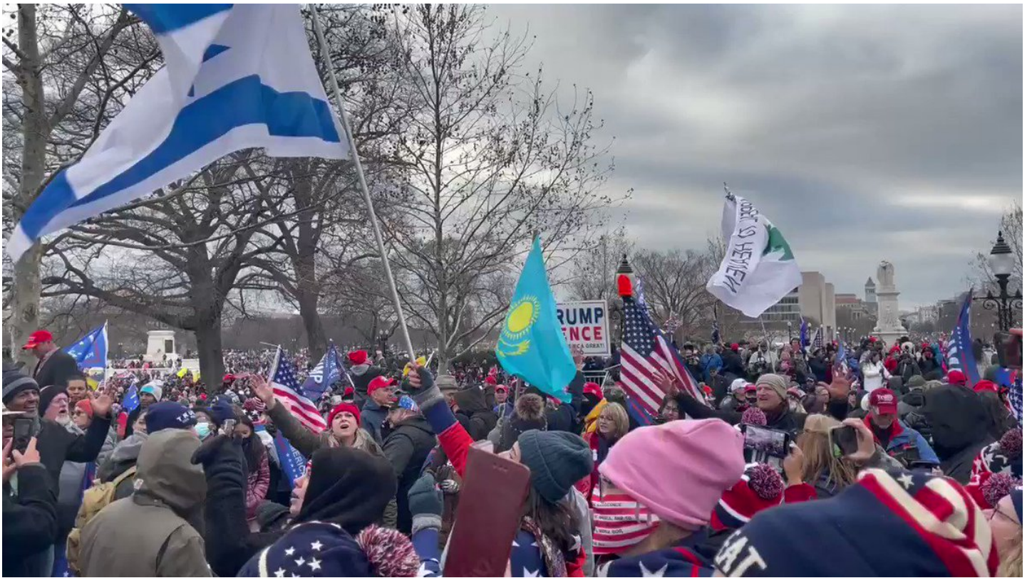
3:23pm: a 'Deus Vult' flag, popular with white supremacists and the anti-Muslim 'Crusader' movement, flying on federal land