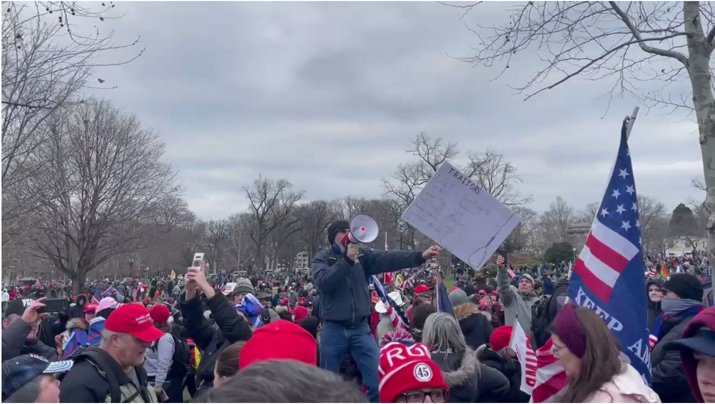
It's worth taking a look at who this man believes to be traitors: