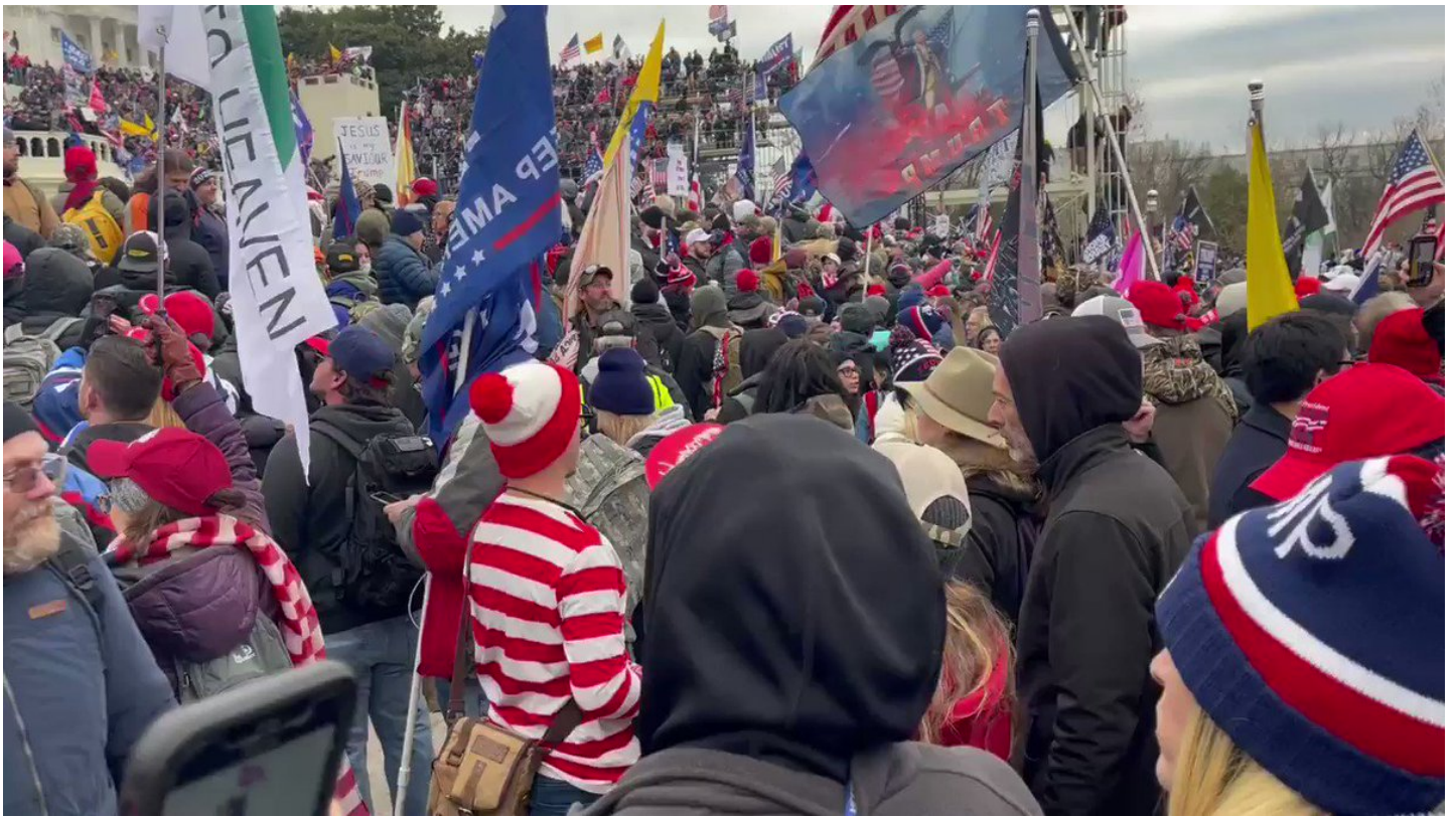
3:31pm: some @TwistedSisterNY fans in the crowd seem to only remember the refrain to 'We're Not Gonna Take It'