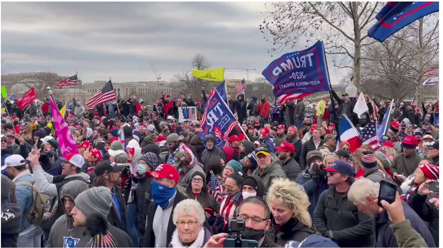
3:37pm: chanting 'we love Trump, we love Trump'