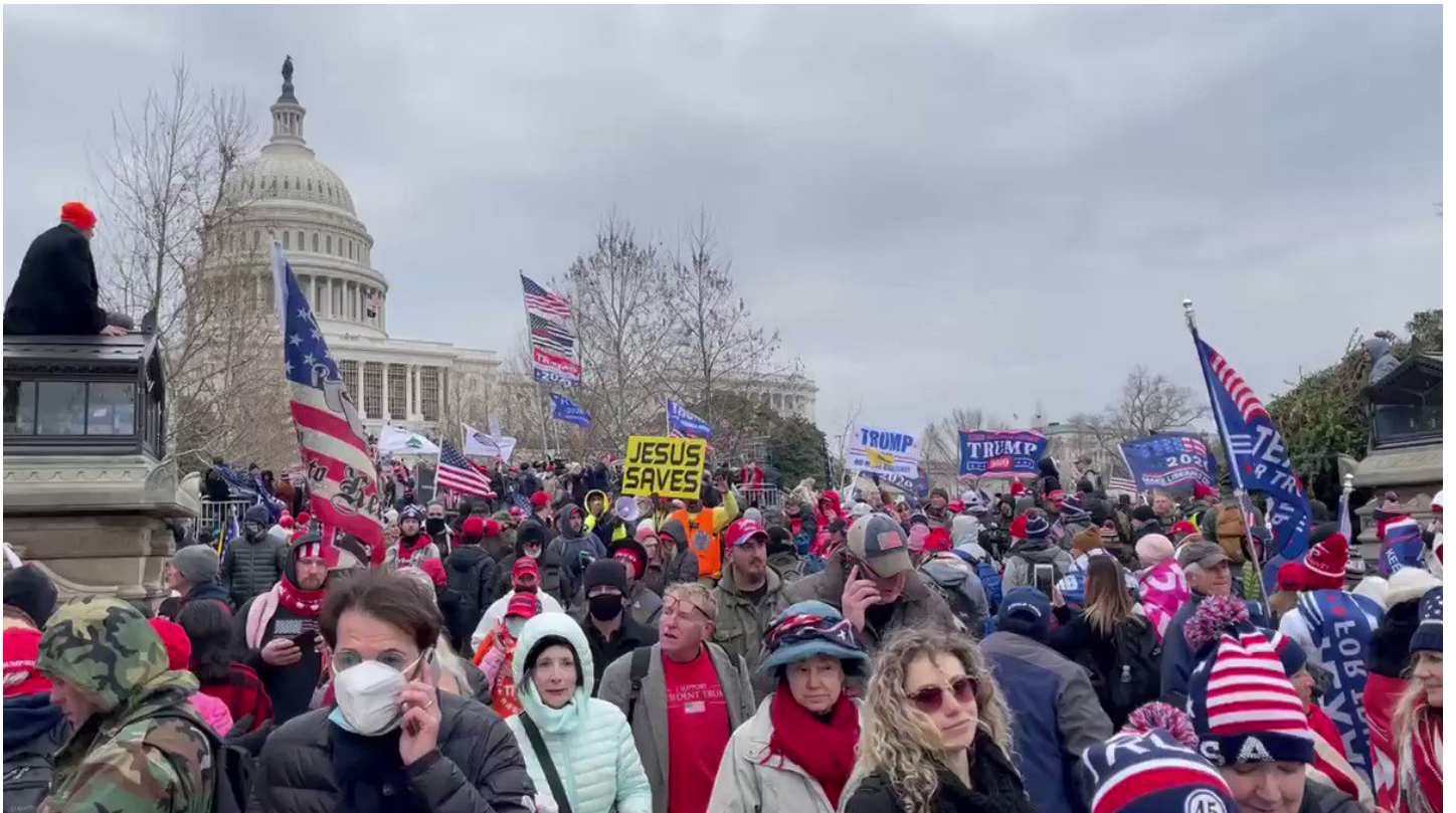
3:14pm: "God is God. All the time"