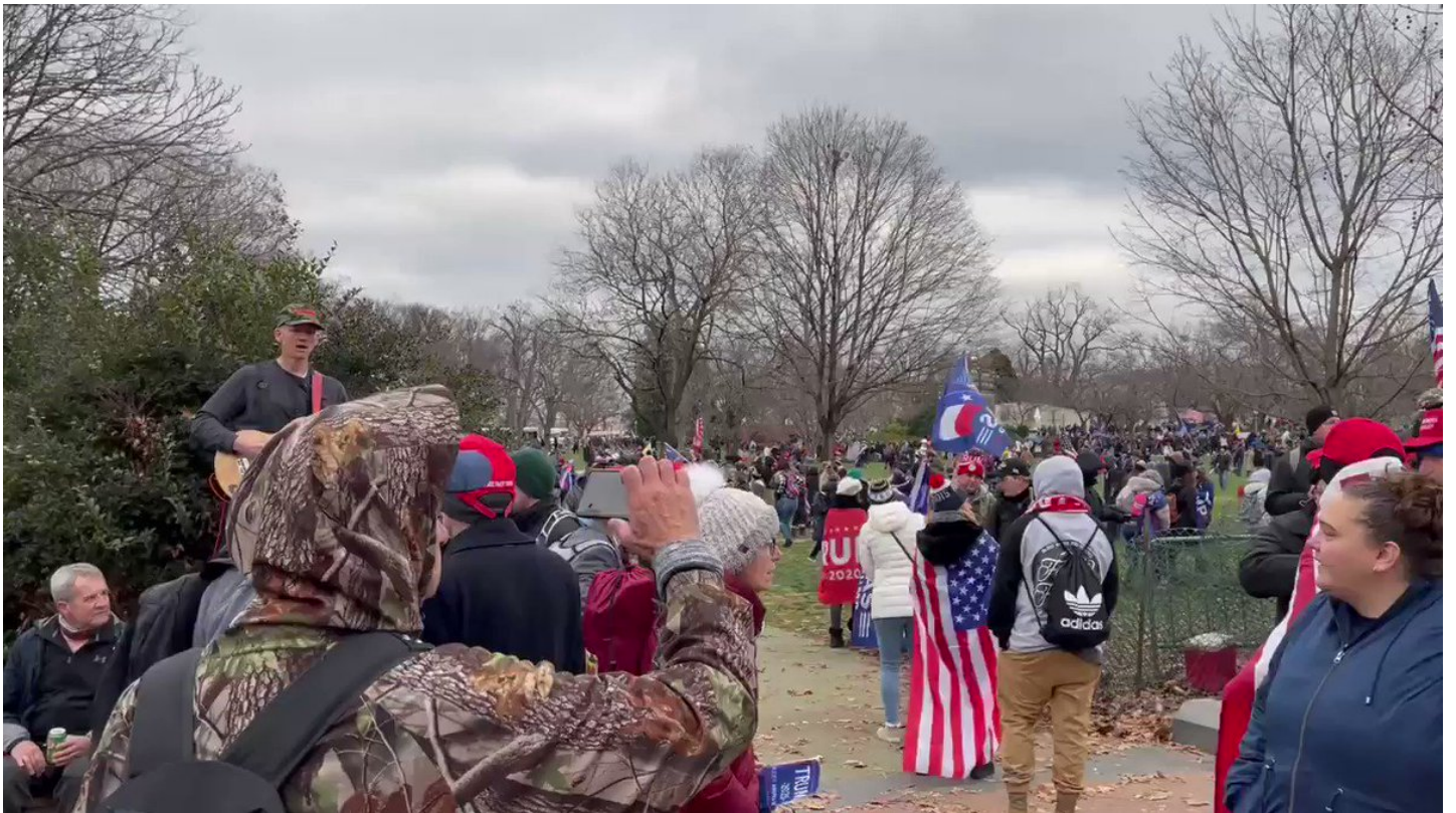
3:17pm: Word spreads through the crowd that members of Congress have evacuated. Man here implores followers to remind law enforcement officers that they have sworn an oath to the Constution