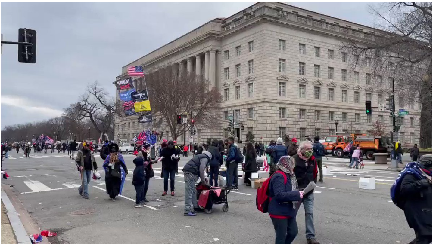
2:20pm: these were just some of the many, many people flying South Vietnamese flags on the way to the Capitol. Led by a Trump impersonator