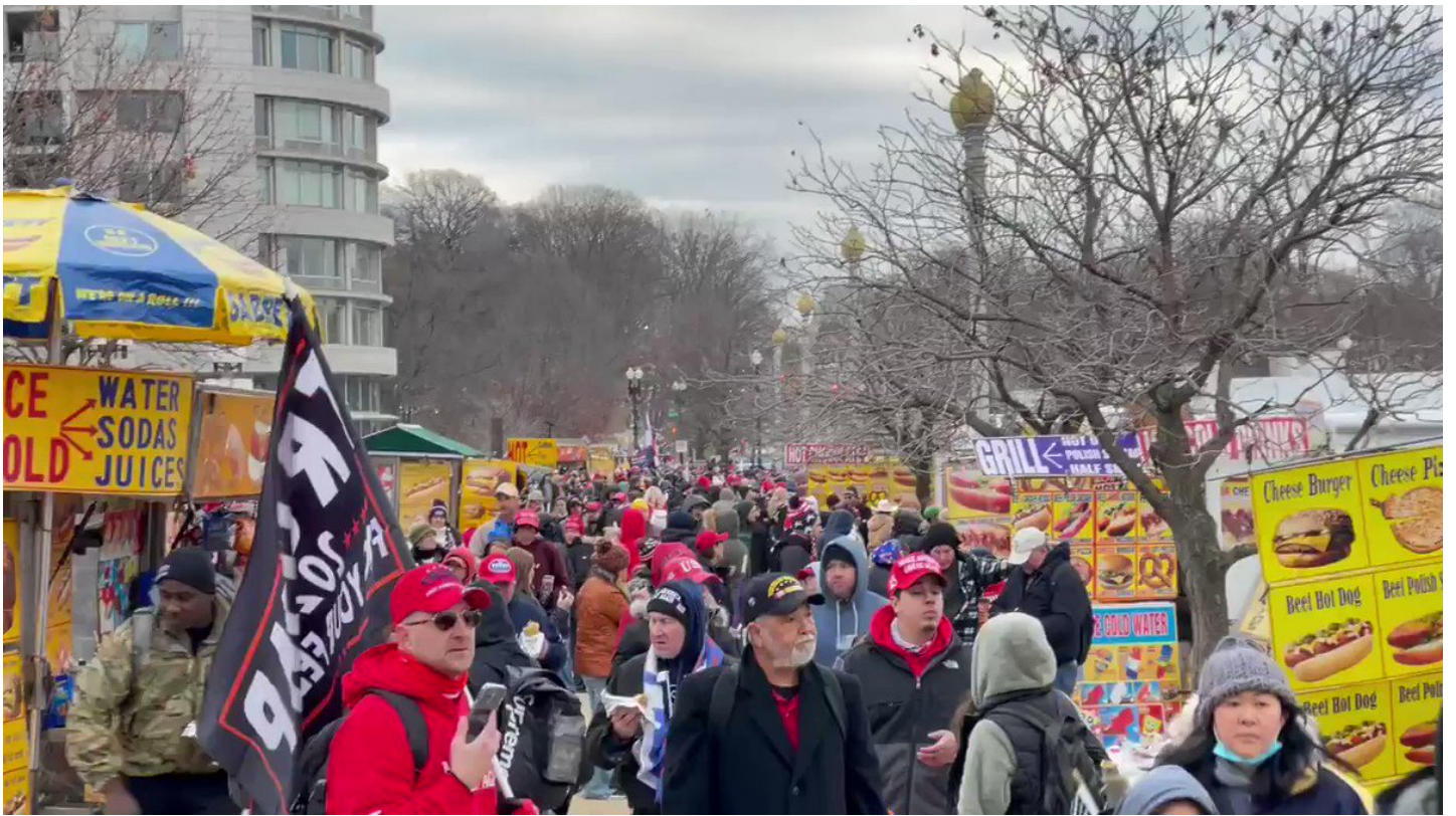
4:11pm: still big crowds of Trump supporters at the Capitol. Curfew went into effect less than two hours later