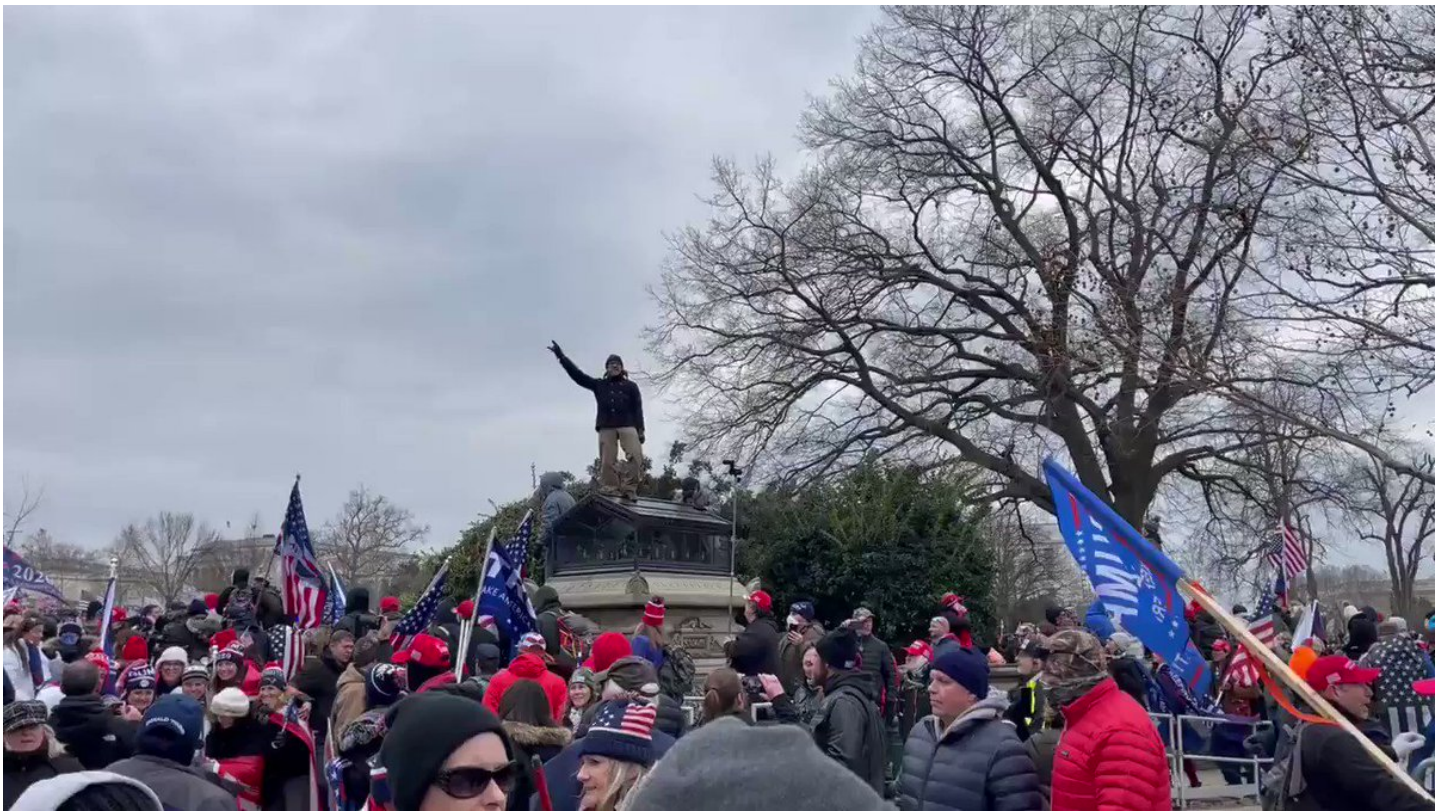
3:14pm: Man in a camo MAGA hat is doing his best with @Metallica's 'Don't Tread On Me'