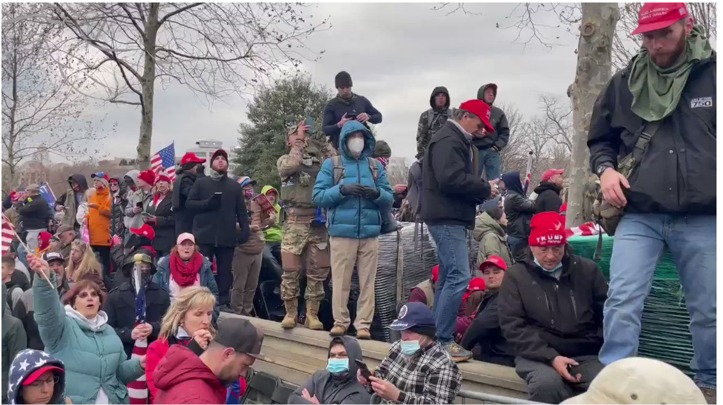
3:26pm: Pushing further into the crowd. The conversation just off-camera towards the end of this shot is interesting