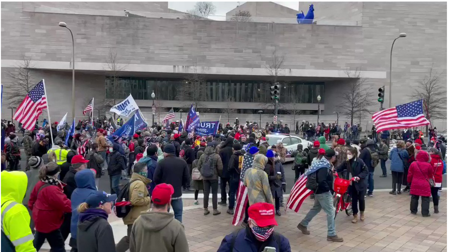
2:48pm: Trump supporters cheer as the police car drives away. Then, they continue back towards the Capitol chanting 'U-S-A, U-S-A'