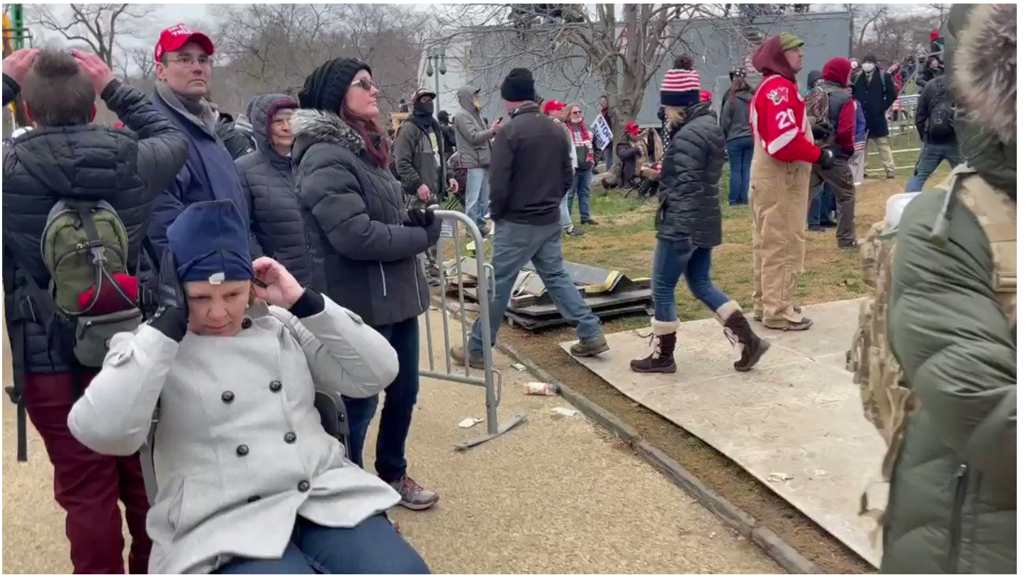
4:02pm: lots of ambulances on the west side of the Capitol as Trump supporters start to trickle away