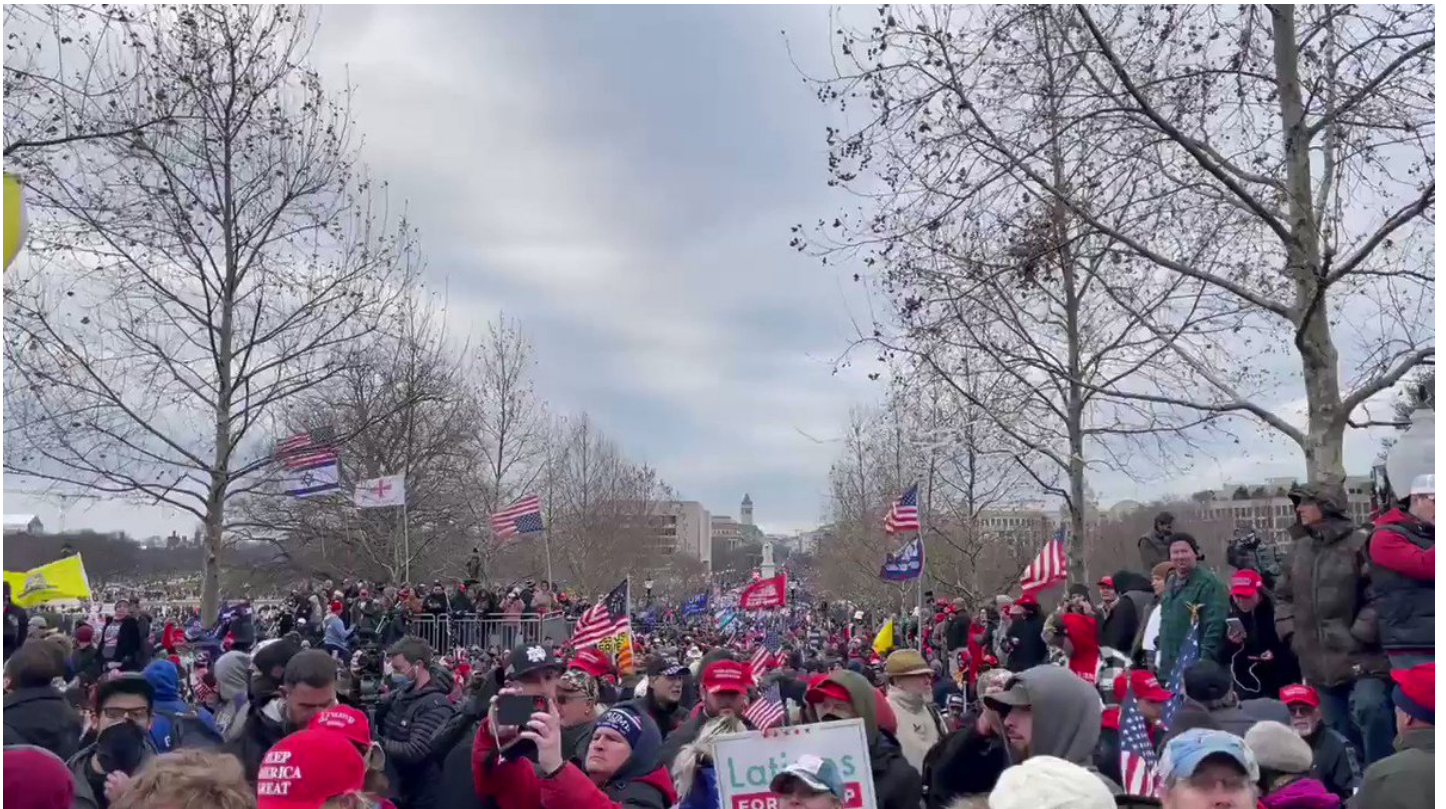
3:35pm: Chanting 'fight for Trump, fight for Trump'