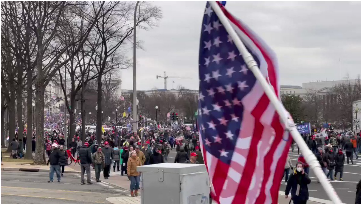
2:53pm: the crowd is thickening the closer it gets to the Capitol. A man with a megaphone chants '1776'