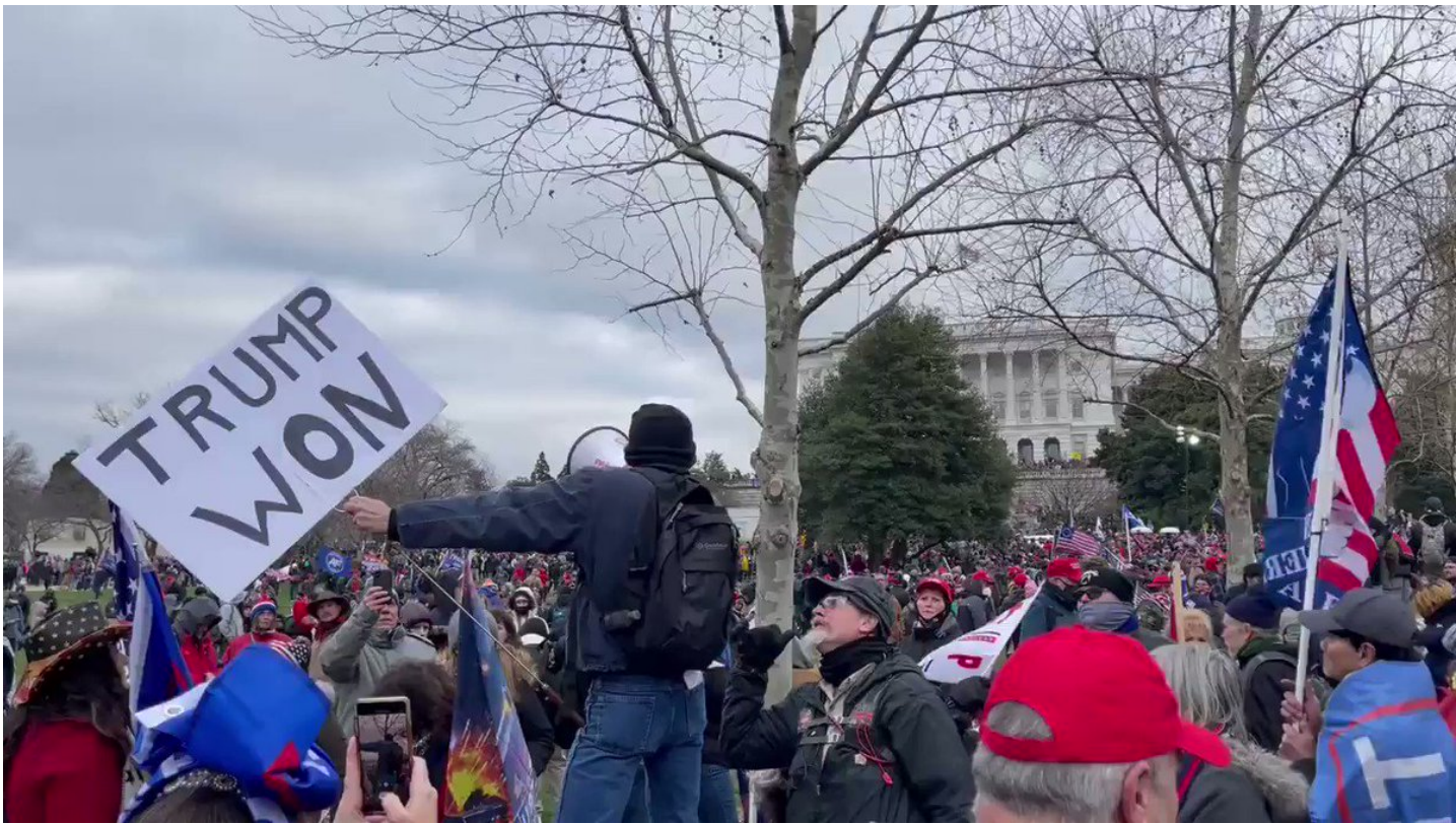
3:19pm: Trump supporters cheer when told that the Georgia statehouse has fallen. Man says 'I'm just relaying the news. I don't know if it's accurate'