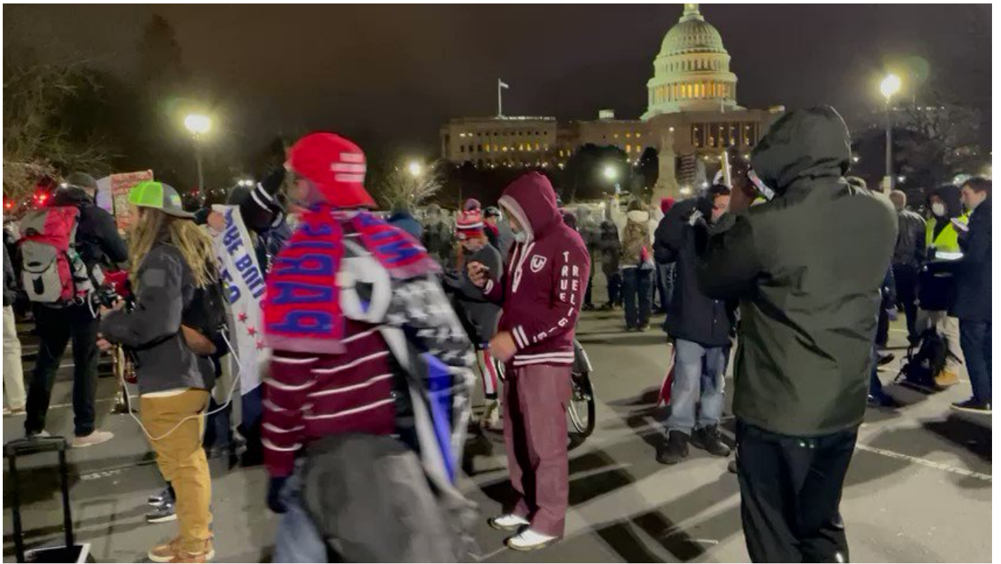
7:19pm: Cops move in. For Team MAGA, this is when 'Back the Blue' turns to shouts of 'fuck the police' and death threats