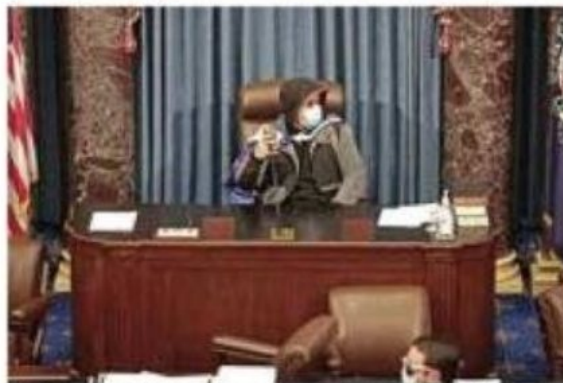
Clockwise from top, rioters climb a wall of the Capitol on Wednesday; a man occupies a seat in the Senate chamber after intruders stormed the room, interrupting a joint session of Congress to ratify President-elect Joe Biden's win; and police officers pull their guns as intruders break into the House chamber.