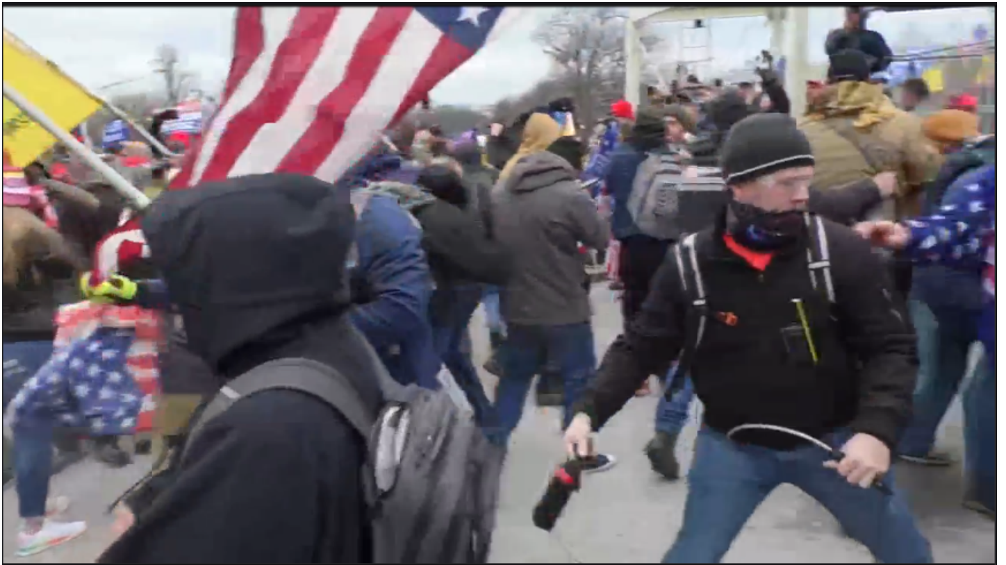
20/ The air's a little foggy with pepper spray and pepper balls being launched at the crowd.

"You work for us!" the crowd screams at the police.