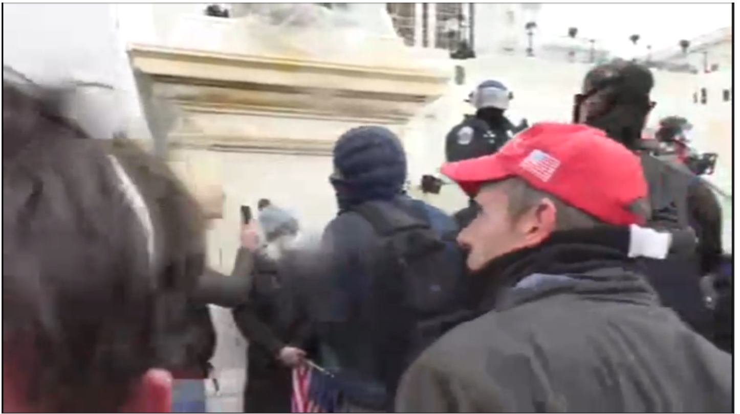
31/ "You're a dick, you fucking pussies," this man in the red MAGA hat screams at the cops, which is..... interesting.