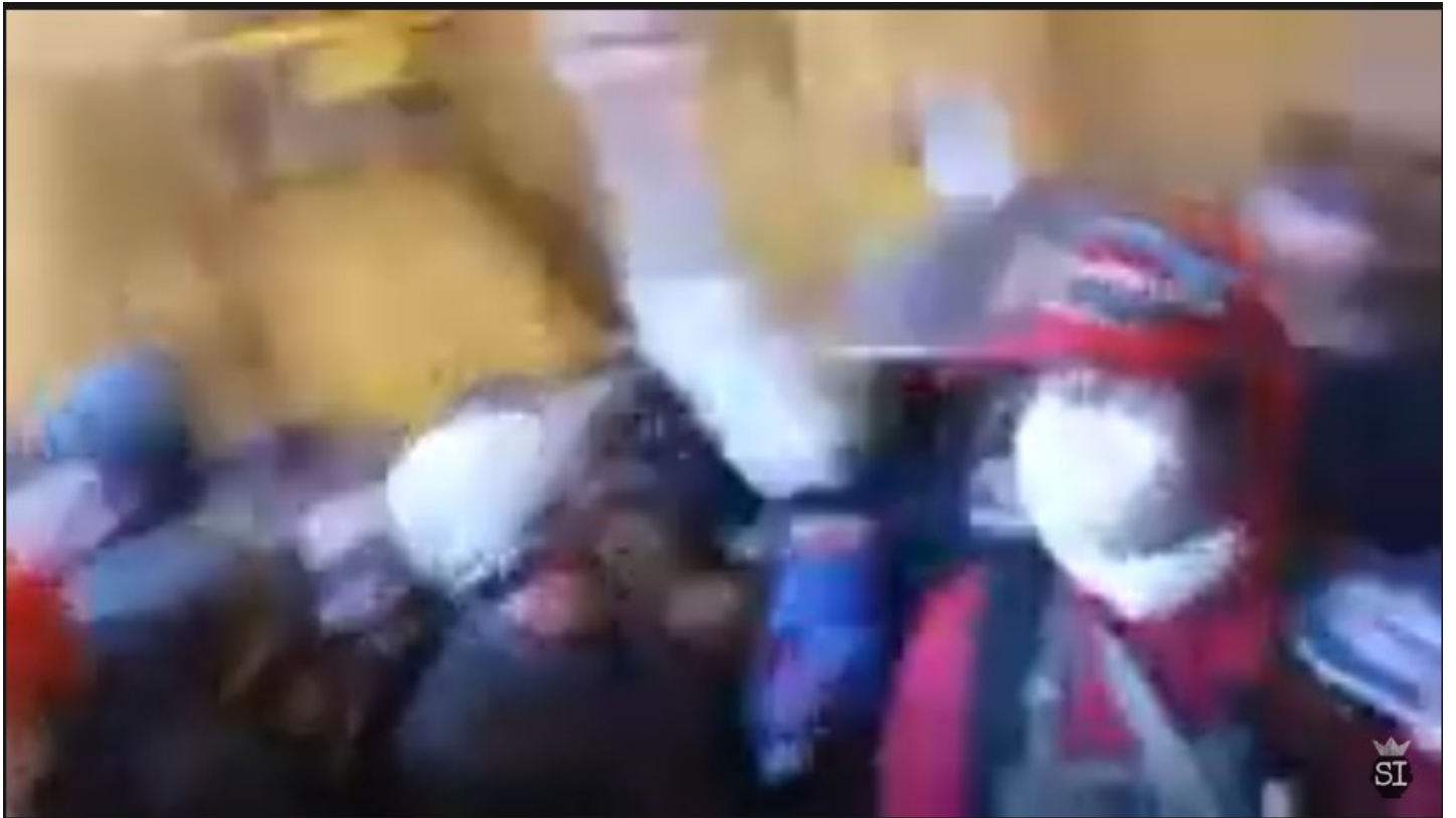
44/ Reports of live rounds being shot inside the Capitol Building. Masses of Stop the Steal ralliers are just leaving. A cop is even holding the door for them.