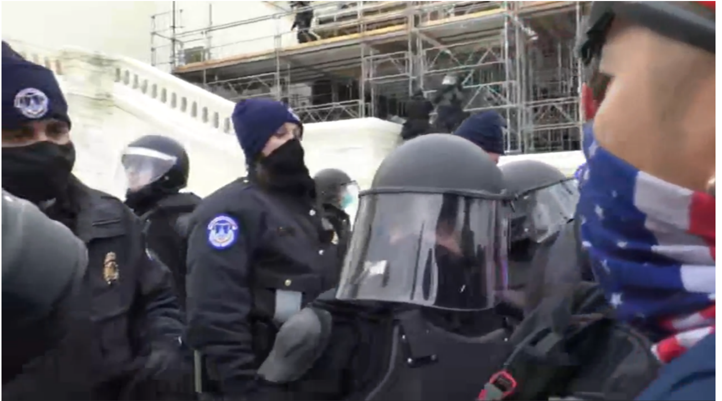
19/ Police are deploying pepper spray and the crowd is pepper-spraying them back.