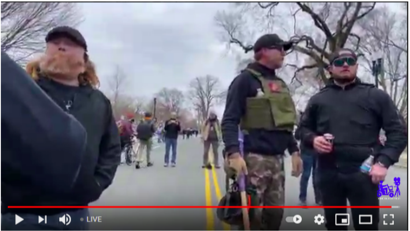
13/ That's Proud Boys founder Gavin McInnes in the black baseball hat, classes, and plate carrier.