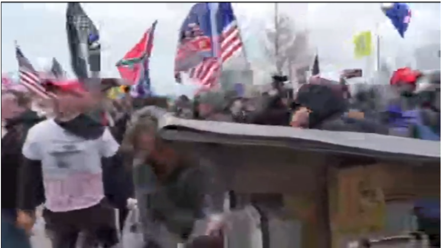
32/ Yellow Gadsden flags representative of the militia movement are flying alongside at least one Confederate flag (not pictured).