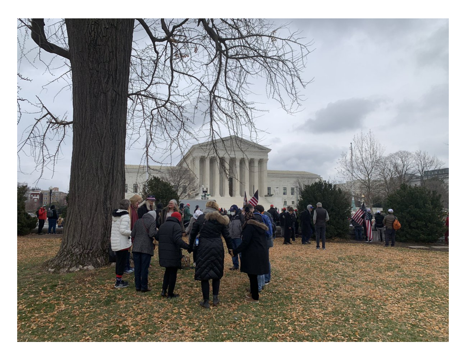
At the Capitol now, where people with flags are dancing to the theme from the conservative Christian movie "God's Not Dead" as people blow shofars.