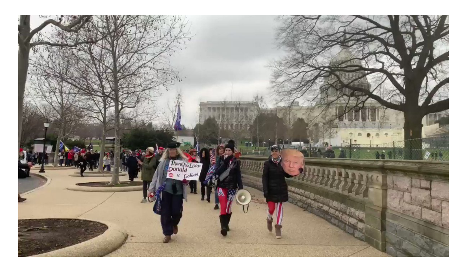
Spoke to the shofar-blowers at the top of this thread.

They are absolutely here as part of the protest. And they are very, very interested in cannabis, which is part of their faith: the Healing Church of Rhode Island.