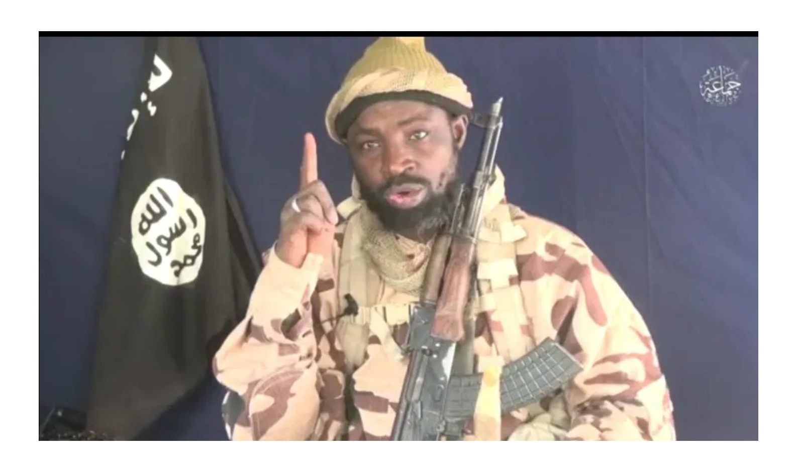
Abu Bakr Al-Baghdadi - Alcohol

very high energy, much bigger than anyone ever thought it'd be, for when the original is too elitist for you, speaking in tongues is just part of the deal