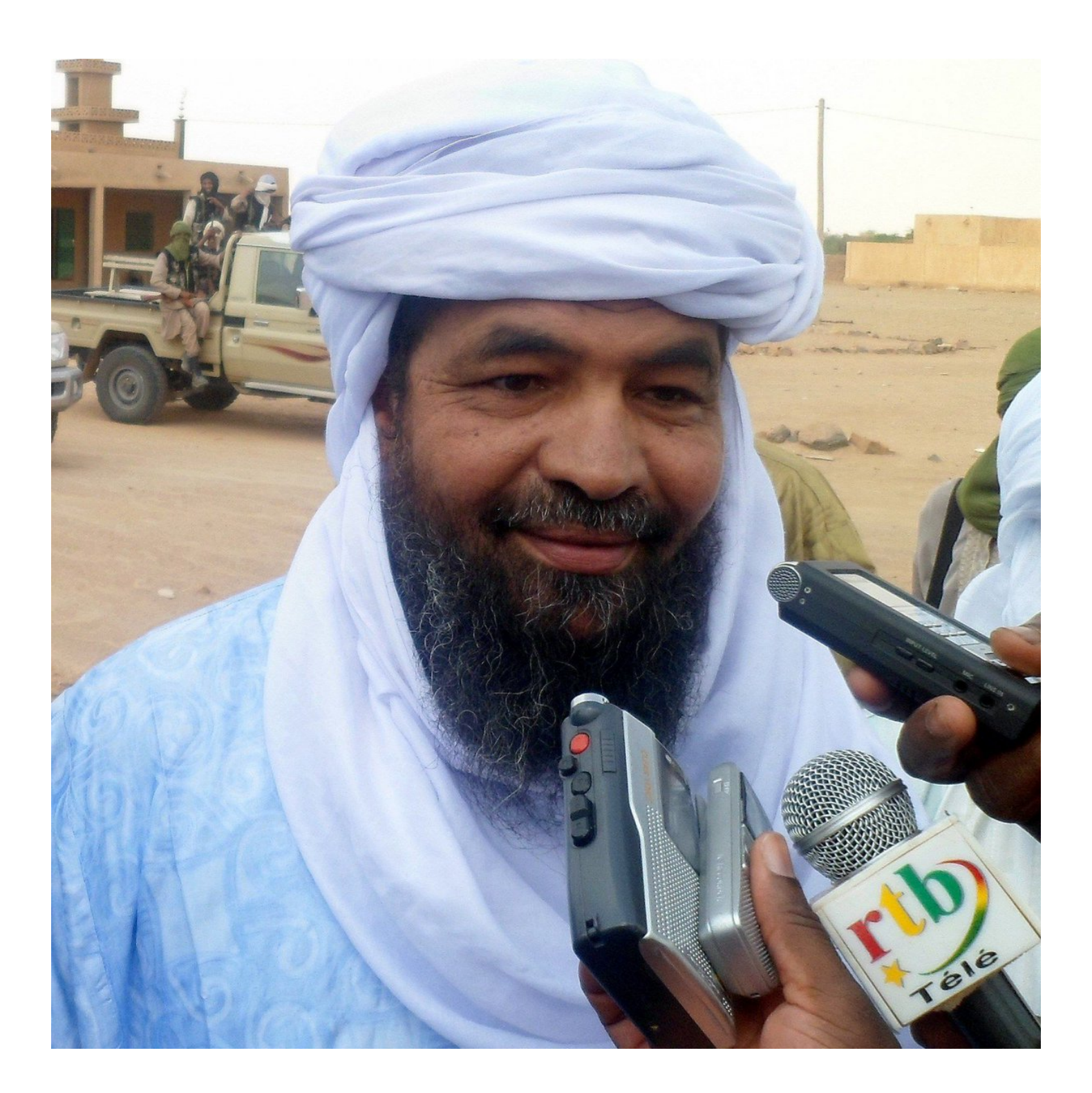
Abdelmalek Droukdel - Magic Mushrooms

used to be really cool, was in a band once, great at parties, good intentions, comes in nice friendly packaging, one lick and now you're standing in your living room holding a bloody knife staring at the corpse of your gf and there's spiders under your skin