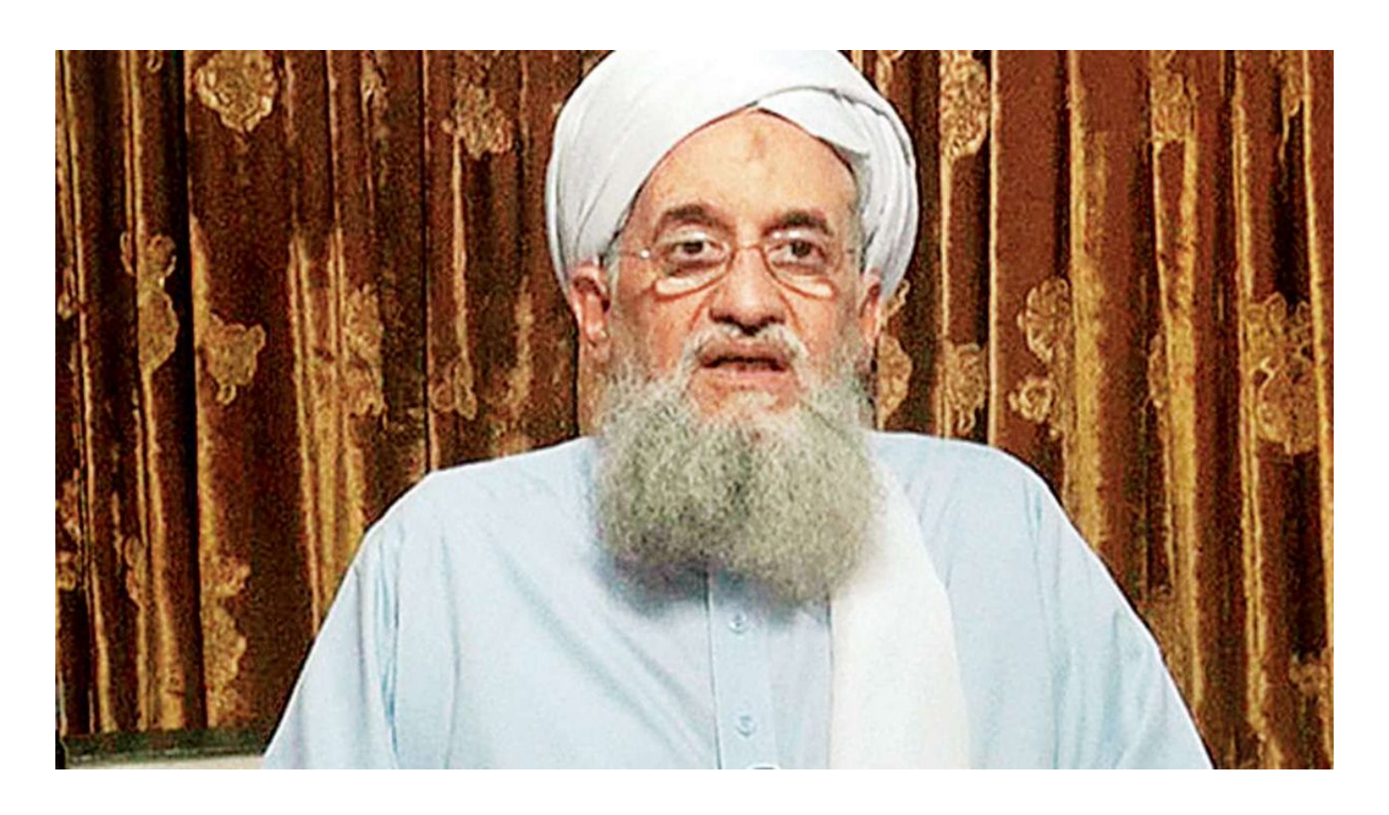
Abubakar Shekau - Crack

very high energy, much bigger than anyone ever thought it'd be, for when the original is too elitist for you, speaking in tongues is just part of the deal