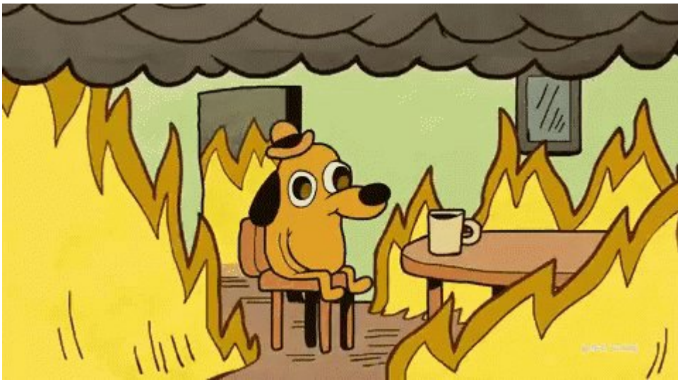
Its great offer of performance art.