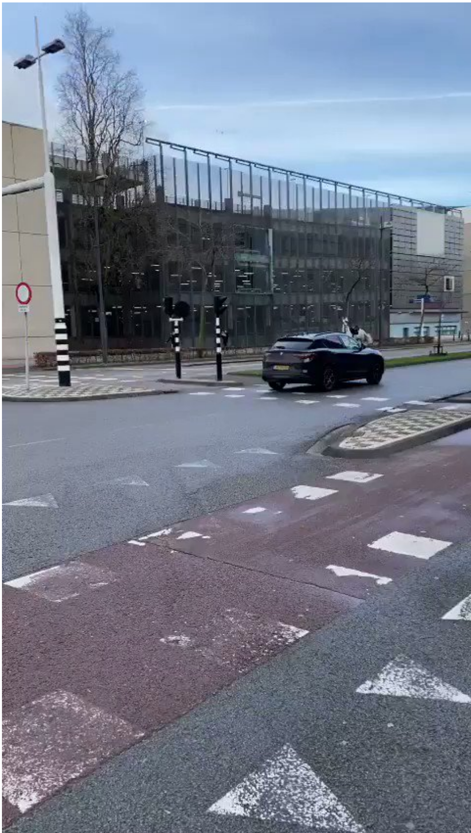
Its VOC mentality.