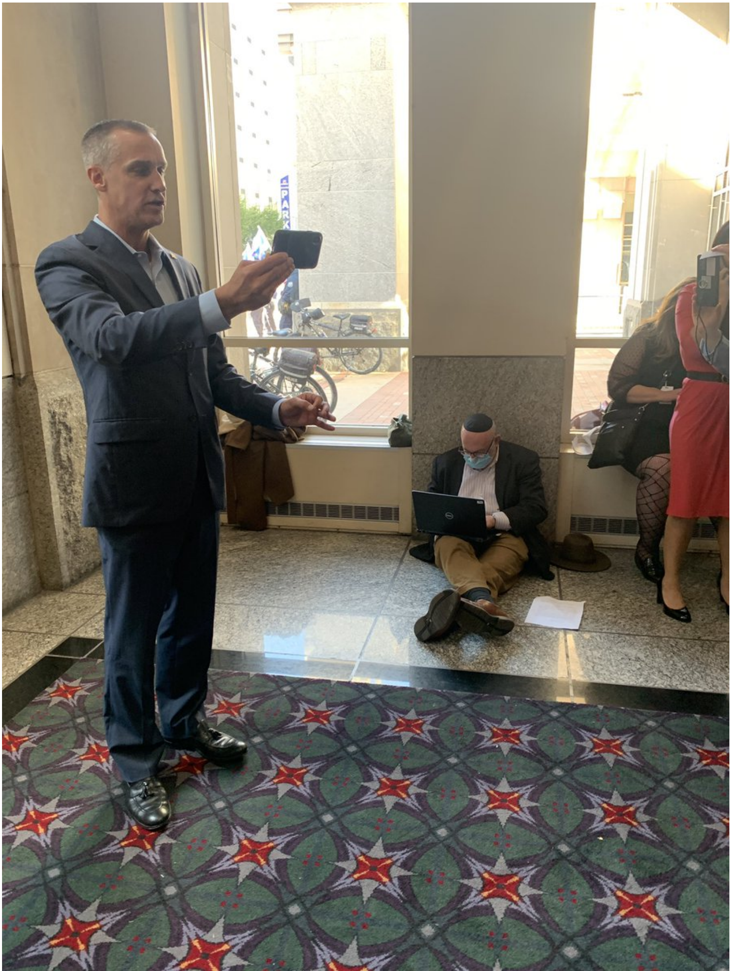
I was then told to report to the main operations center for the Trump / RNC legal team in an undisclosed location in an outlying area of Philadelphia - after I got someone to disclose it to me, which took an hour. >