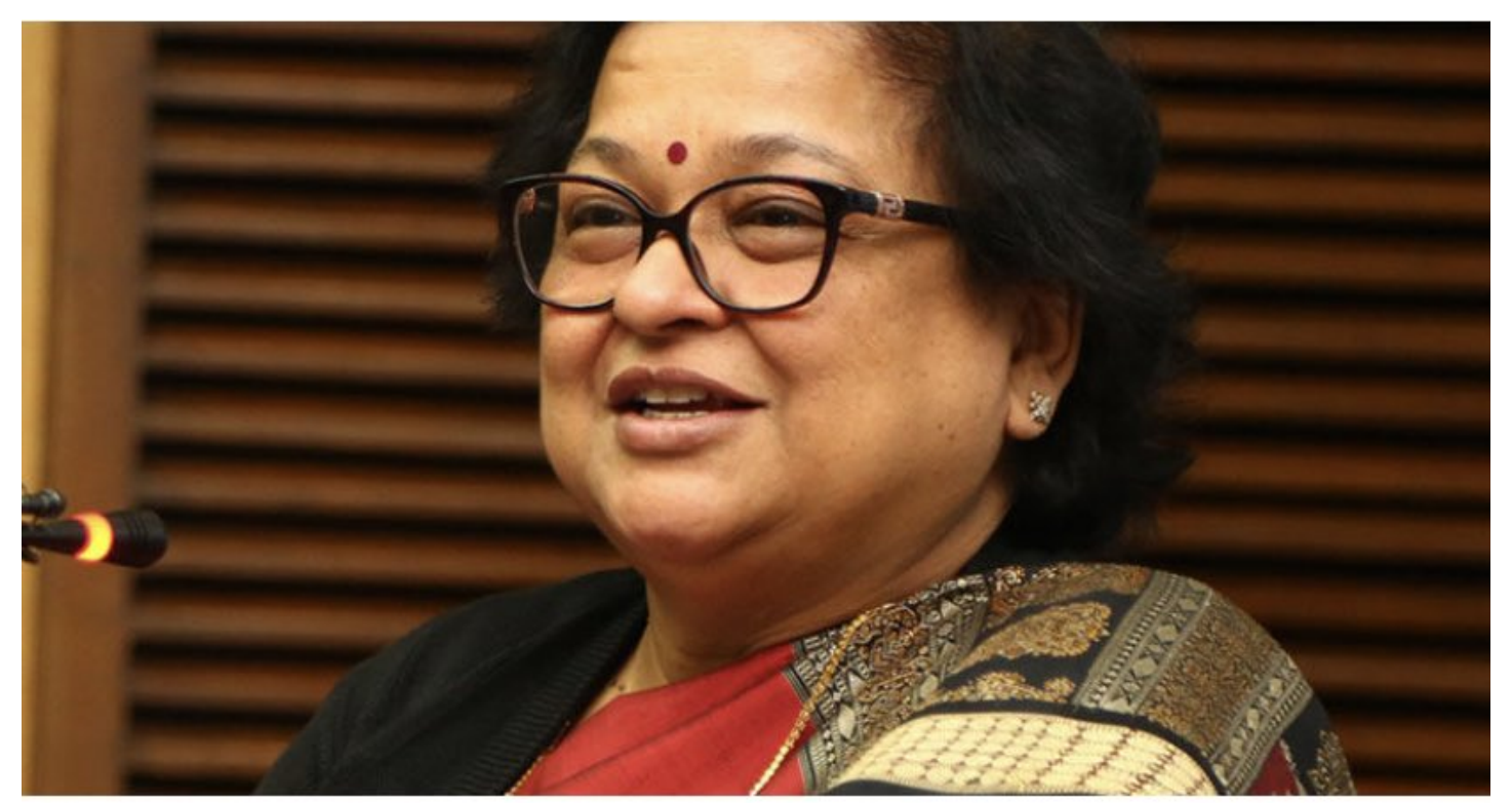
The Full Court has assembled.