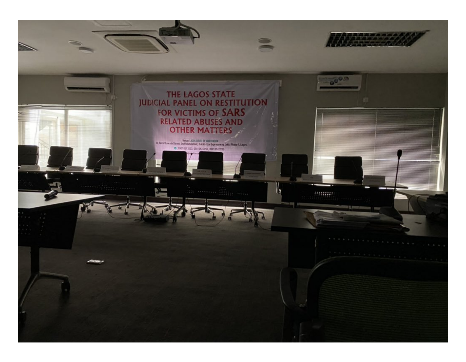
10:51 This is all of us waiting for the bag to come out