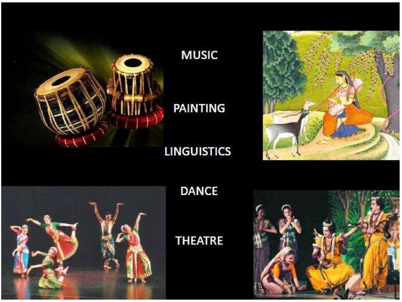
INTRO.. ON #CHATUSHASHTIKALA

Have you ever heard of #Chatuhshashtikala - the Great Indian Arts & Skills & their meanings ? +