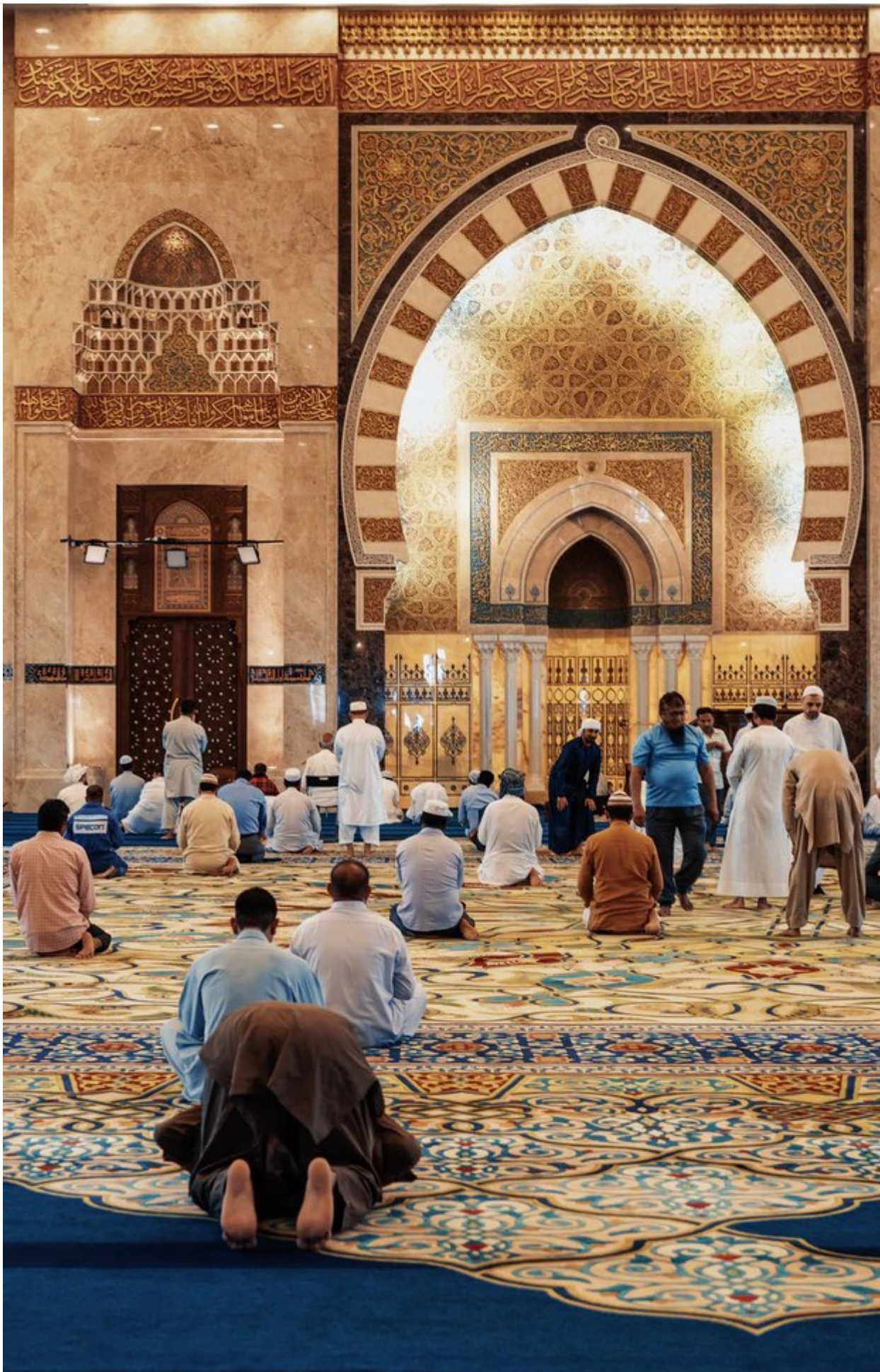
this means affirming the names and attributes of Allah and believing that there is none like unto Allah in His names and attributes.