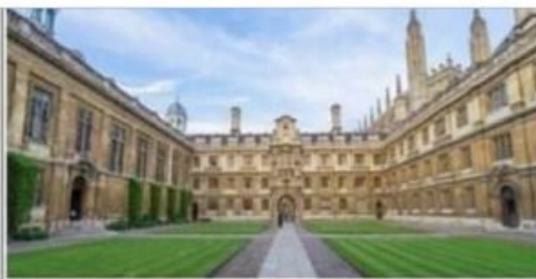
University of Cambridge (1209)