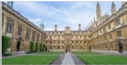
University of Cambridge (1209)