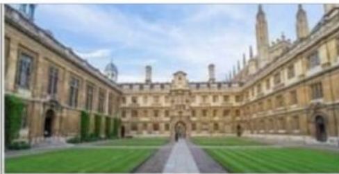
University of Cambridge (1209)