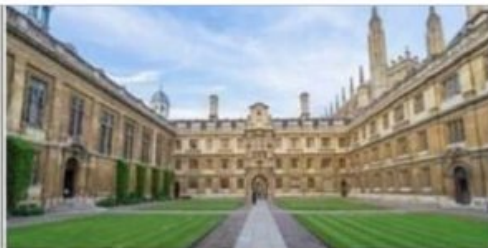
University of Cambridge (1209)