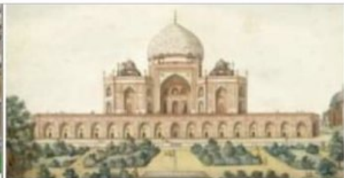
Humayun's Tomb 1570