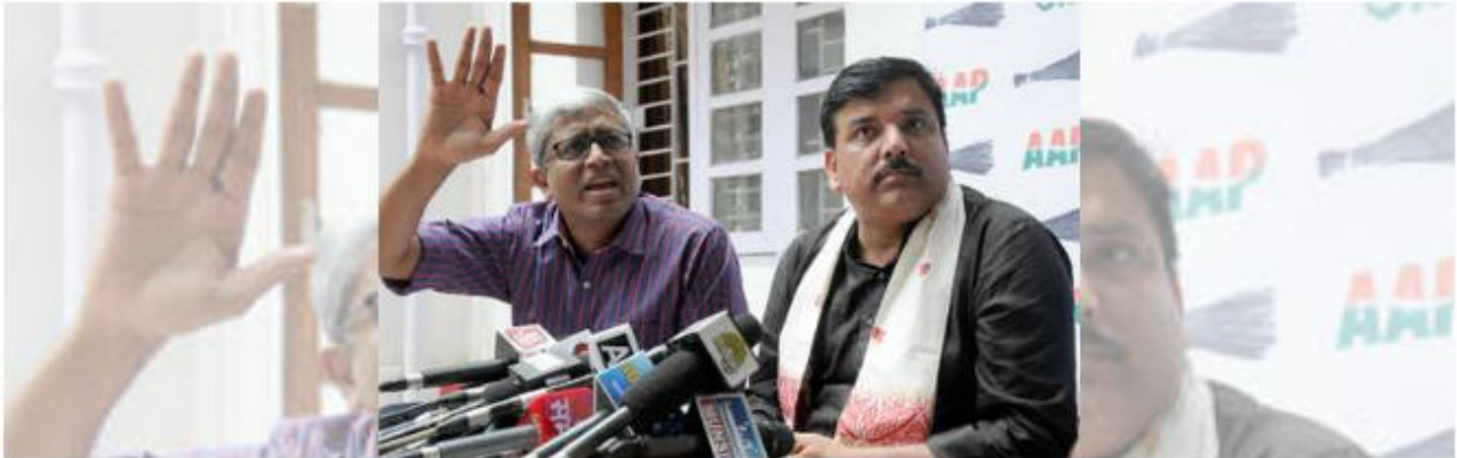
AAP leaders Ashutosh and Sanjay Singh.