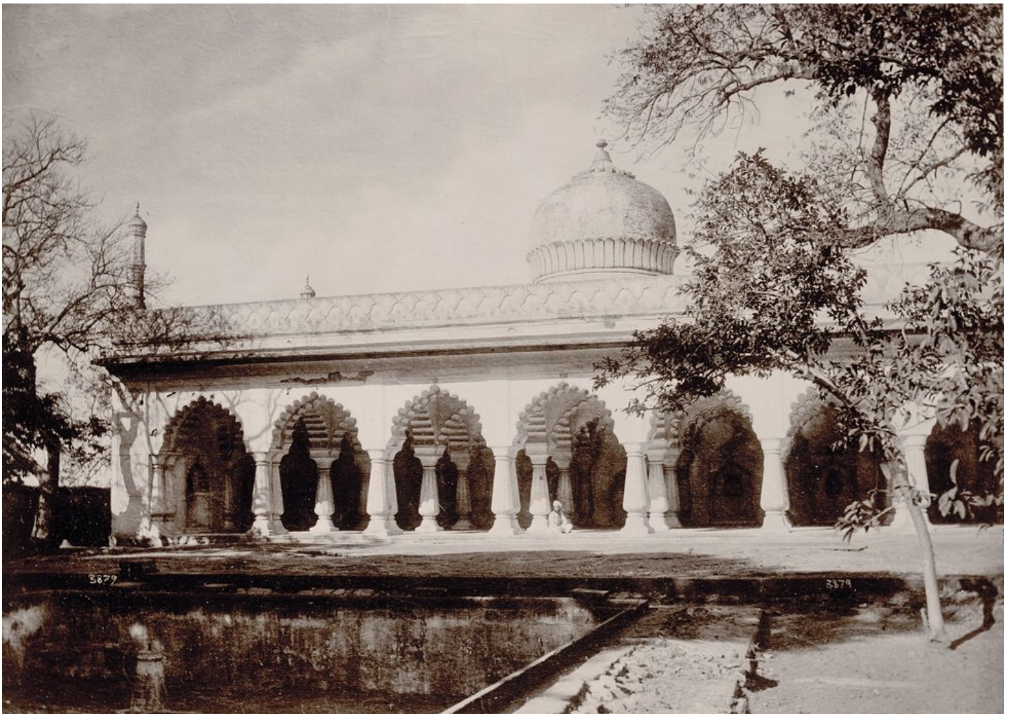
Bashir Bagh Palace, Hyderabad & its interior view, taken by Deen Dayal in the 1880s. The Palace was constructed by Asman Jah who was Prime Minister of Hyderabad from 1887 to 1894. The palace has since been dismantled, however the area is still known as Basheerbagh. 4/n