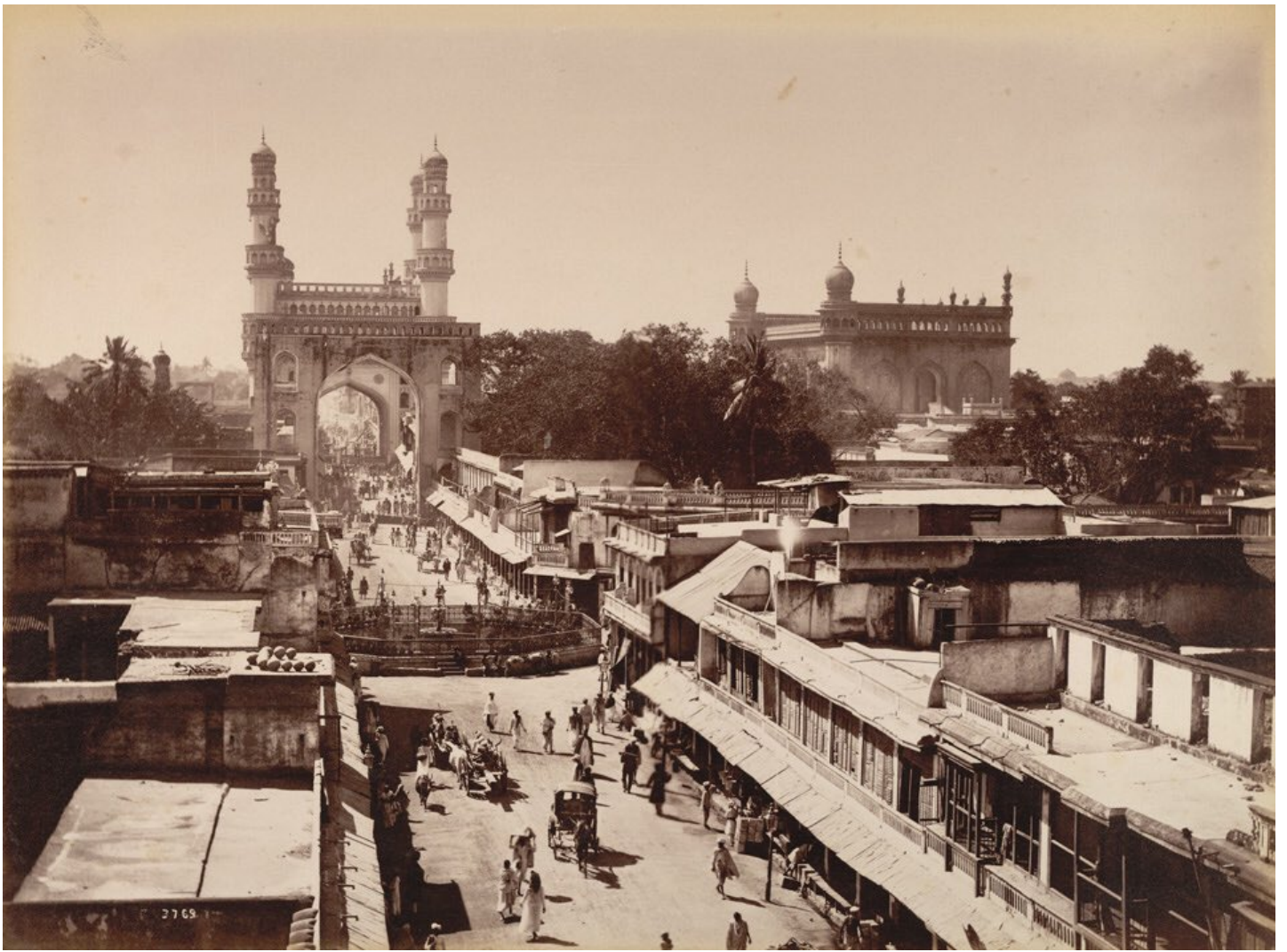
Muharram Procession - BiBi ka Alam. commemorating the martyrdom of Hussain during the Nizam's era. 9/n