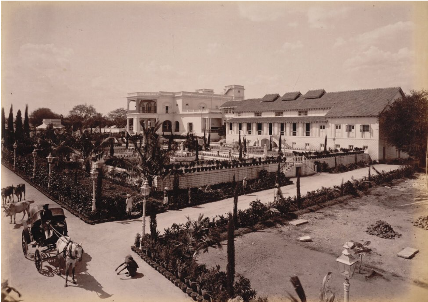
The Terrace of Jahnuma Palace. 5/n