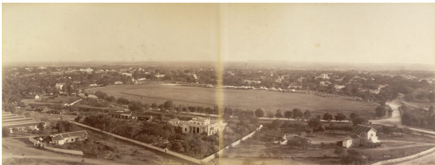
Golconda & Tombs view from Balahisar. 13/n