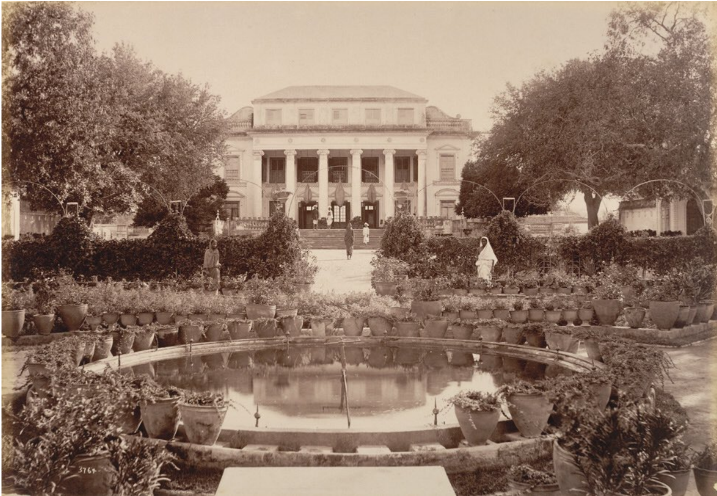
Falaknuma Palace - Now Taj Falaknuma Hotel (leased). 6/n