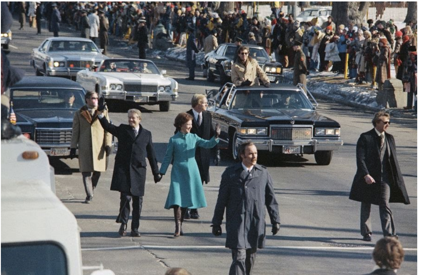
This Day, 1981: Jimmy Carter, crushed in a landslide by Ronald Reagan, escorts his successor to the Capitol. At that very moment, a parallel drama was playing out: the release of 52 American hostages from Iran - after 444 days in captivity