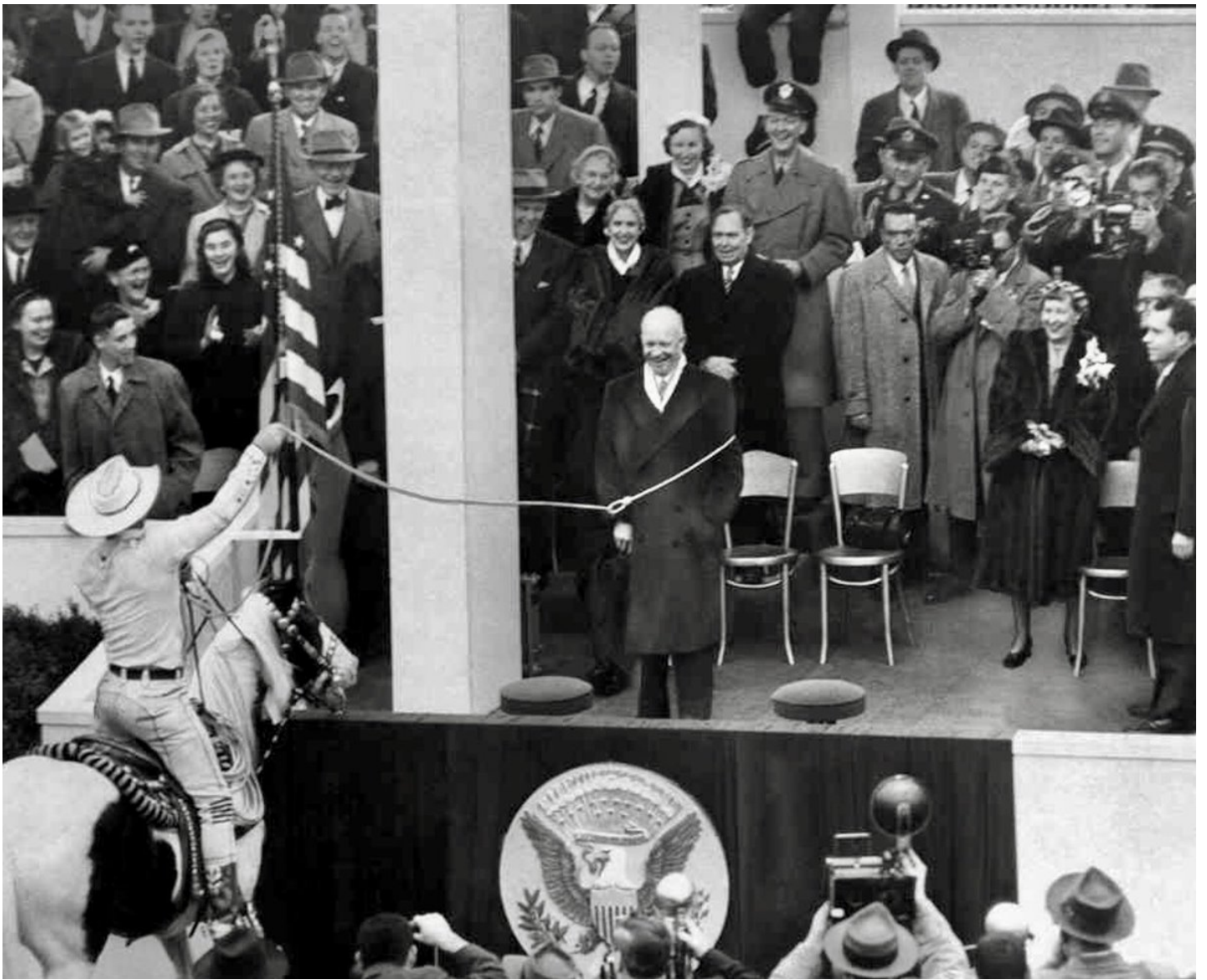
He was the youngest person ever elected - just 43 years old. John F. Kennedy, sworn in this day in 1961 (youngest POTUS ever, however: Theodore Roosevelt, 42, who took over for the assassinated William McKinley in 1901)