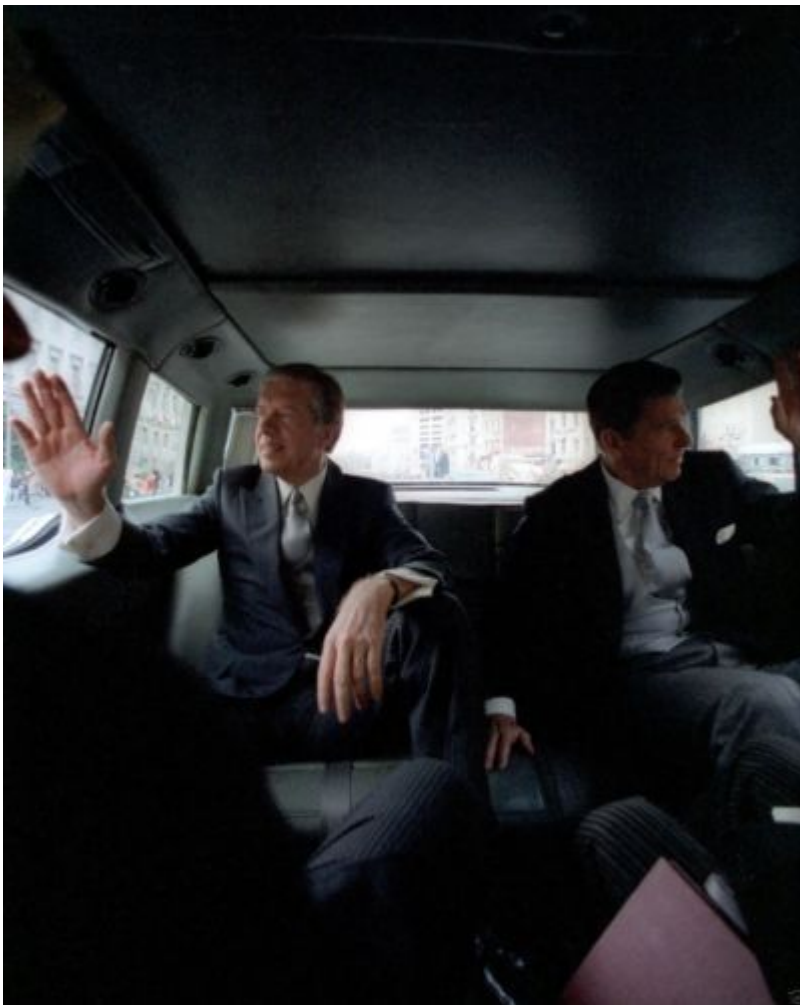
Just the fourth sitting VP to be elected to the presidency (can you name the others?), George H.W. Bush was sworn in this day in 1989. As his predecessor Ronald Reagan departed the Capitol that day, Bush said: "There goes a good man."