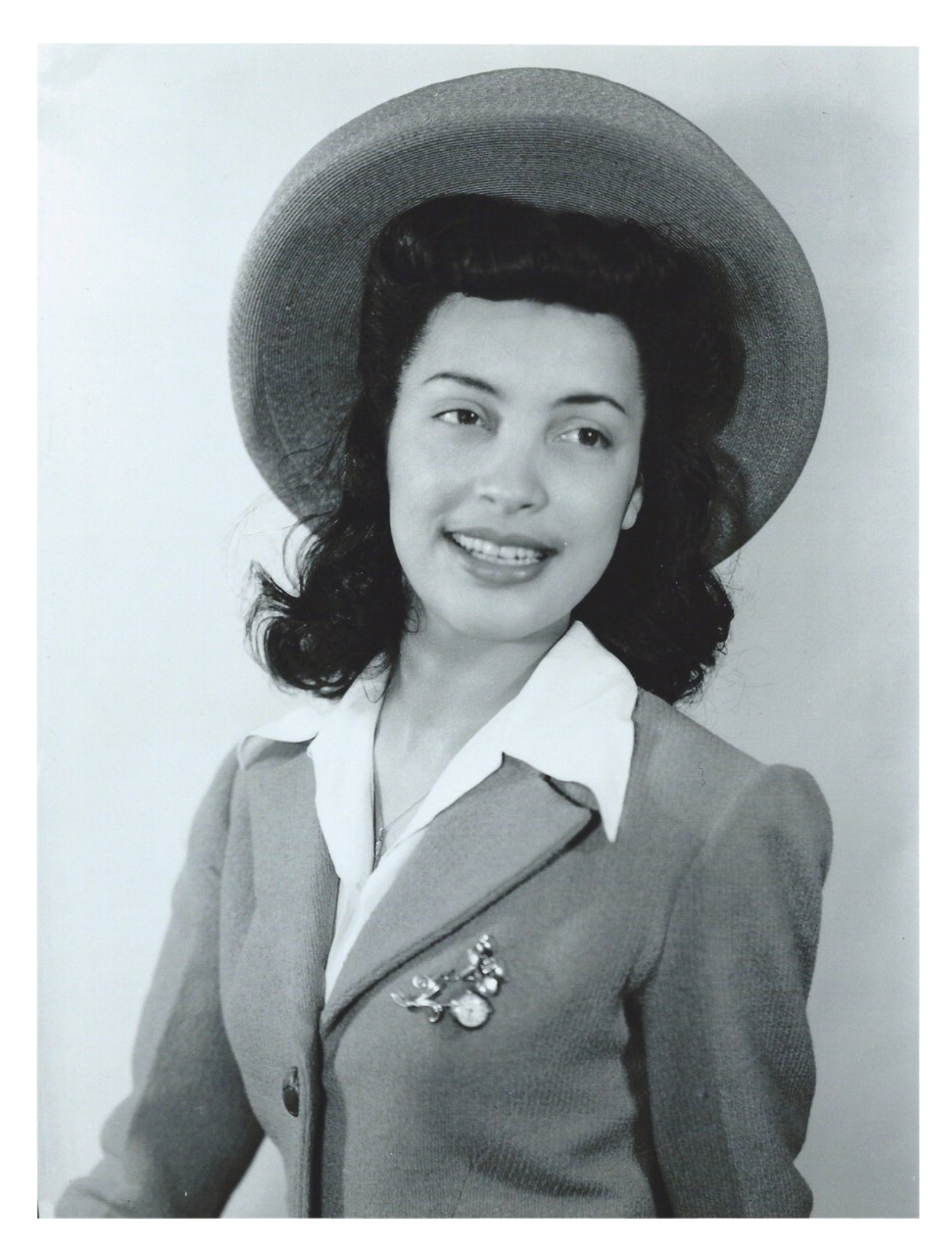
During WWII, Soskin worked as a clerk for Boilermakers Union A-36, a Jim Crow all-black union auxiliary where she assisted Black American workers who had to move frequently.