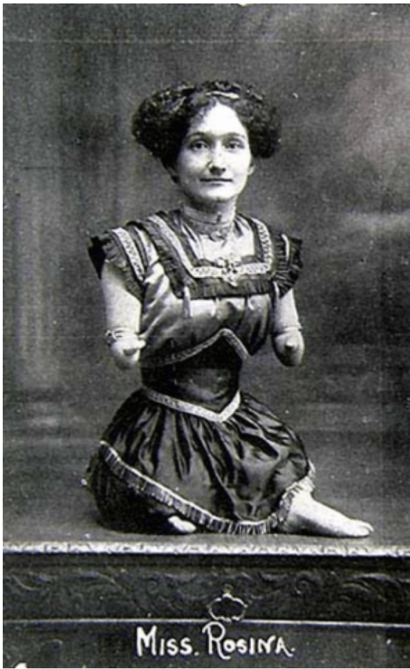
Josephine Myrtle Corbin had two separate pelvises side by side from the waist down, as a result of her body axis splitting as it developed.