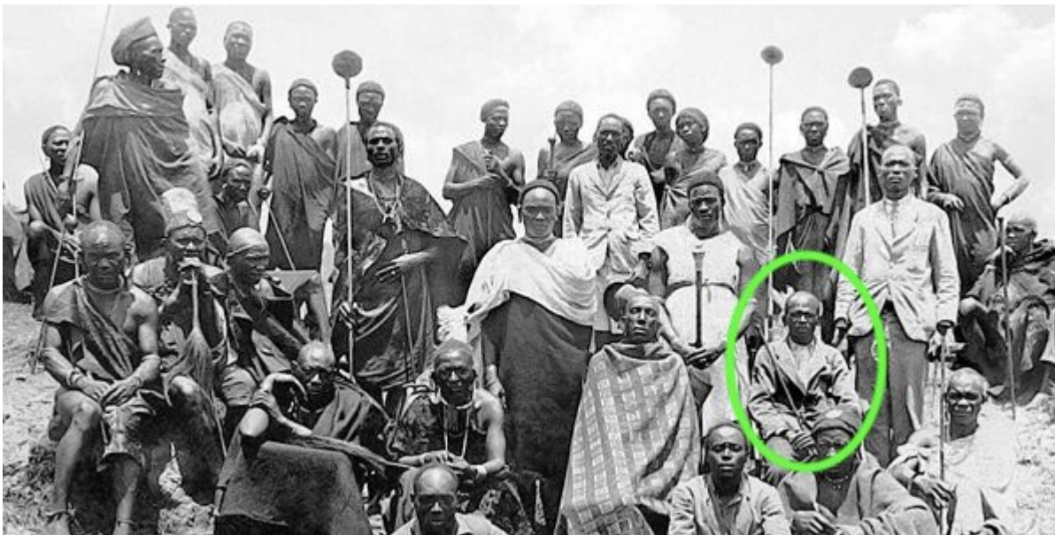
Pictured with other Kikuyu chiefs on the right.