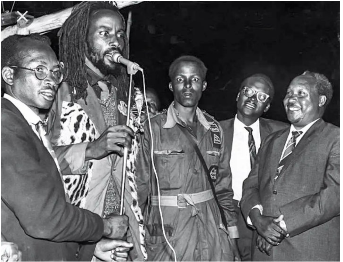
DEAR KENYANS, THE SONS AND DAUGHTERS OF COLONIAL CHIEF LIVES LIKE KINGS AND QUEENS WHILE THOSE OF THE MAUMAU FIGHTERS LIVE IN WORSE SITUATION THAN THE PROVERBIAL CHURCH MOUSE.