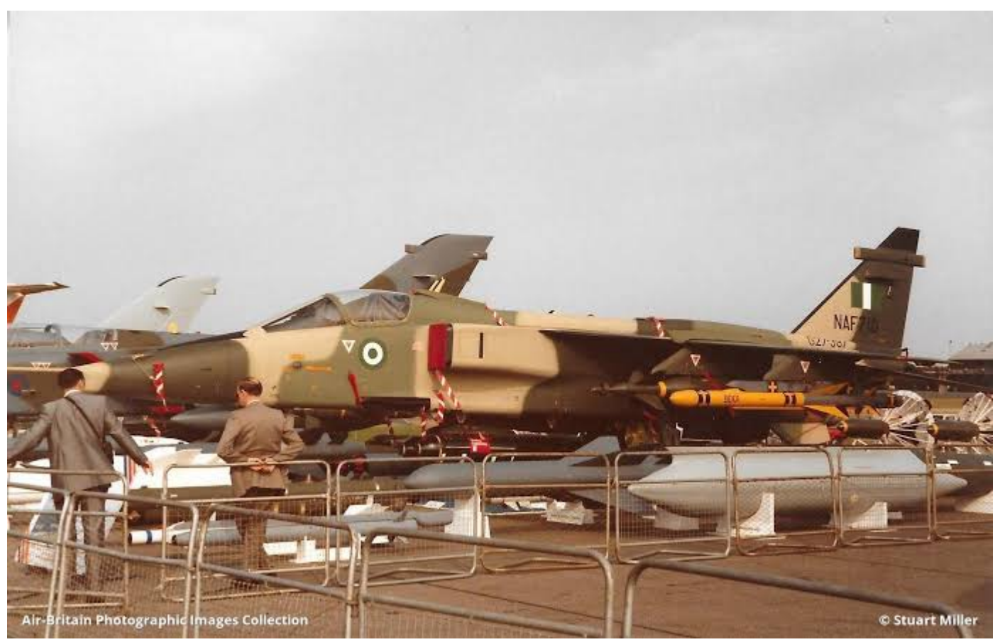
This fleet was augmented by 24 Aero L-39 Albatros armed jet trainers and a similar number of Alpha jets. This was by far the largest and most modern AF in Sub Saharan Africa excluding the South African Air Force. Apparently the West concluded the NAF was getting too powerfull

Makurdi was the home to the Nigerian Air Force's MiG 21 and SEPECAT Jaguar aircraft squadrons. The NAF operated a fleet of 18 Sepecat Jaguar fighter jets and 22 MiG-21 Fishbeds.