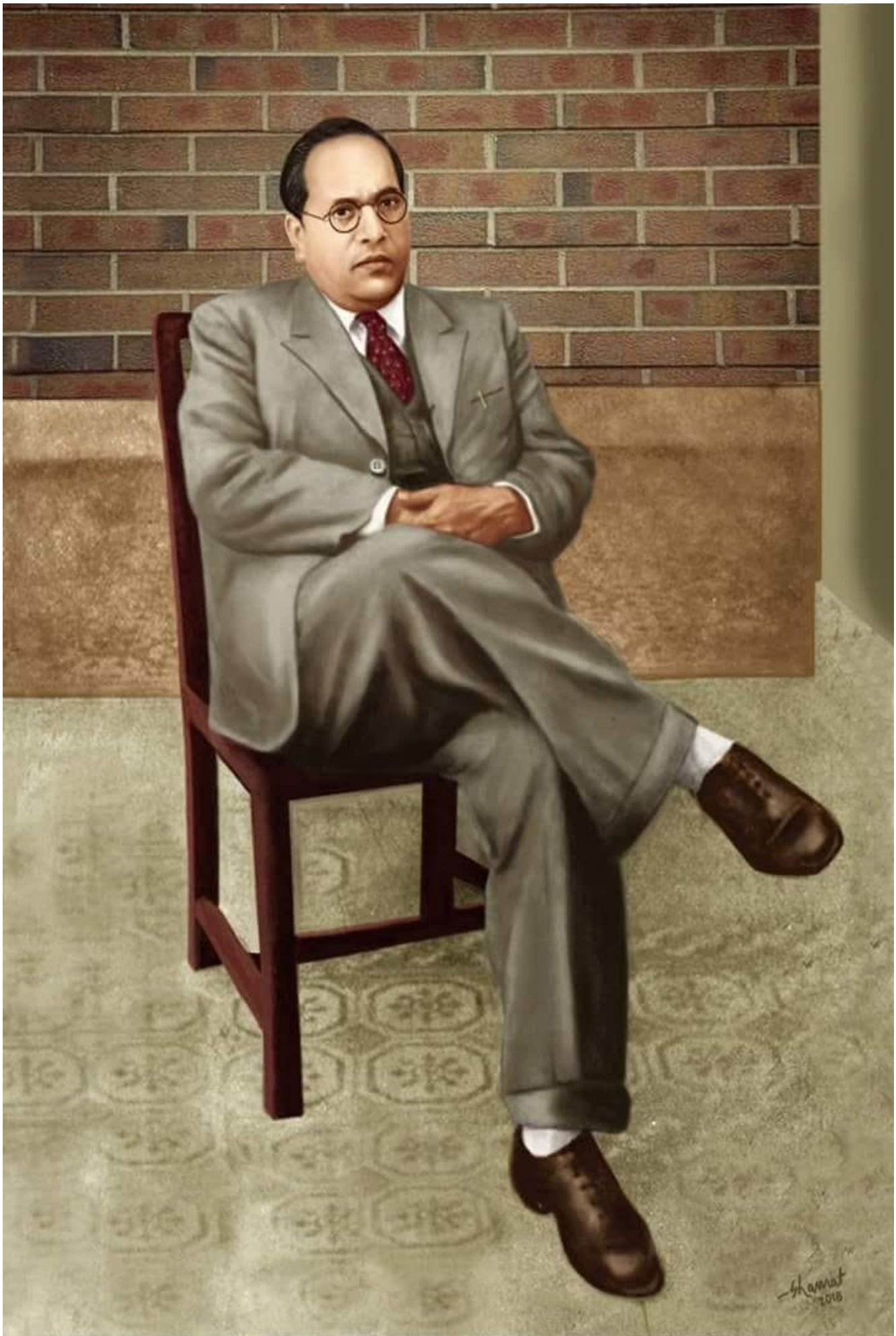
Along with him about 4 lakhs people accepted his sect. His book "Buddha and his dhamma" is the basis of his sect.