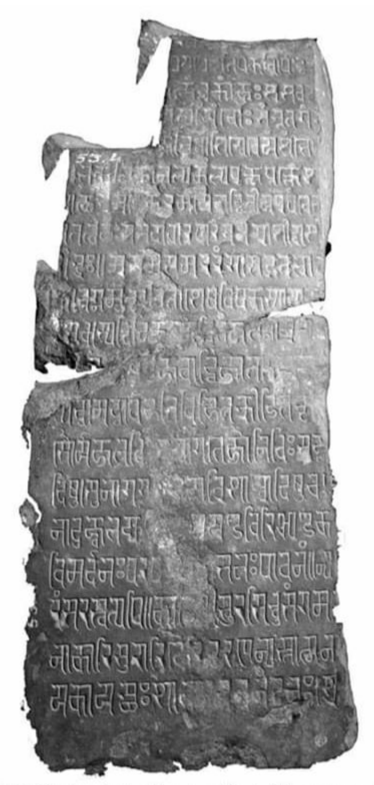
Fig. 10.1: The inscription discovered by A. Fuhrer presently at Lucknow Museum.