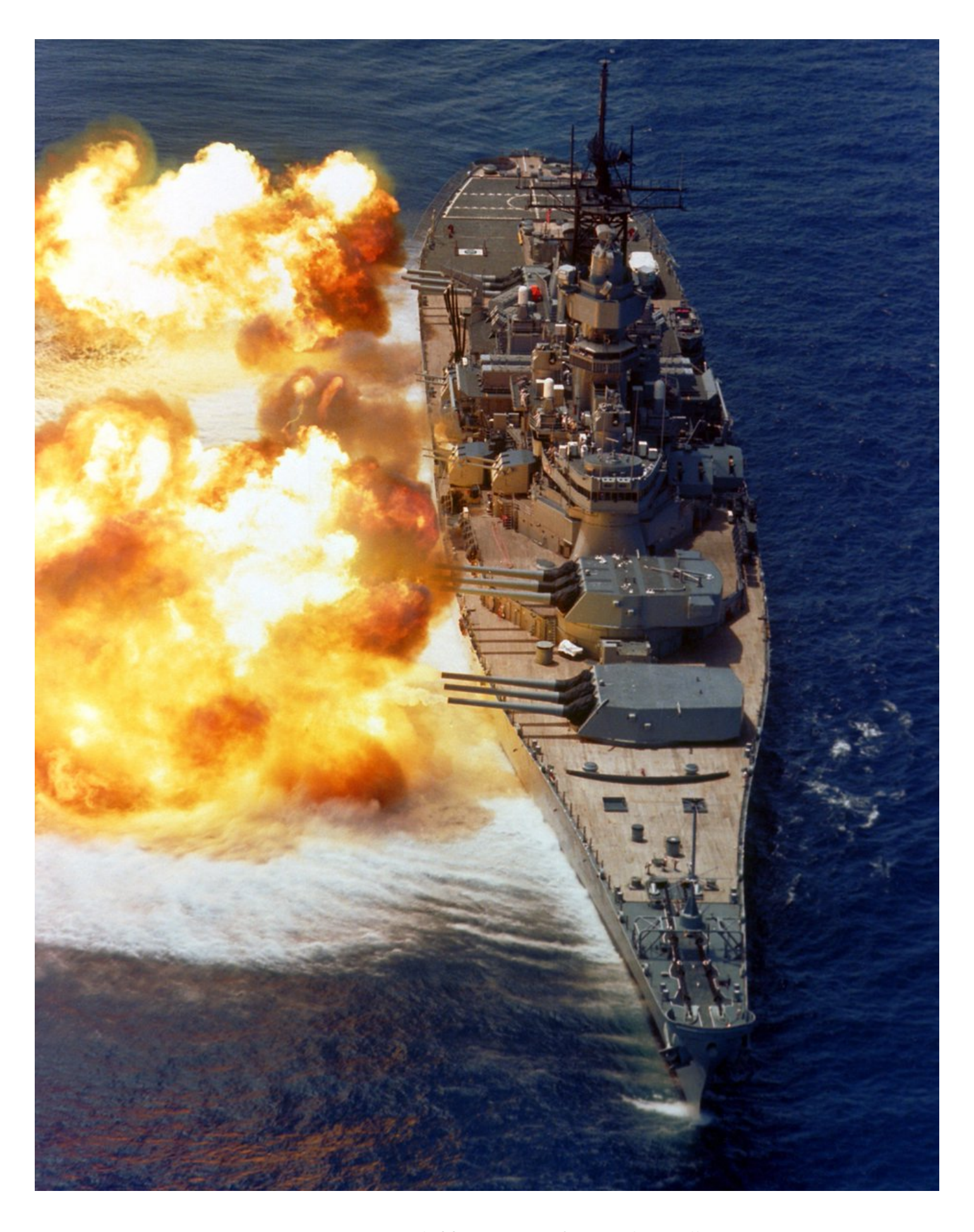
He served as the first African-American to command (USS Theodore E. Chandler (DD 717)); command a major warship (USS Jouett (DLG 29)) - and was the first African-American to achieve the rank of Captain in 1967. /5