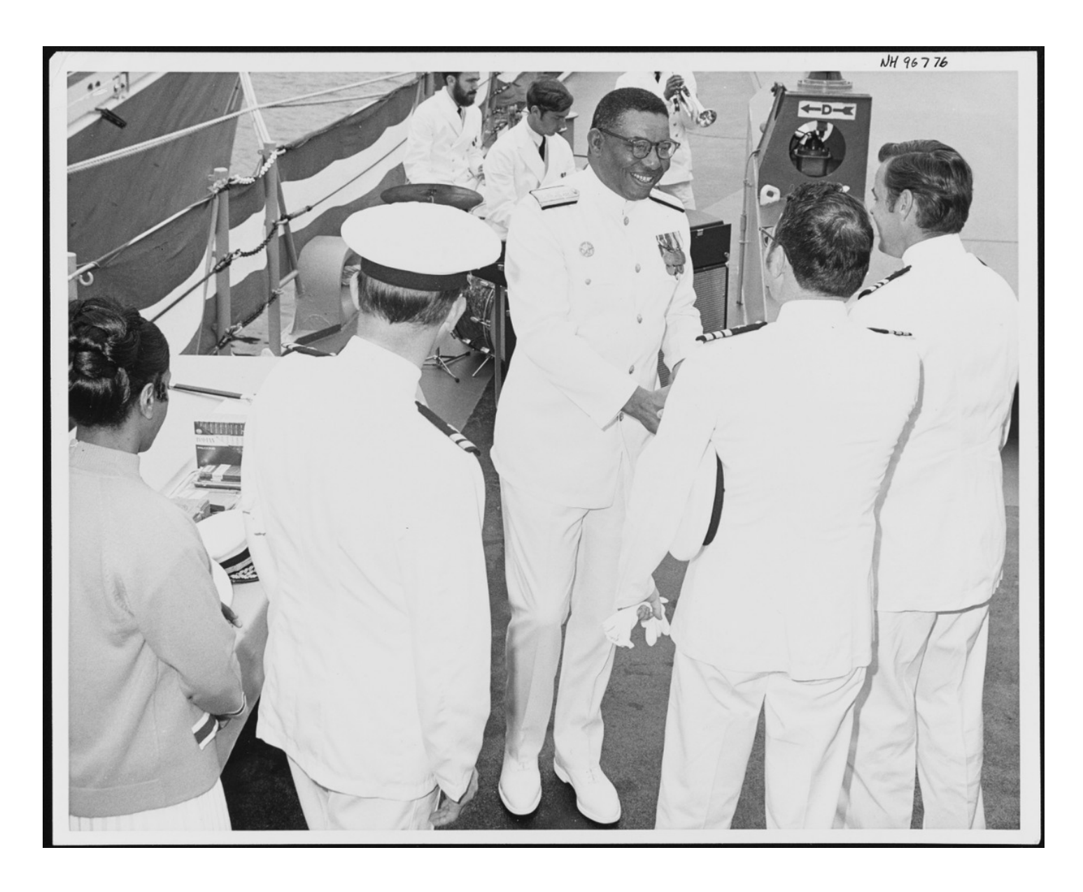
Sept 10th, 1976 - Three star Vice-Admiral Gravely, Jr assumed command of the Third Fleet. /7