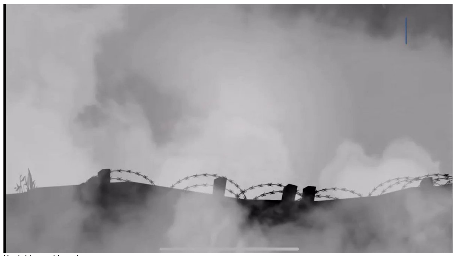
Yeah I know. I know!

Q856 On 11.11.18 Trump was parading at the cemetery with our fallen military patriots at American Cemetery of Suresnes France.