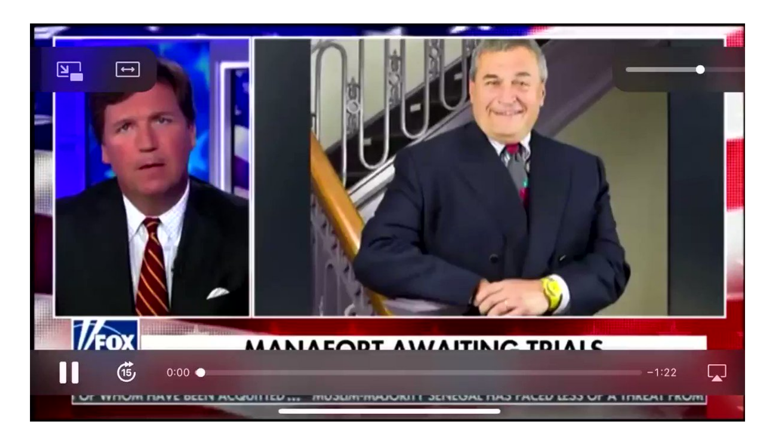
Read Q 34. Nice and slow. Think multiple meanings.