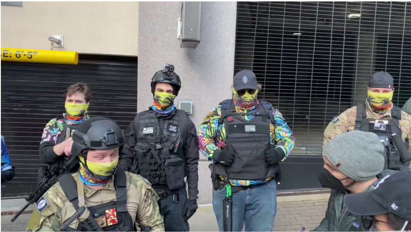
A handful of Proud boys are here. One is hawking t-shirts