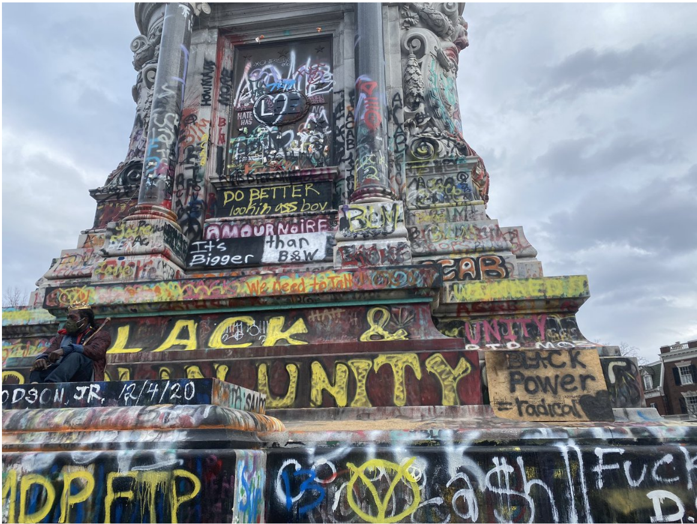
And now, your moment of zen