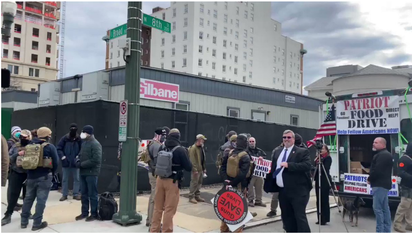
Boogaloo boys pose for photographers