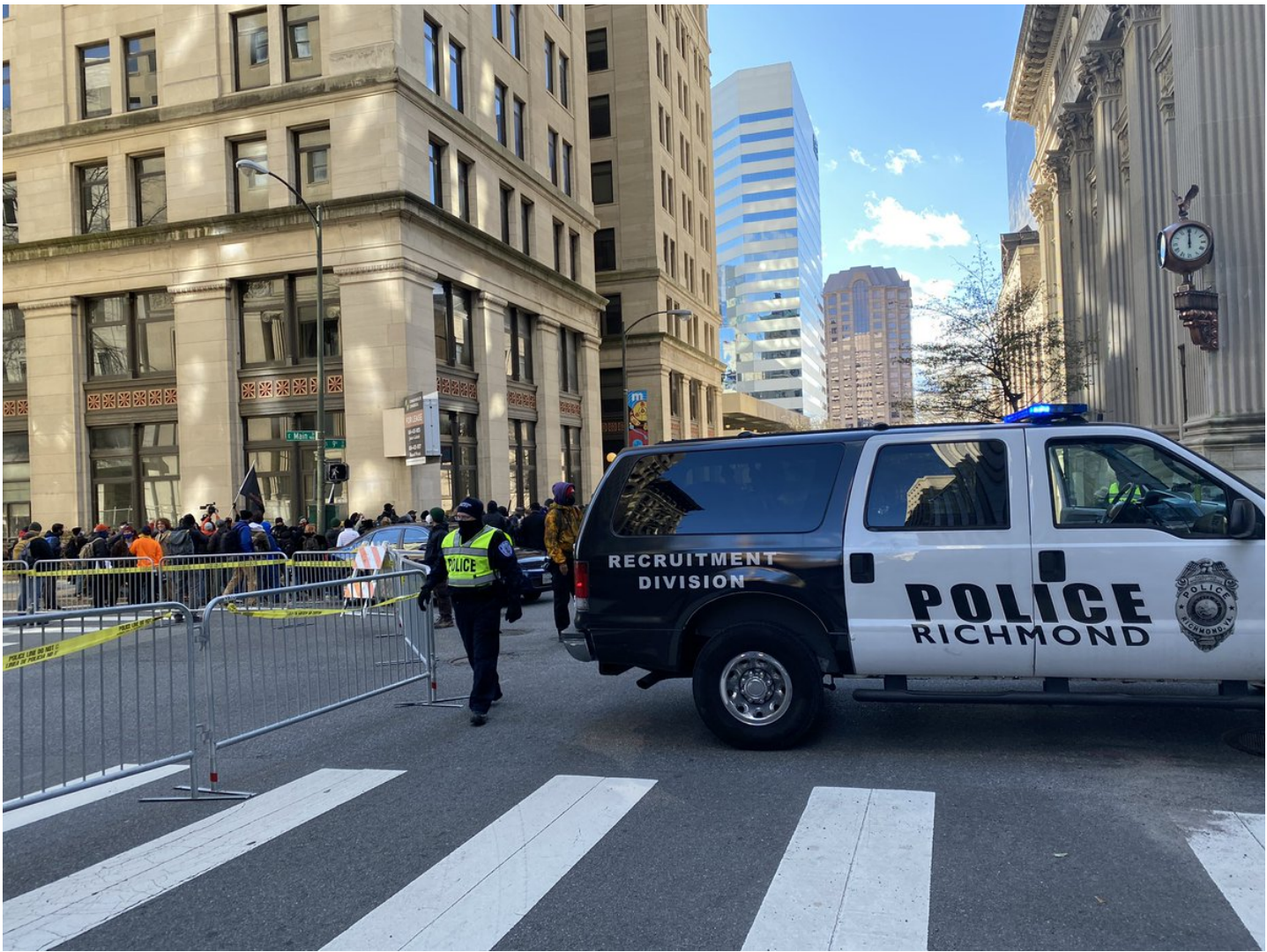
The original Black Panthers of Virginia are here in support of the 2nd amendment