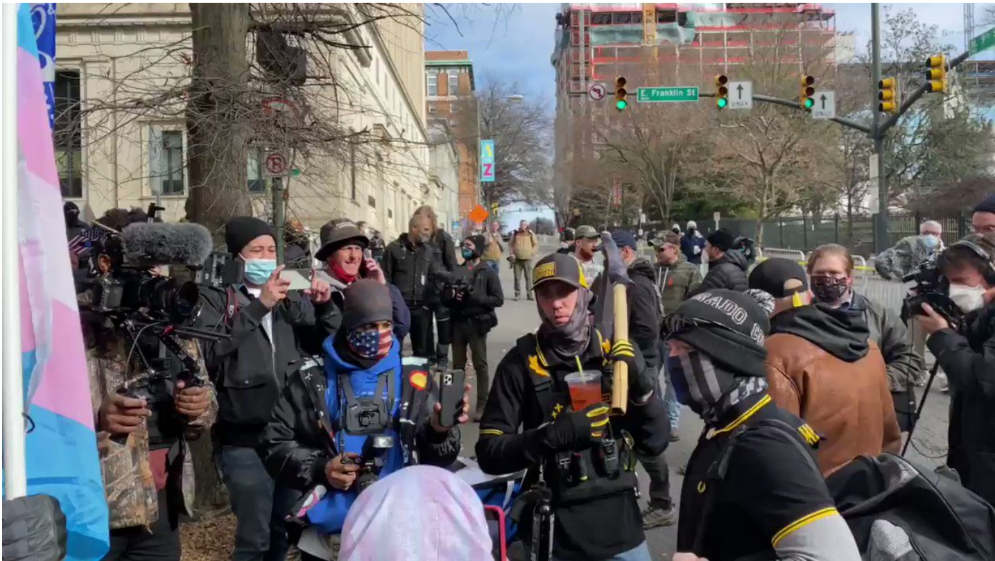
While many of the MAGA groups didn't show up to state capitols this weekend, boogaloo boys across the country did, albeit in small numbers.