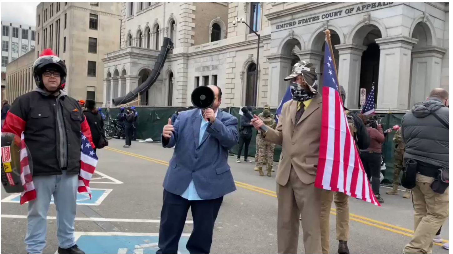
There is no tension.