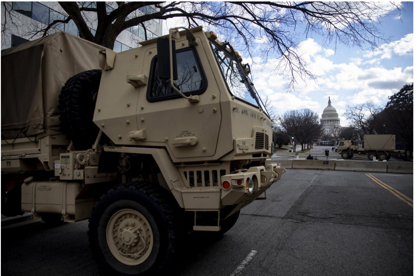
Speaking of the bridges closing, @JWPascale mapped out the street closures. As Mayor Muriel Bowser put it: “Clearly we are in uncharted waters.” https://t.co/qU9IOPCqsx