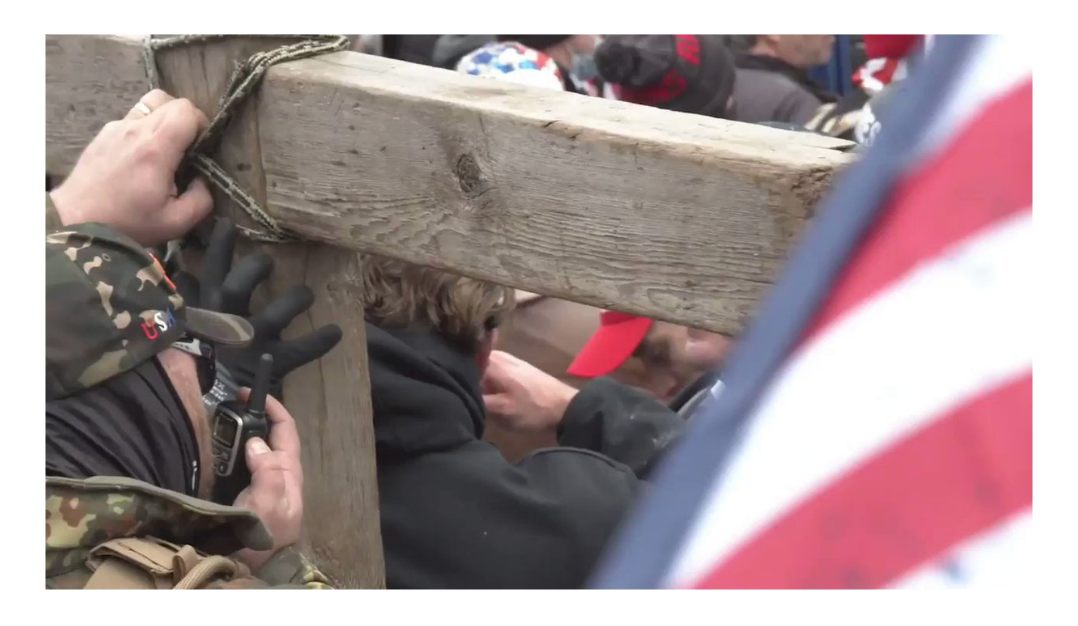
"If you ain't ready to go in there, get the f**k out of here." yells a rioter in tan camouflage