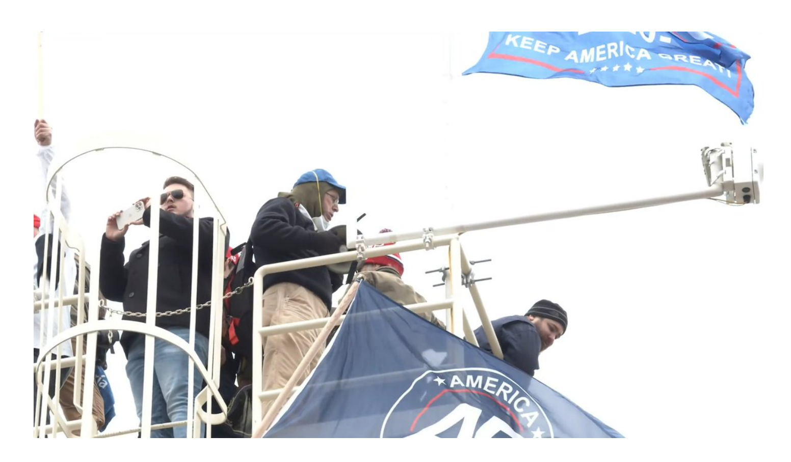
Agitator on bullhorn with blue hat the crowd to push forward. "We can get them on the run if we push forward" #SeditionVids #SeditionHunters