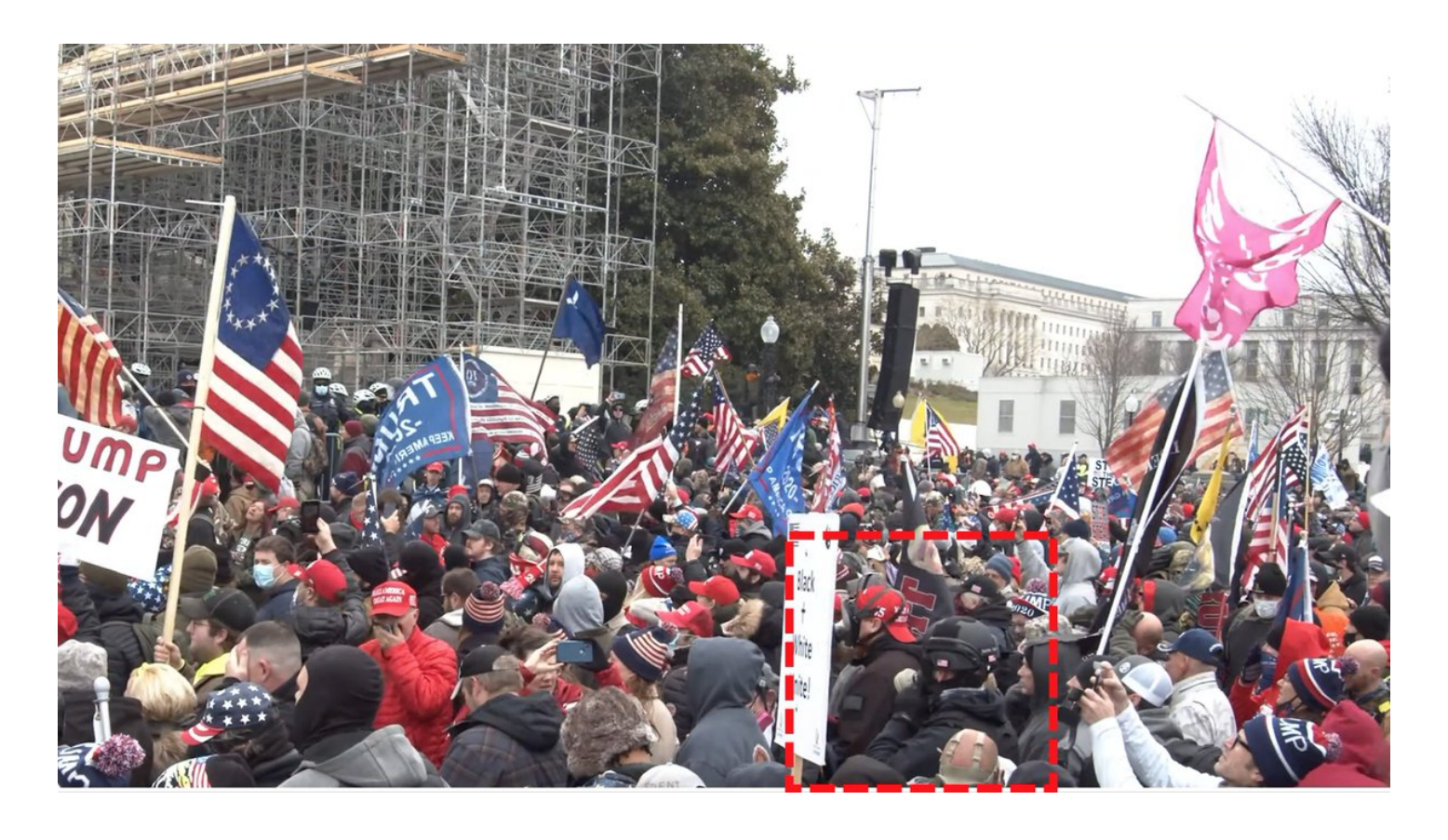
Looking for trouble