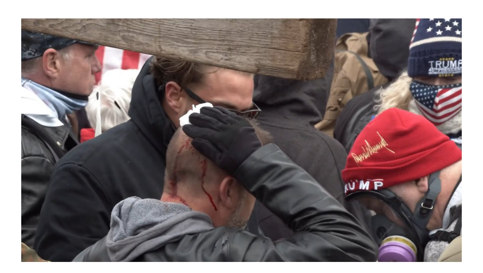
Looking for trouble #SeditionVids #SeditionHunters