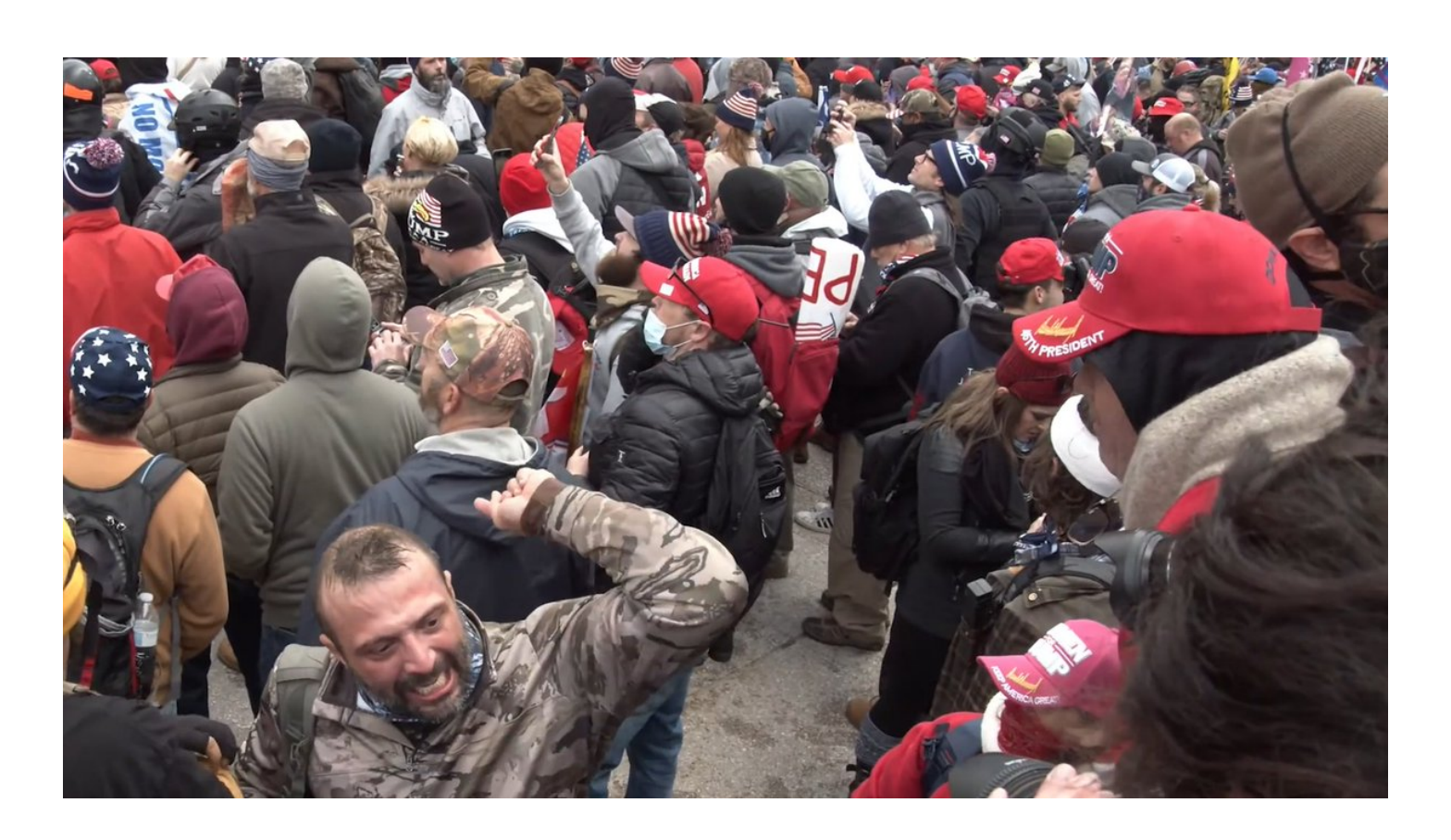
"If you ain't ready to go in there, get the f**k out of here." yells a rioter in tan camouflage. #SeditionVids #SeditionHunter