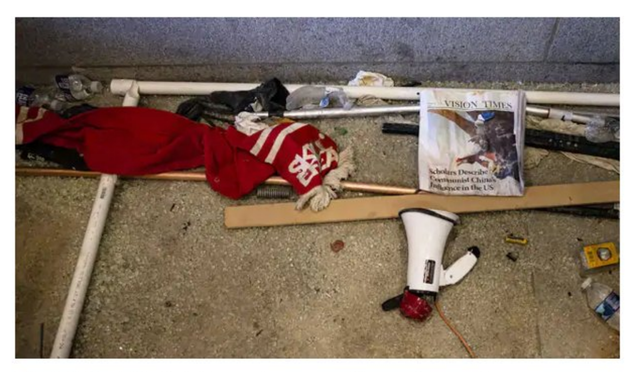
Bild från förödelsen dagen efter stormningen. Bland bråten ligger den röda halsduken kvar.

1) This pic published in the Daily Mail showing debris left after terrorist attack on US Capitol seems relatively unremarkable. But a man in Sweden noticed something: the red scarf at the top with the name of the northern Swedish city of Skellefteå. Then it got interesting.