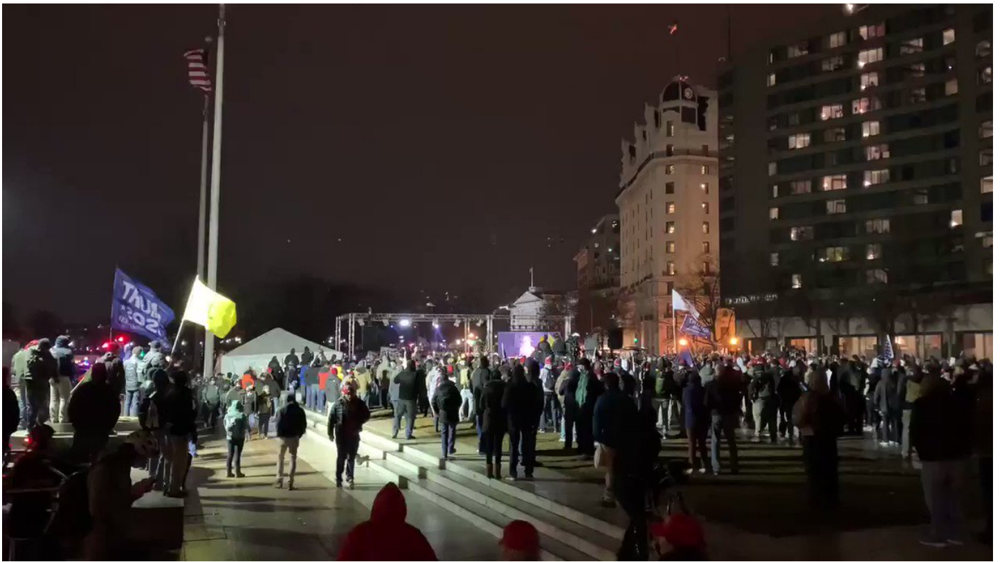
Here's more. You don't need to know a lot of history to know the mayhem that comes from mixing religion with violent political movements. BTW, "Deus Vult" is a crusader thing: "God wills it". 7/9