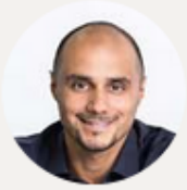
Khaled bin Alwaleed