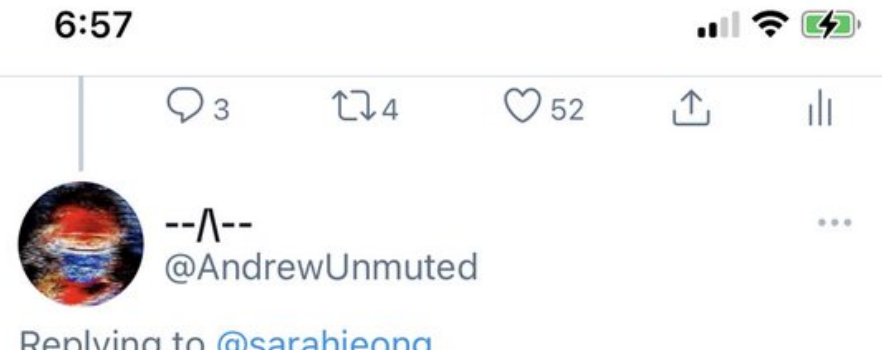
Replying to @sarahjeong

Of course you don't know, you are a legendary participant in the formation that cycle and have profited from it in a way few have.