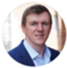
James O'Keefe @JamesOKeefeIII