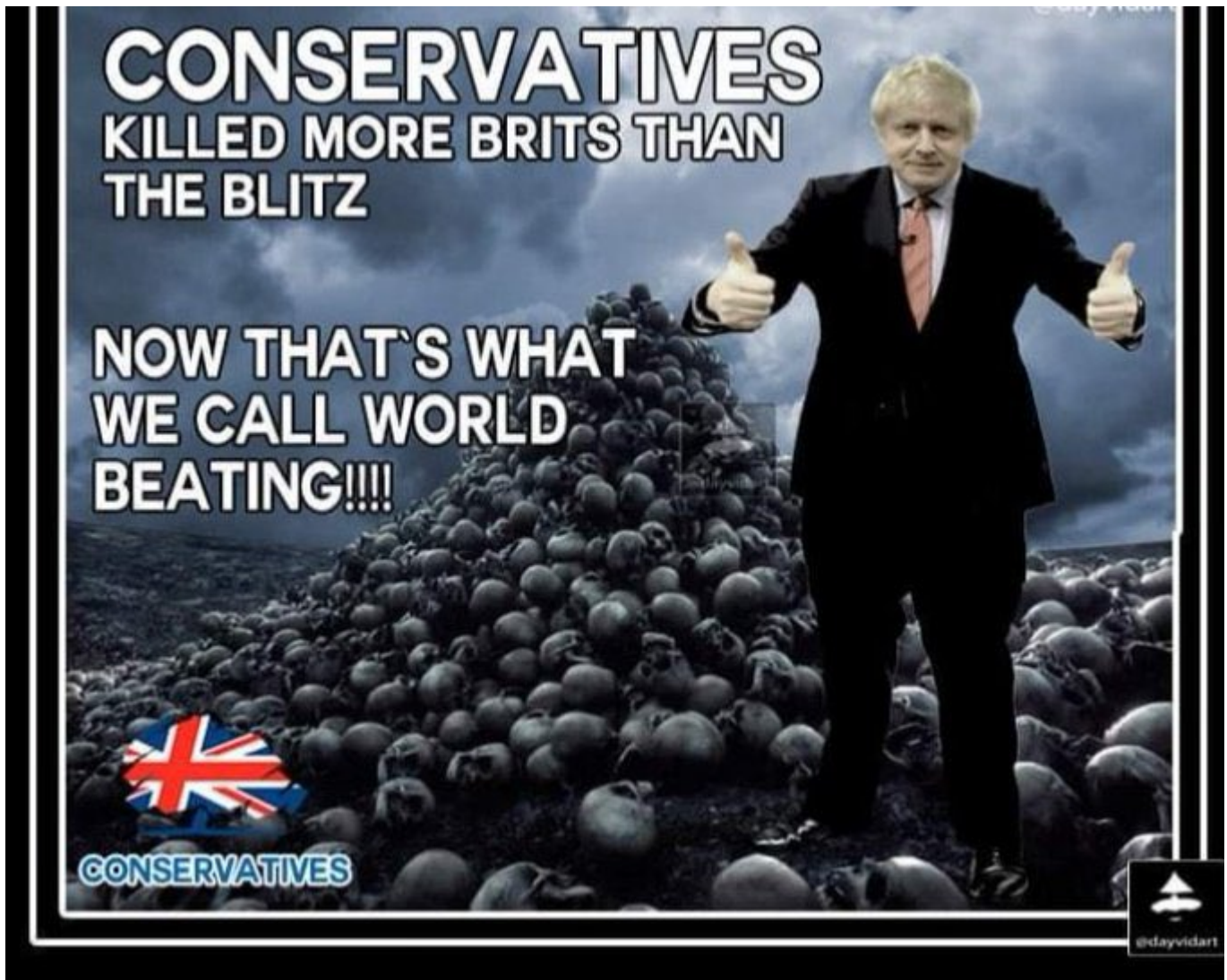
The brexit 'strategy'.