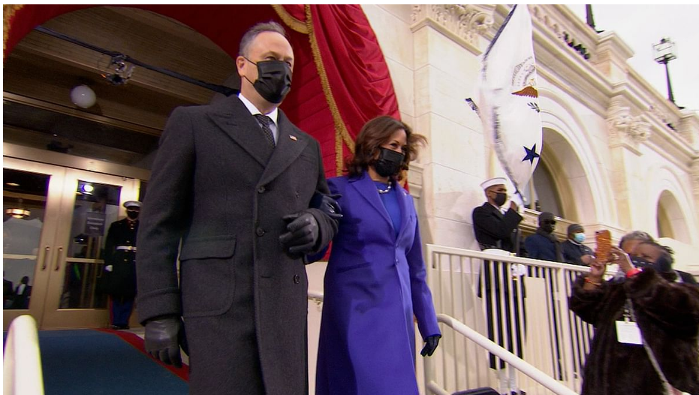
POTUS Joe Biden as Sodalite