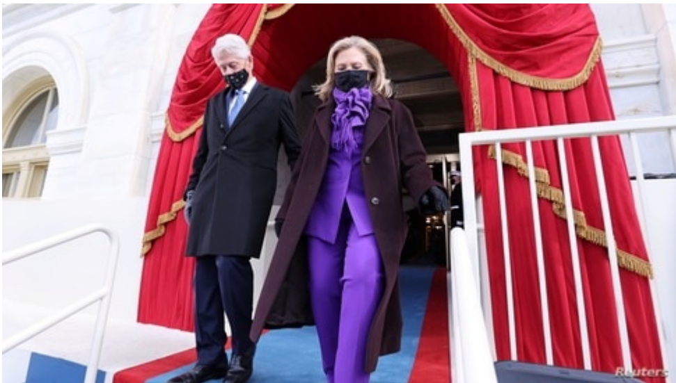
Amanda Gorman as Wulfenite