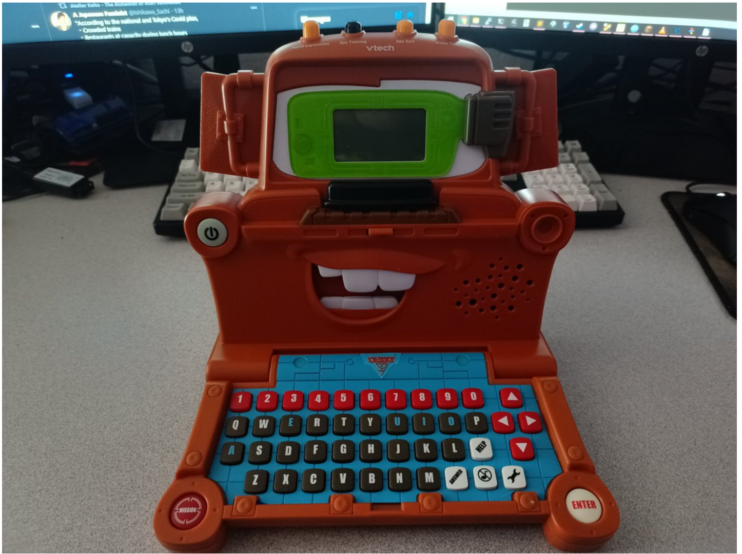
Honestly I've seen much worse keyboards