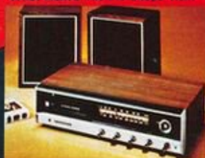
RE-7800 The Montvale: FM/AM/FM combination stereo radio and 8-track stereo cartridge player. With contemporary black-out and illum. slide-rule tuning, phono, headphone jacks. Walnut cabinetry. Twin speakers. $179.95*