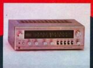
SA-5500 46-watt FM/AM stereo receiver with Quadruplex™ circuitry, direct-coupled amplifier, two tape monitors, microphone inputs, headphone jack. Rich genuine walnut cabinetry. $249.95*