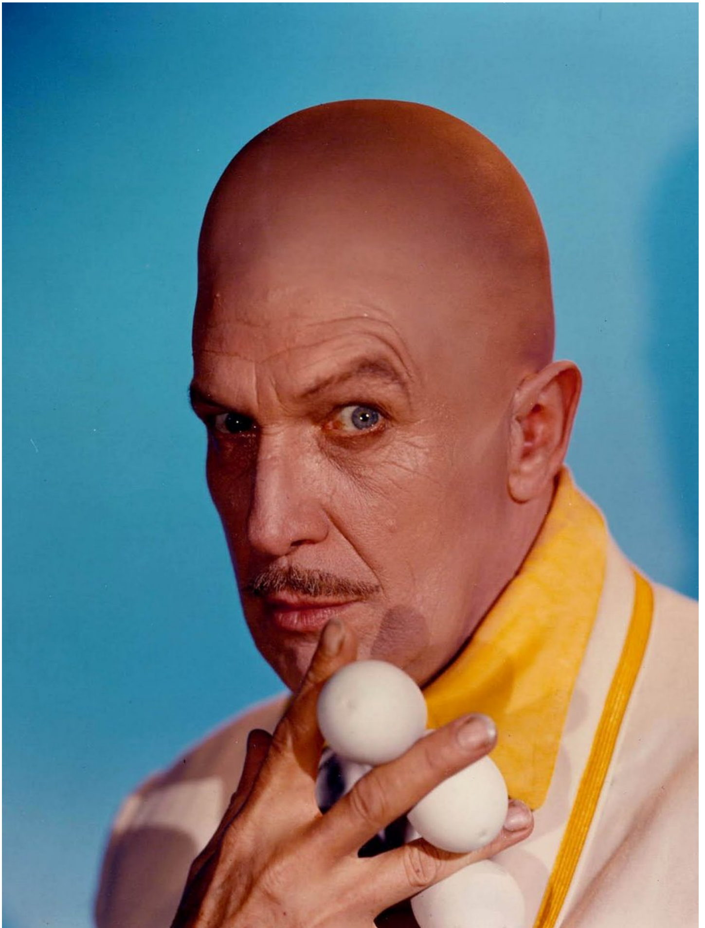
Fake chicken eggs are a problem in China. Manufactured false eggs made from resin, coagulent and starch in a counterfeit shell are being sold as real by fraudsters. #WorldEggDay