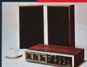
RE-7680 The Powell: FM/AM/FM stereo radio 3-pc. system. With IC, tuning meter, stereo eye and selector. Solid-state throughout. Dual 6½" air-suspension speakers. Real walnut wood cabinets. $129.95*