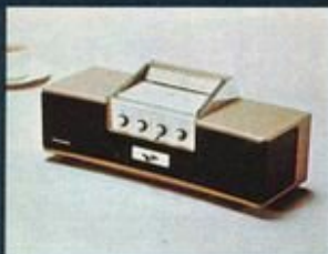
RE-7392 Bellport: FM/AM/FM stereo table radio with outstanding stereo separation. Has dual 4" speakers, Hi-rise tuning dial. Slide-lever balance control. All solid-state. $59.95*