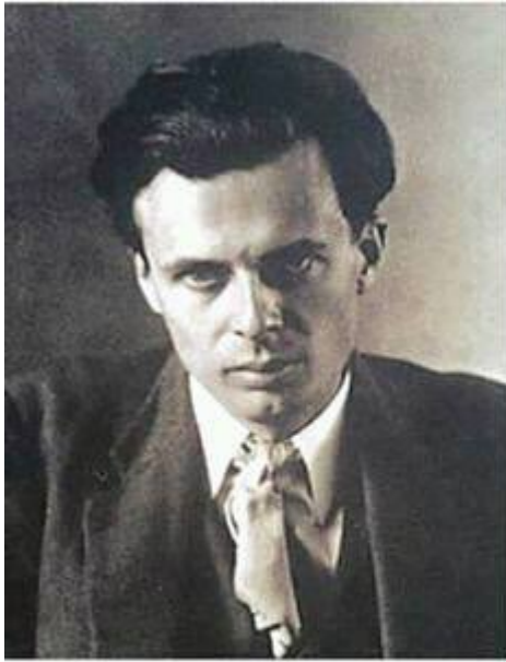
Aldous Huxley (1894-1963)

"There will be in the next generation or so a pharmacological method of making people love their servitude and producing dictatorship without tears so to speak. Producing a kind of painless concentration camp for entire societies so that people will in fact have their liberties taken away from them, but will rather enjoy it, because they will be distracted from any desire to rebel by propaganda, or brainwashing, or brainwashing enhanced by pharmacological methods. And this seems to be the final revolution."