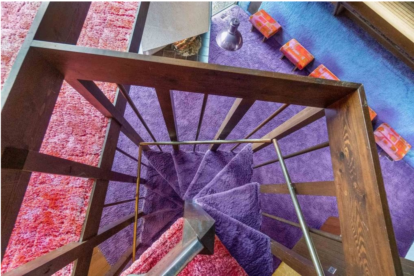
Playroom, dungeon, playroom...