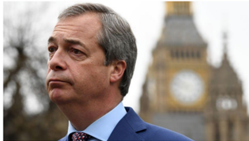
Nigel Farage