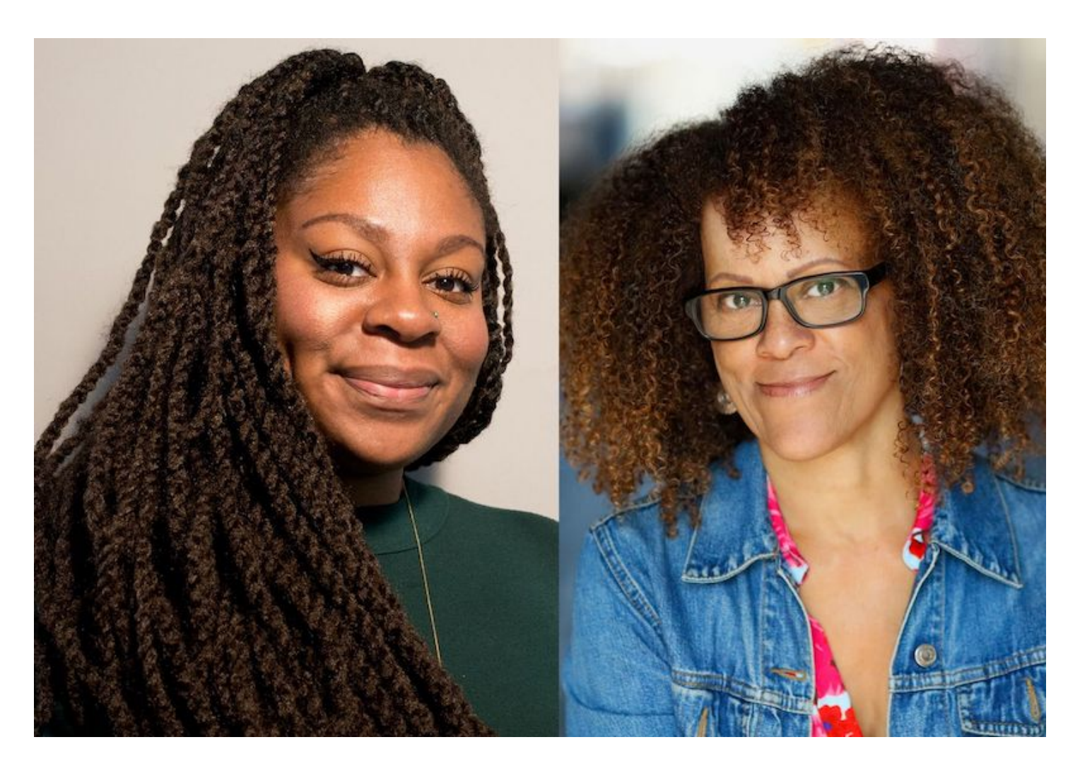
24) Nanaia Mahuta, who is M I ori, was appointed as New Zealand's foreign minister - the country's first Indigenous woman to hold that office III

New Zealand's parliament looks set to be one of the most diverse in the world ■