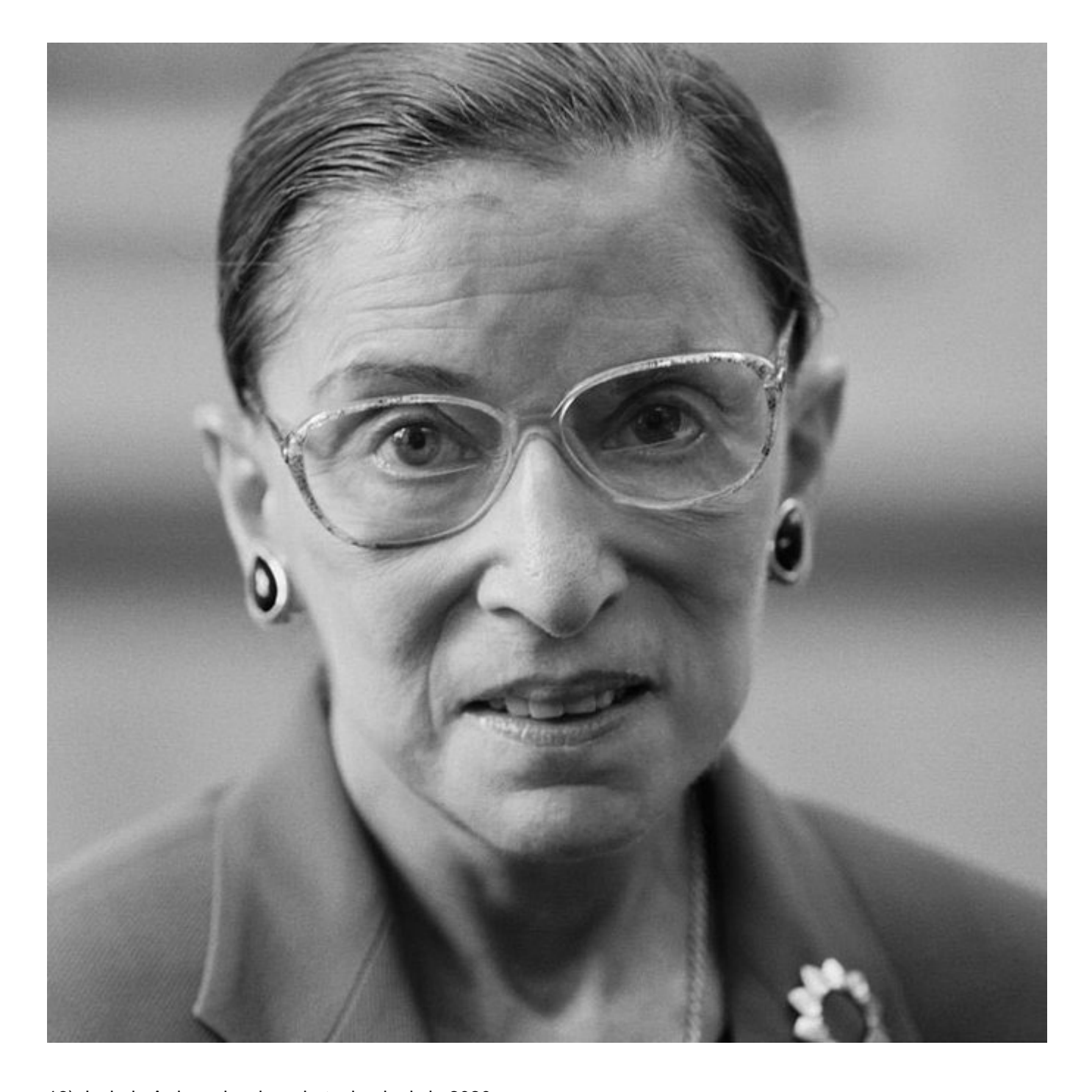
18) Jacinda Ardern showing what a leader is in 2020

Re-elected as Prime Minister of New Zealand ■