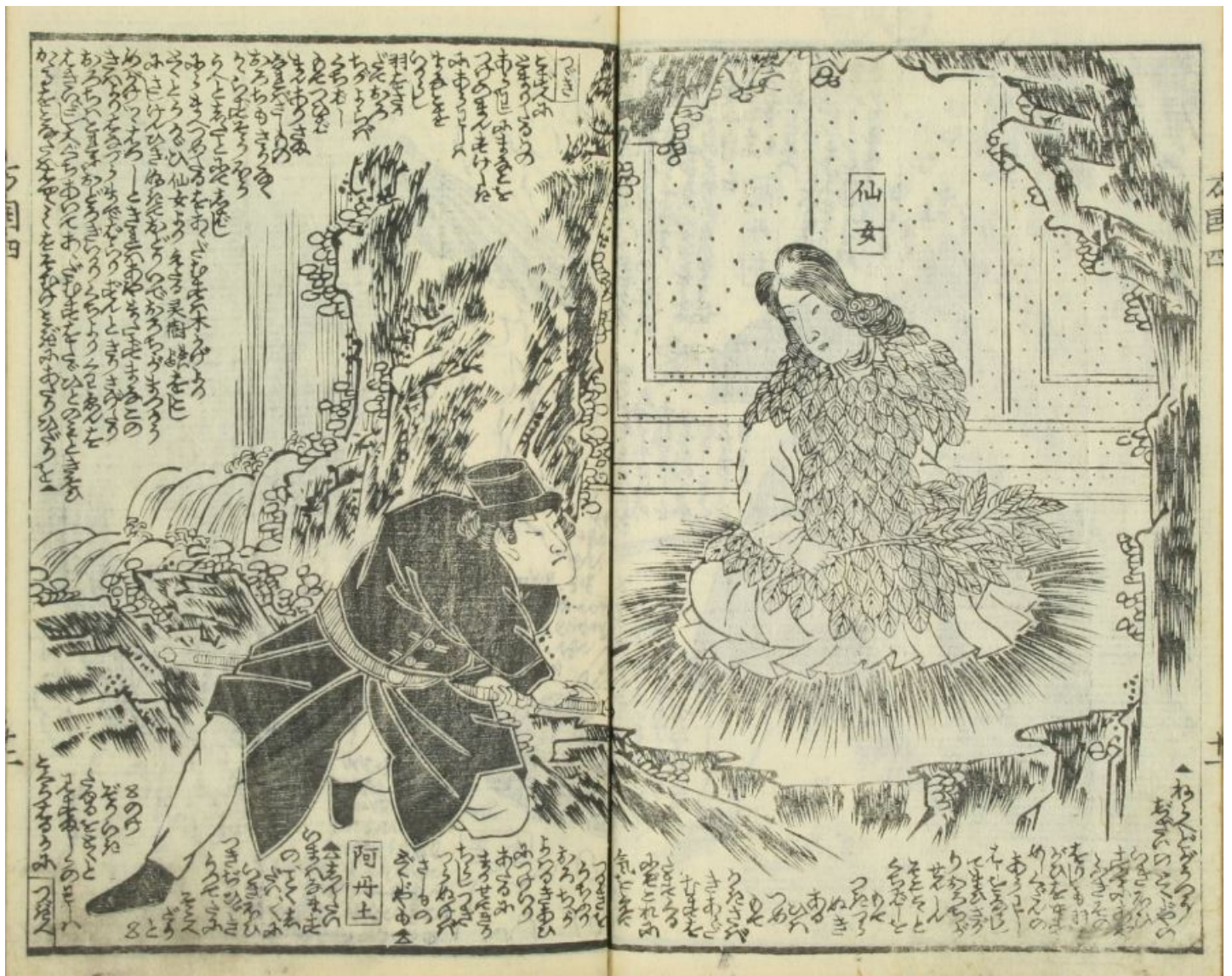
The mountain fairy does Adams a solid, and summons a gigantic eagle! 13/