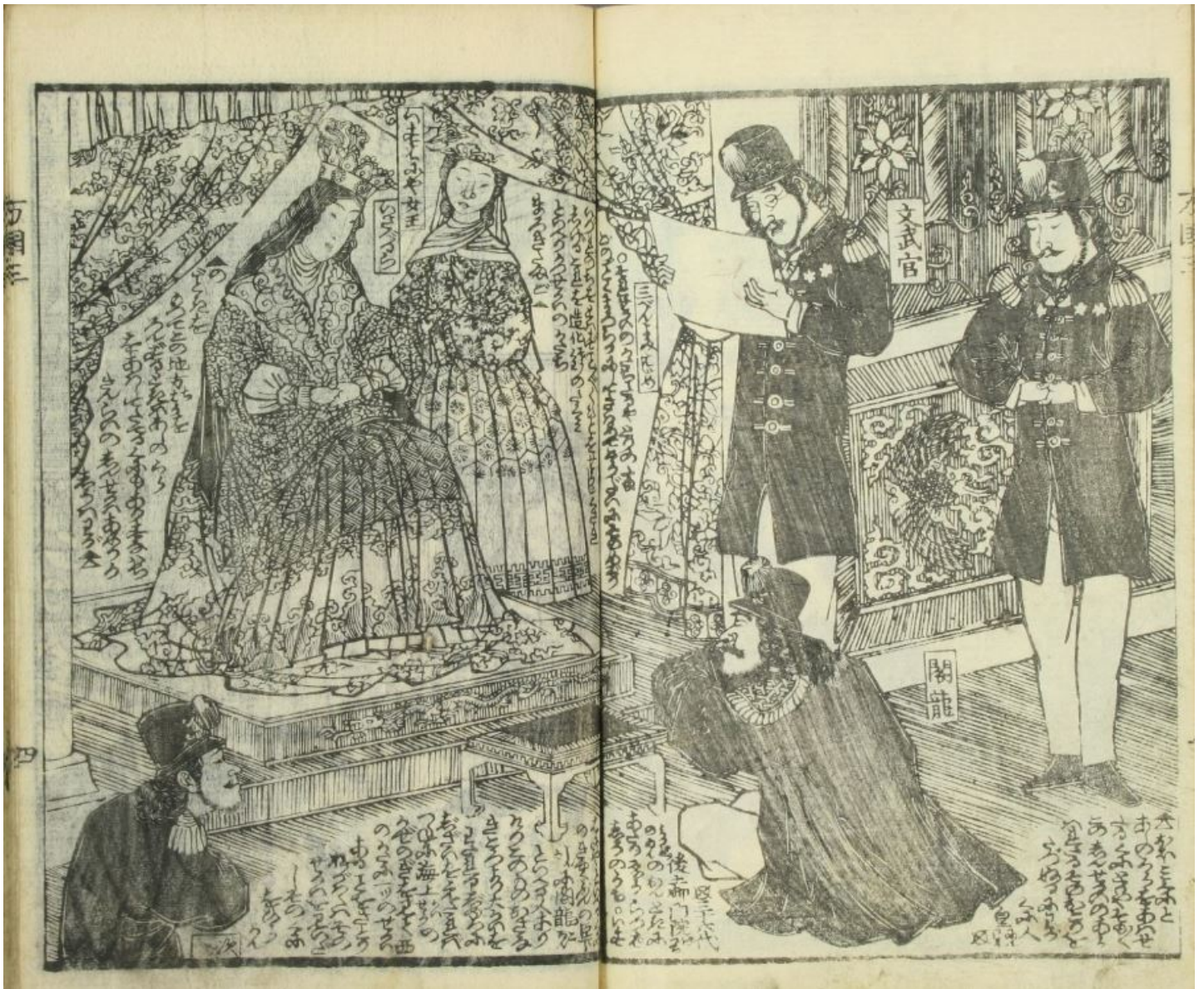
Now it's the American Revolution. Here is George Washington defending his wife "Carol" from a British official named "Asura" (same characters as the Buddhist deity). 3/