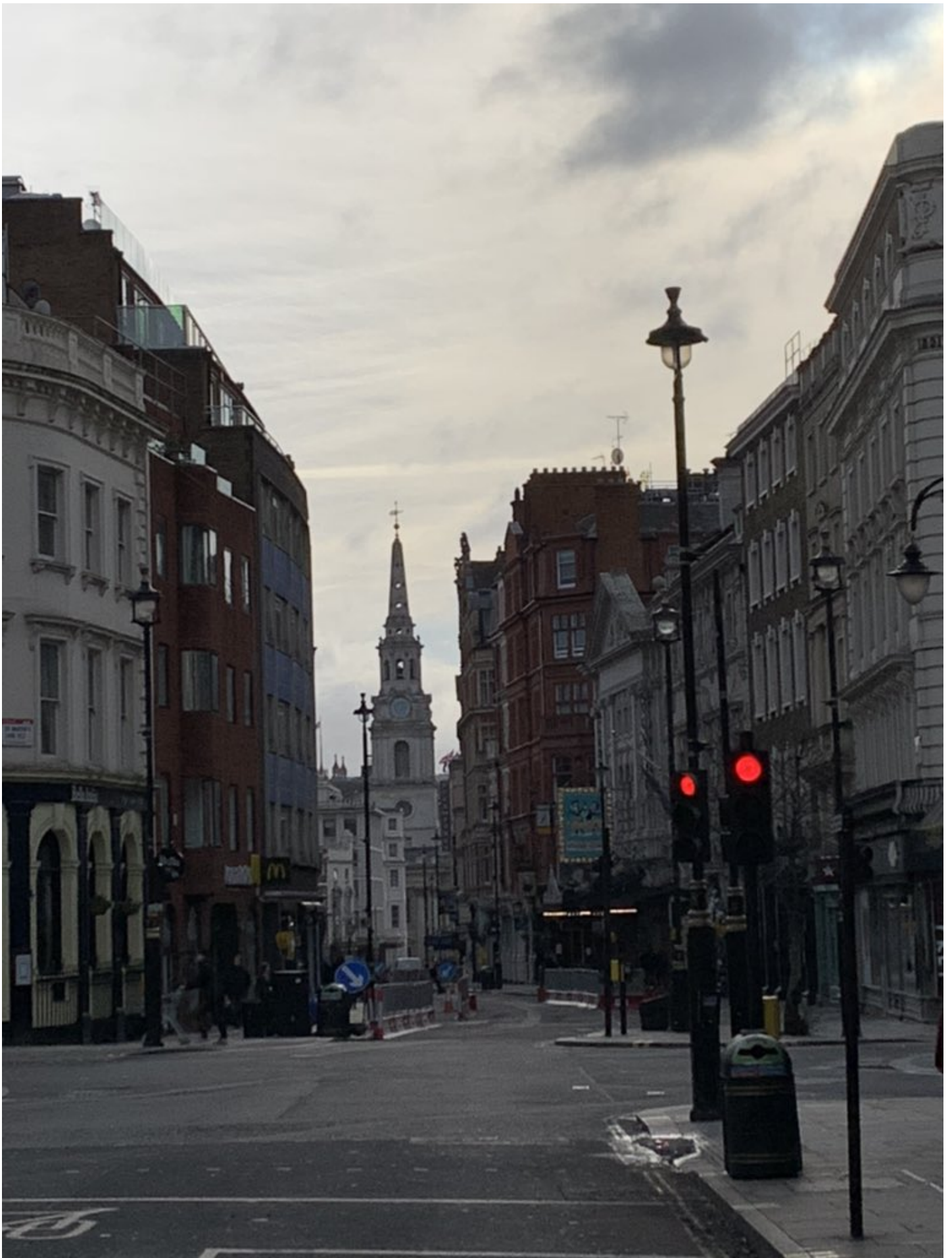
The side alleys and courts leading down onto St Martin's Lane make evident what I had never previously realised - that they were once the banks of a ditch