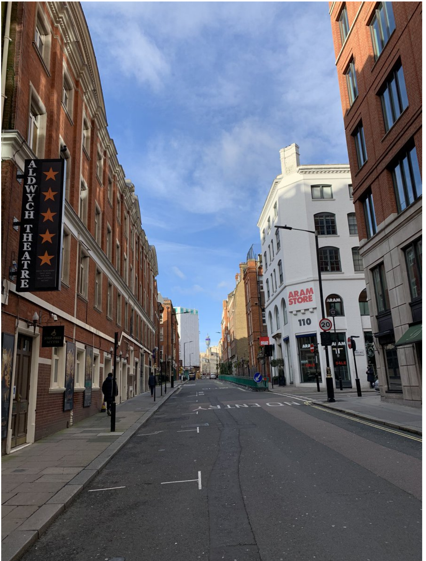
Here, where Shelton Street joins Drury Lane is where the Bloomsbury Ditch was joined by the #CockAndPye Ditch. Ahead, in the 17th century, lay the Marshland, which in the second half of the 17th century became Cock & Pye Fields, & then in