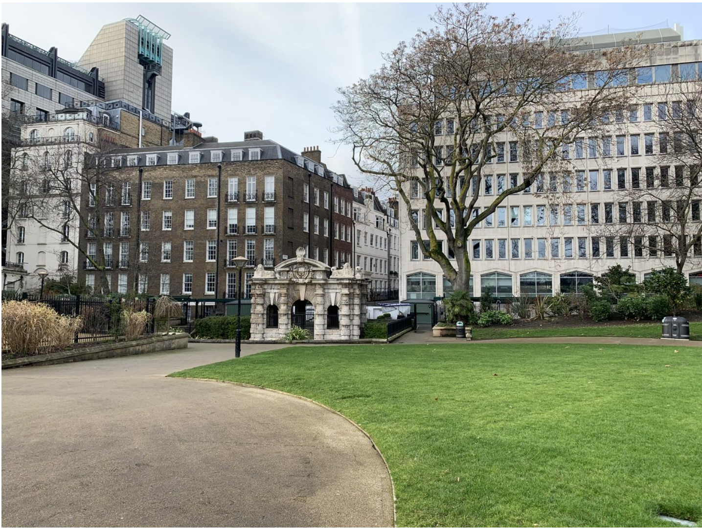
And there it is - journey's end! #CockAndPye