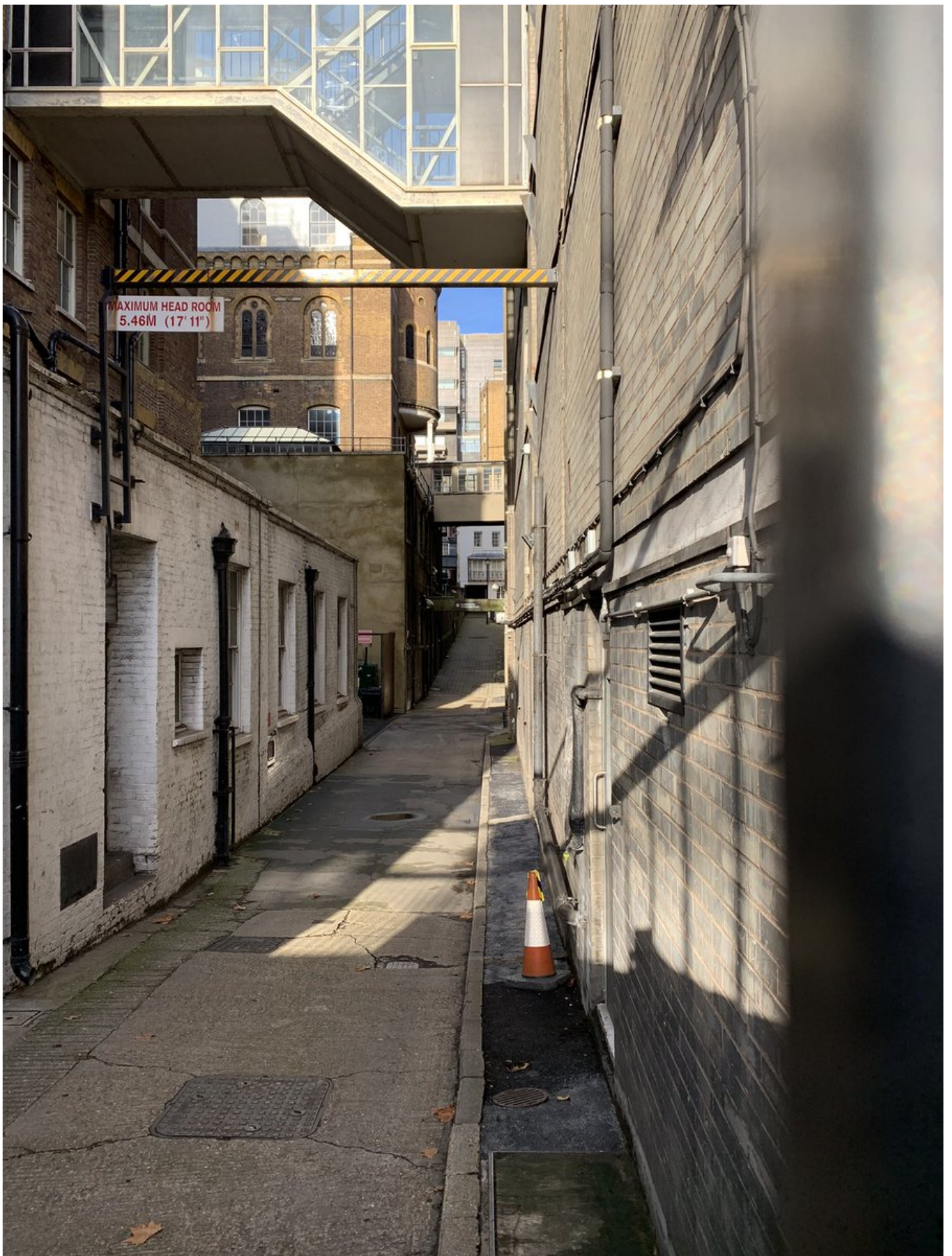
The Strand crossed the Ditch here, between St Mary-le-Strand St & what is now Australia House. In the 18th century its banks were so busy with prostitution that Boswell could barely be kept away from them.