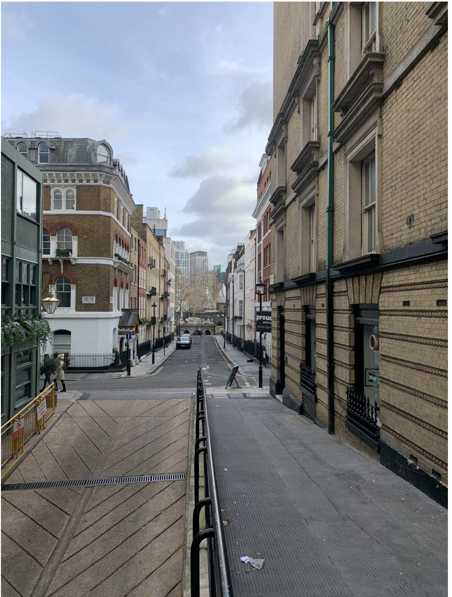
The York Watergate, built in 1626 to a design perhaps by Inigo Jones, looking towards what, in the early 19th century, was Hungerford Stairs, where the young Charles Dickens worked - to enduringly traumatic effect - in a blacking factory.