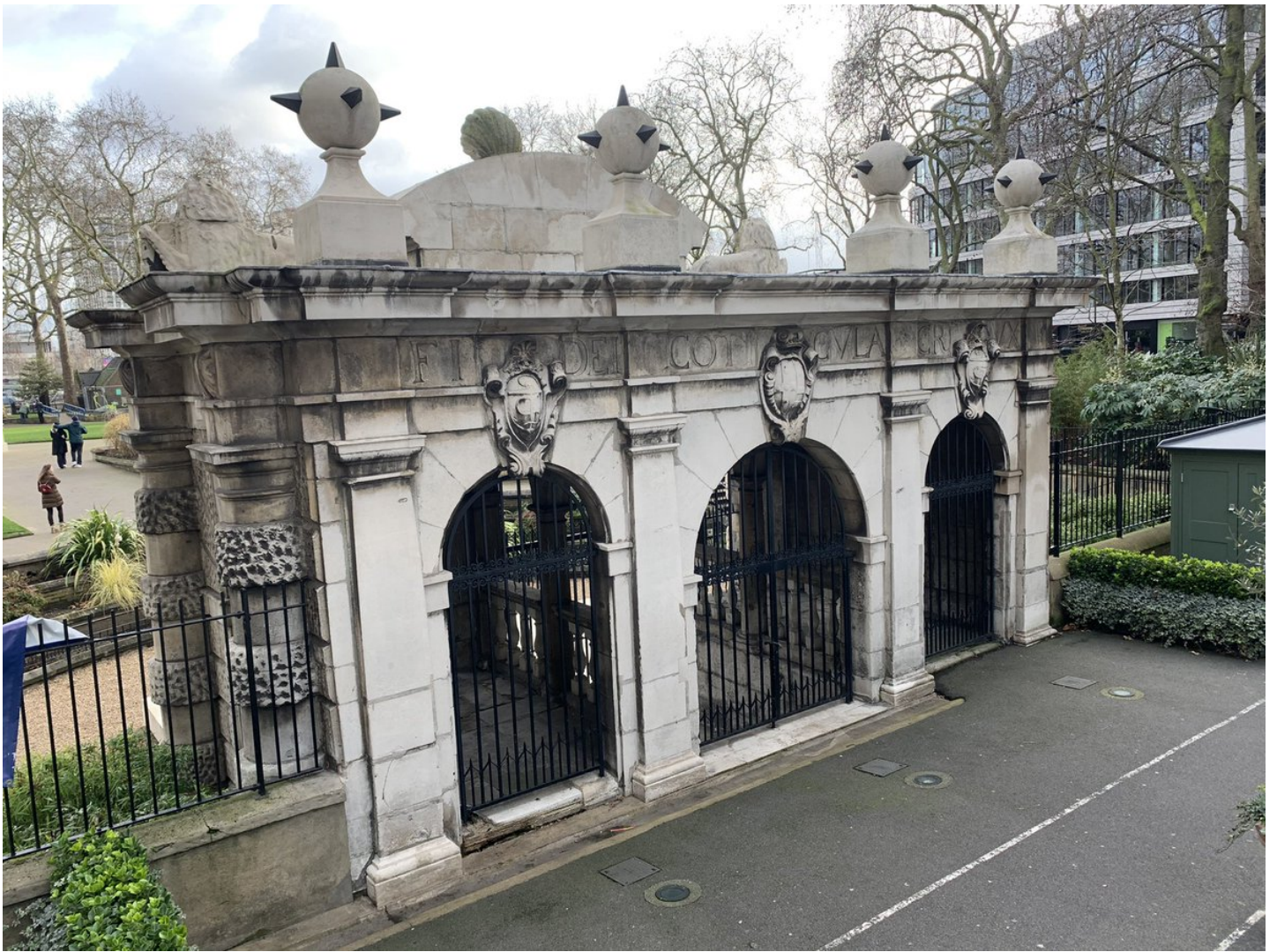
The York Watergate was left marooned inland by the development of the Victoria Embankment, which covers the huge sewer running parallel to the Thames into which the #CockAndPye Ditch now flows...