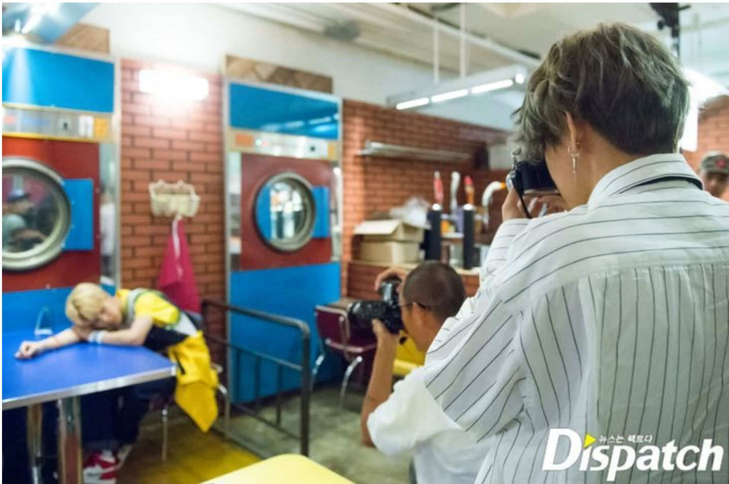
his muse definitely