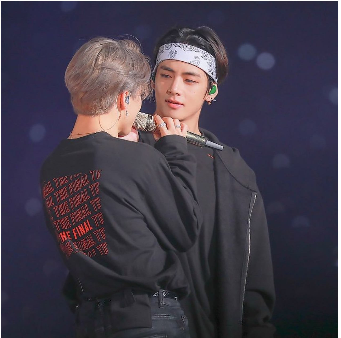
he looks at him like he is gonna marty him