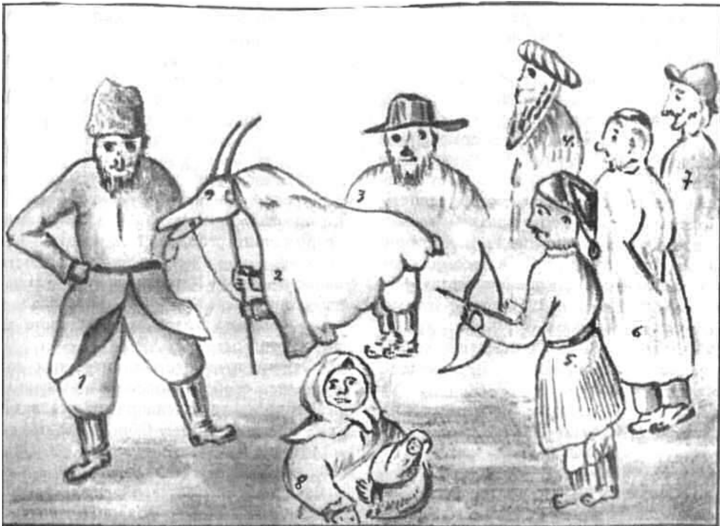
Действующие лица в обряде «вождение козы» на Украине: 1.Соломенный дед (Поводырь); 2.Коза; 3.Судья; 4.Шурок; 5.Козак; 6.Лекарь; 7.Цыган; 8.Баба с ребёнком.