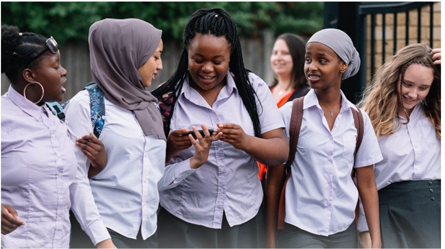
#FilmsOf2020 6. Bombshell

It's hard to remember a time that Covid and Brexit weren't the big news items, but this film, set on the outset of the #MeToo movement is a brilliant and important reminder of events.