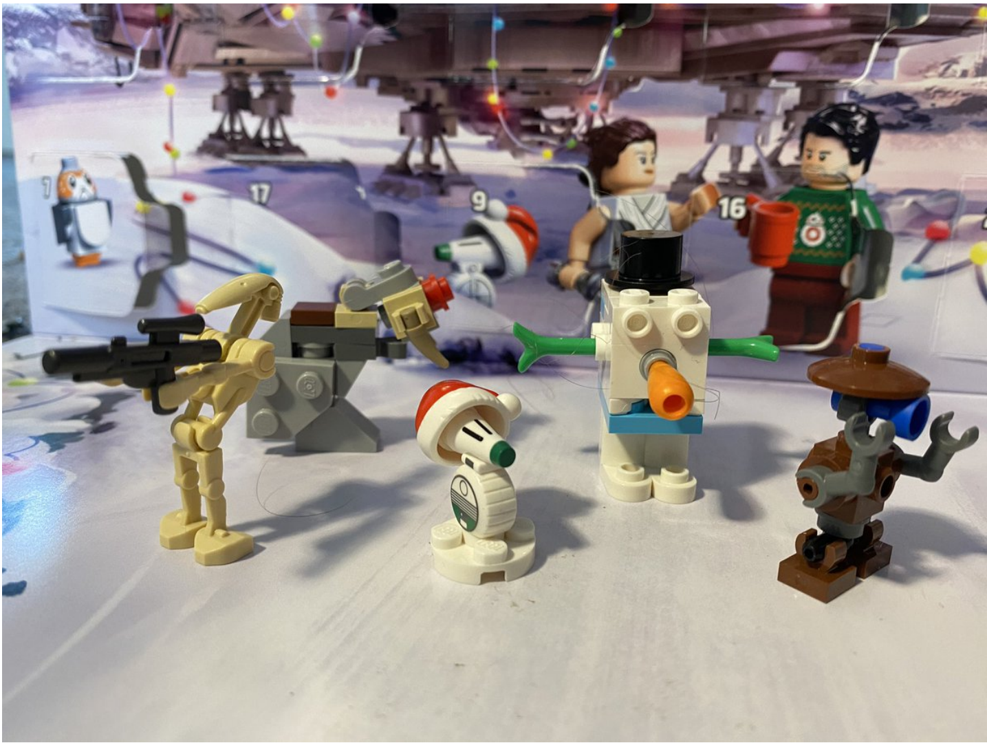
And they gathered together with the shepdroids and hid the plans under a porg, so that the imperials could not find it.