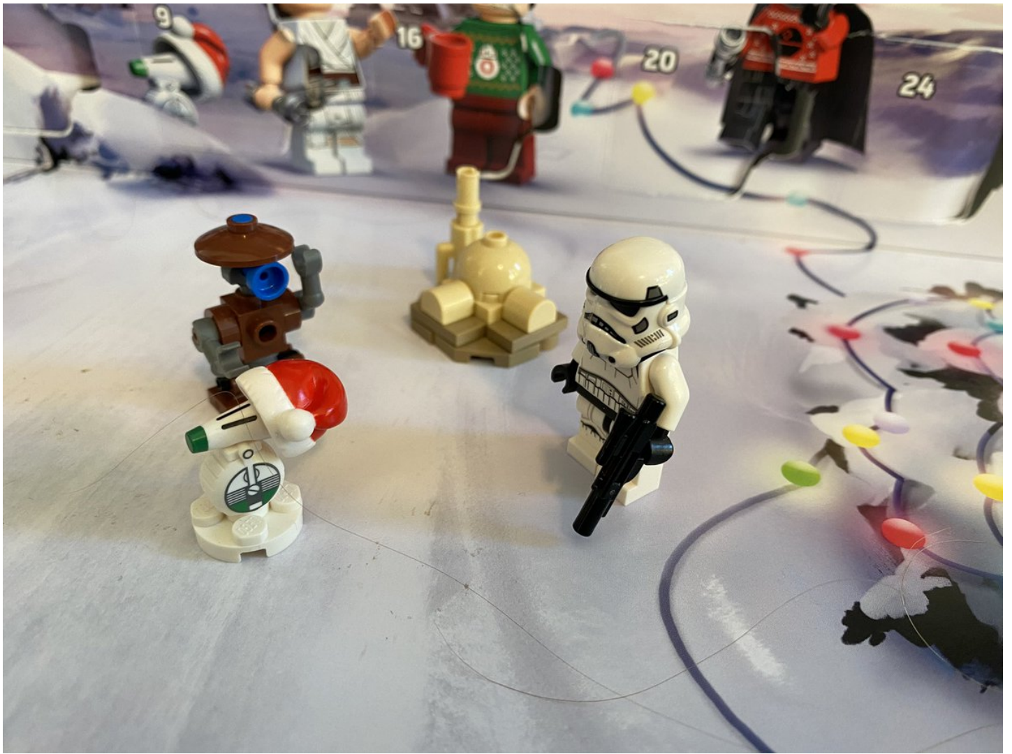
It came to pass that Po and Rey came to the starport, but there was no room.