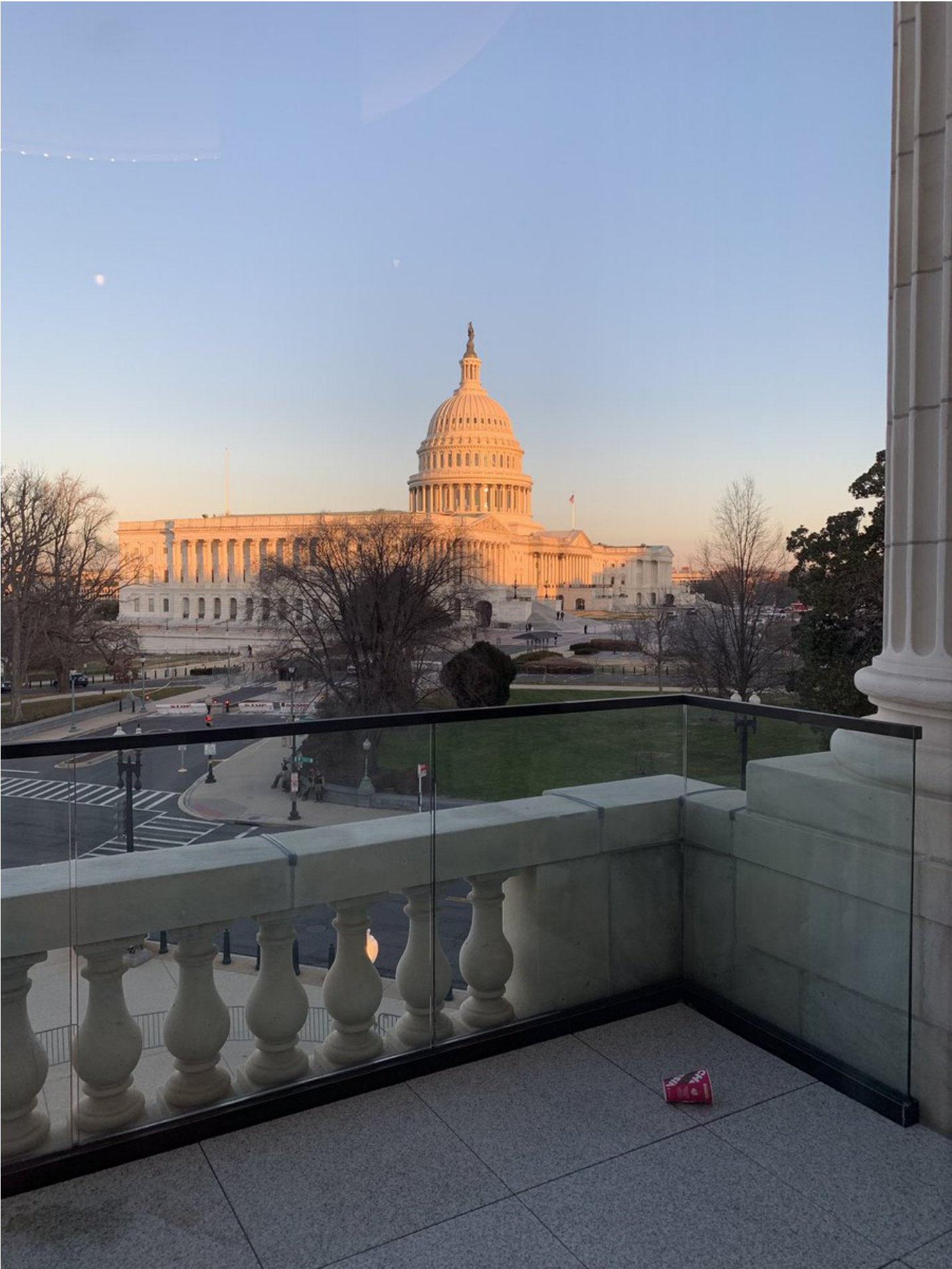
In the meantime here's a beautiful shot of the Capitol as the sun rises