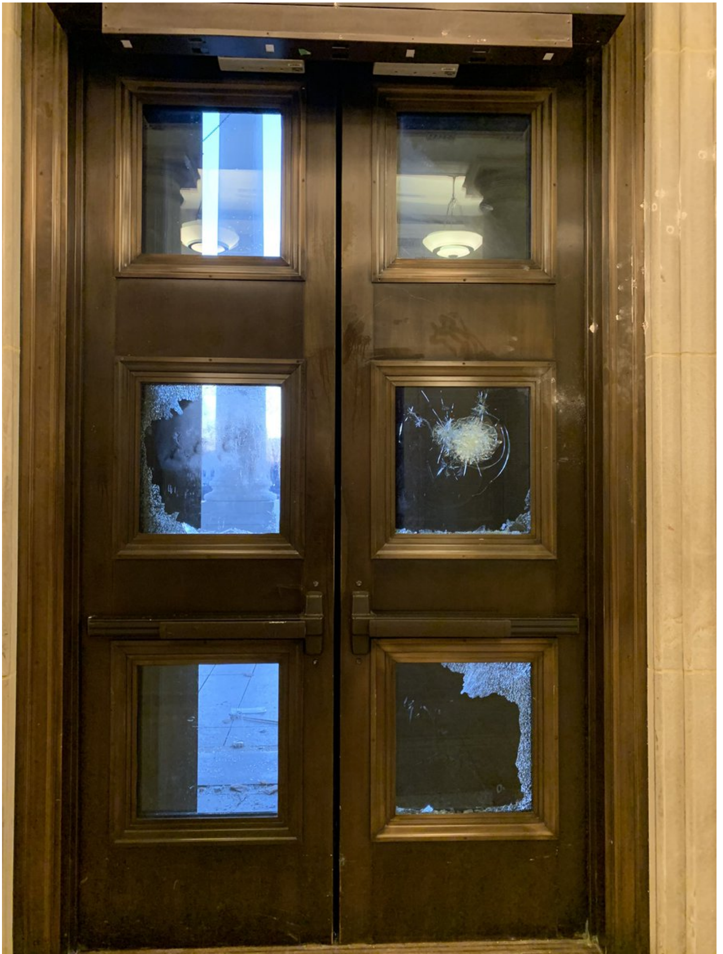
This is just outside those doors