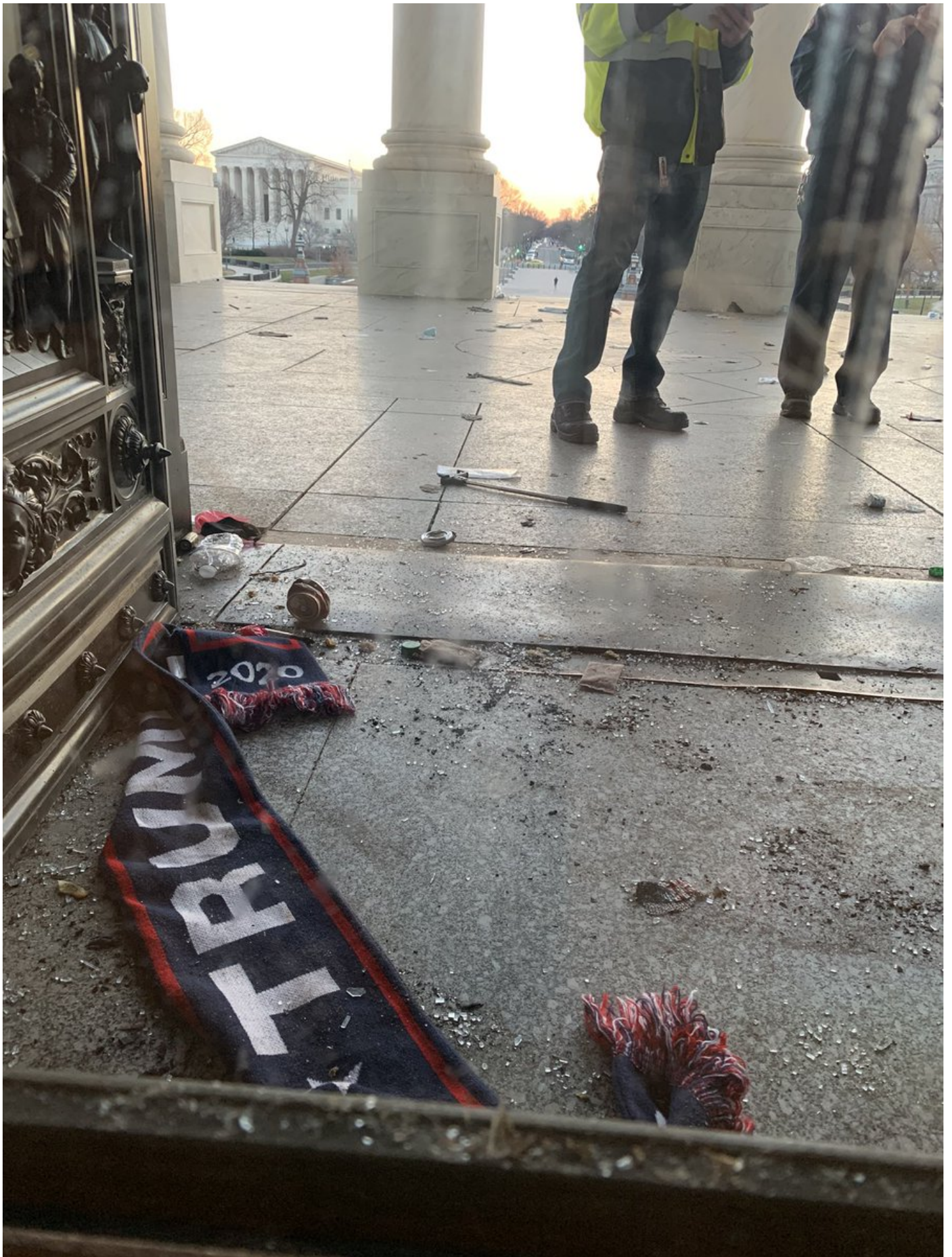
And these are the markings surrounding those doors from inside the building