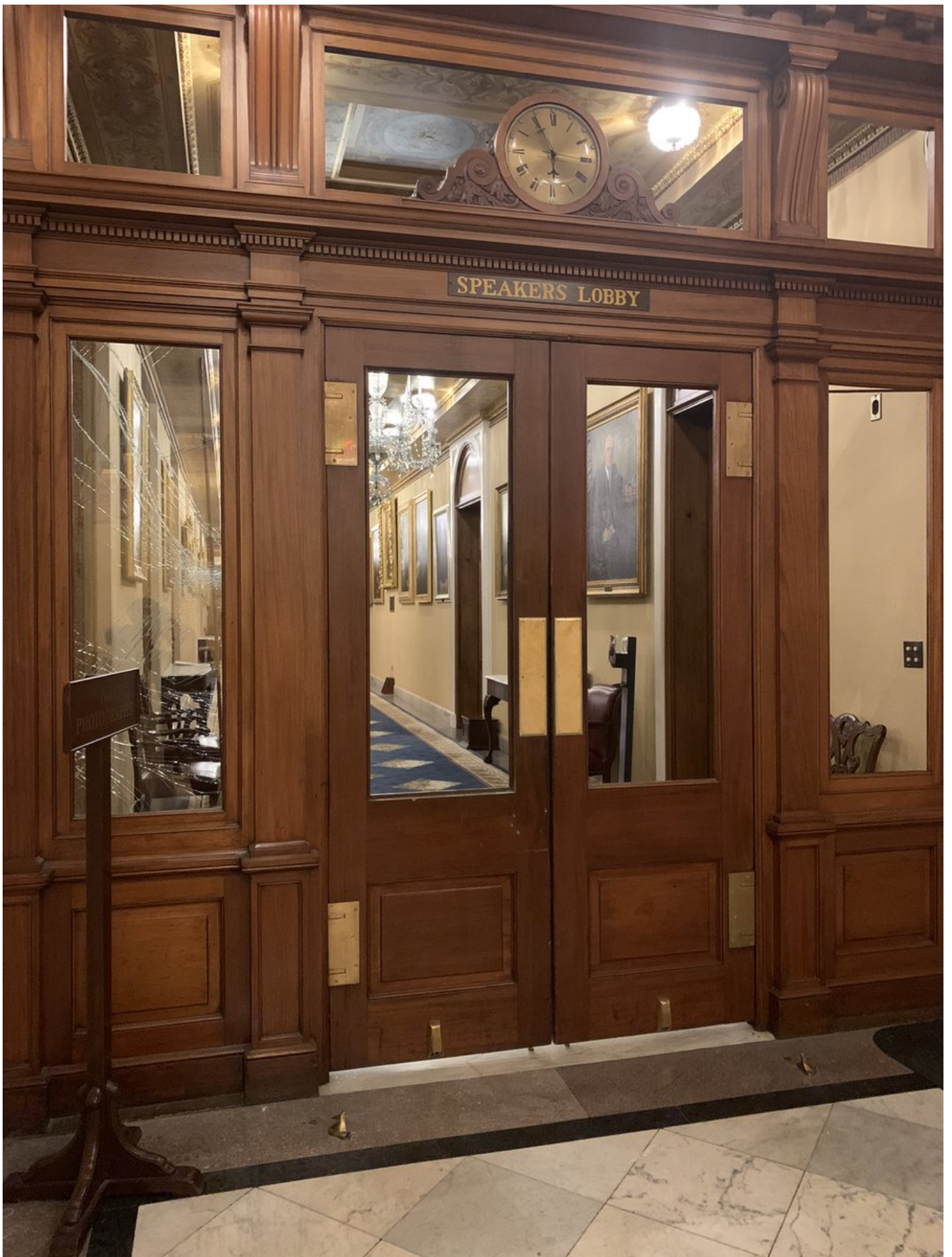
And this is the entrance to Speaker Pelosi's suit. Her wood and good placard is missing