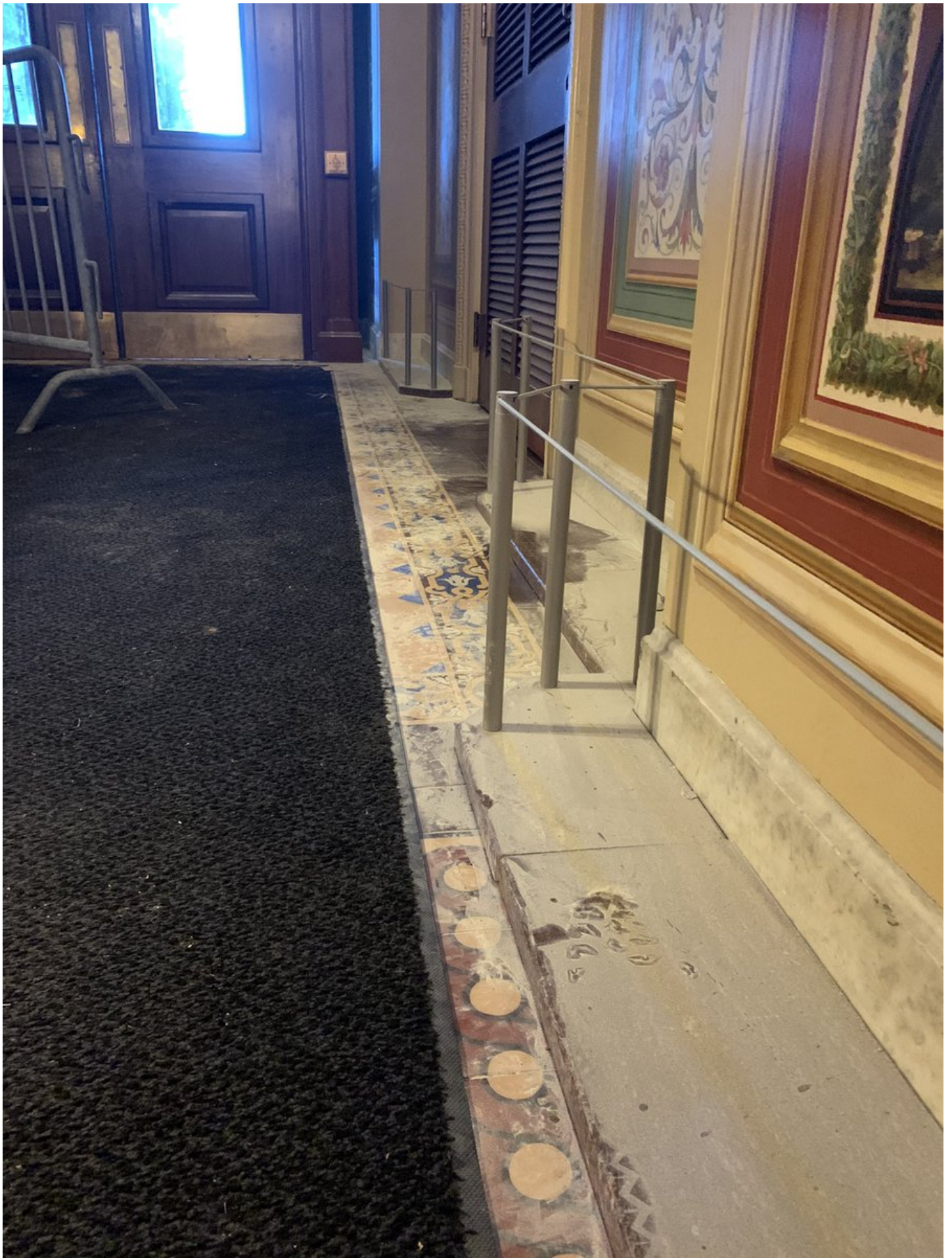
This went around social media last night but the Senate Parliamentarian office is still in the same state this morning