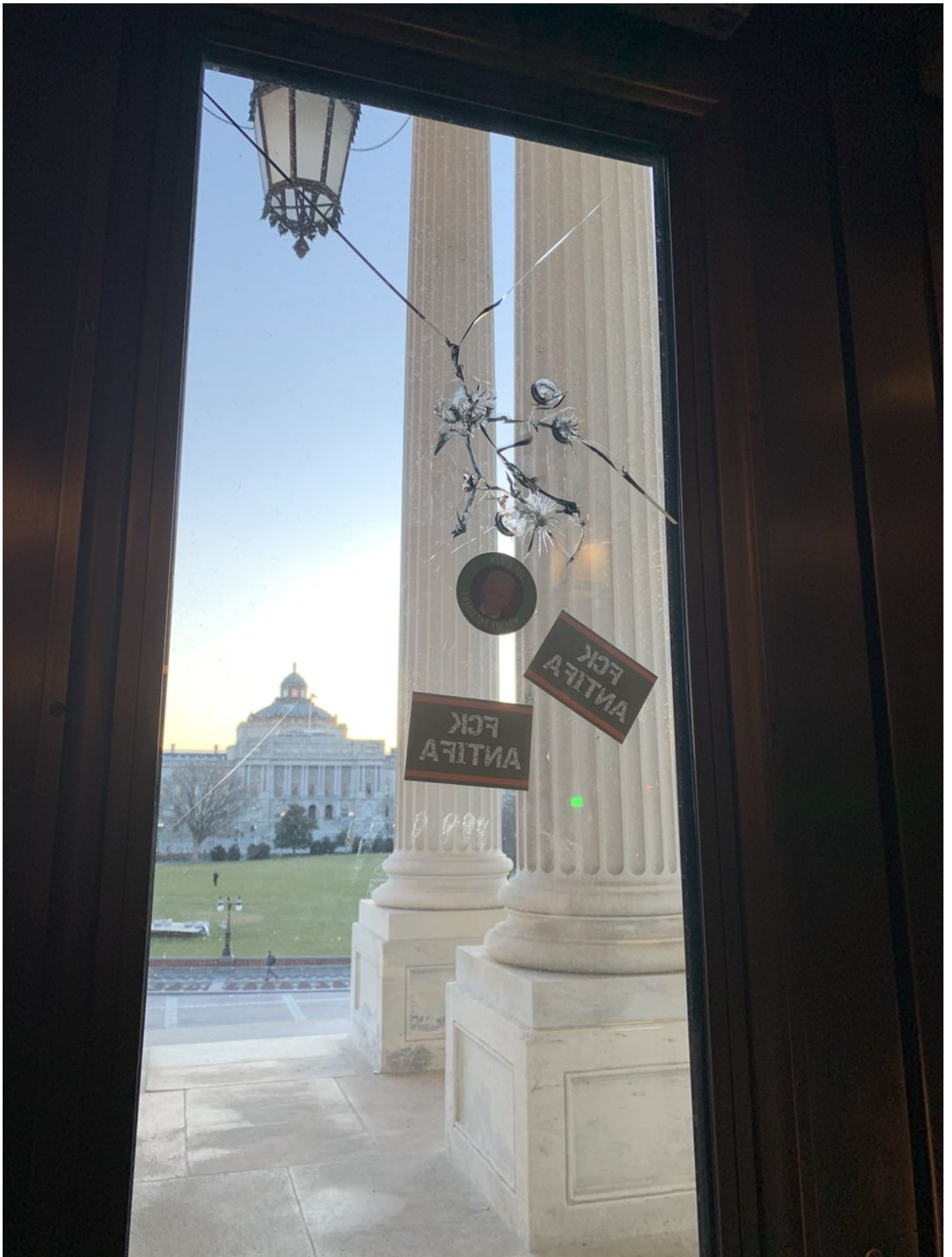
These are doors on the Senate side. That thick film is what's left of tear gas. It still makes you cough 18 hours later